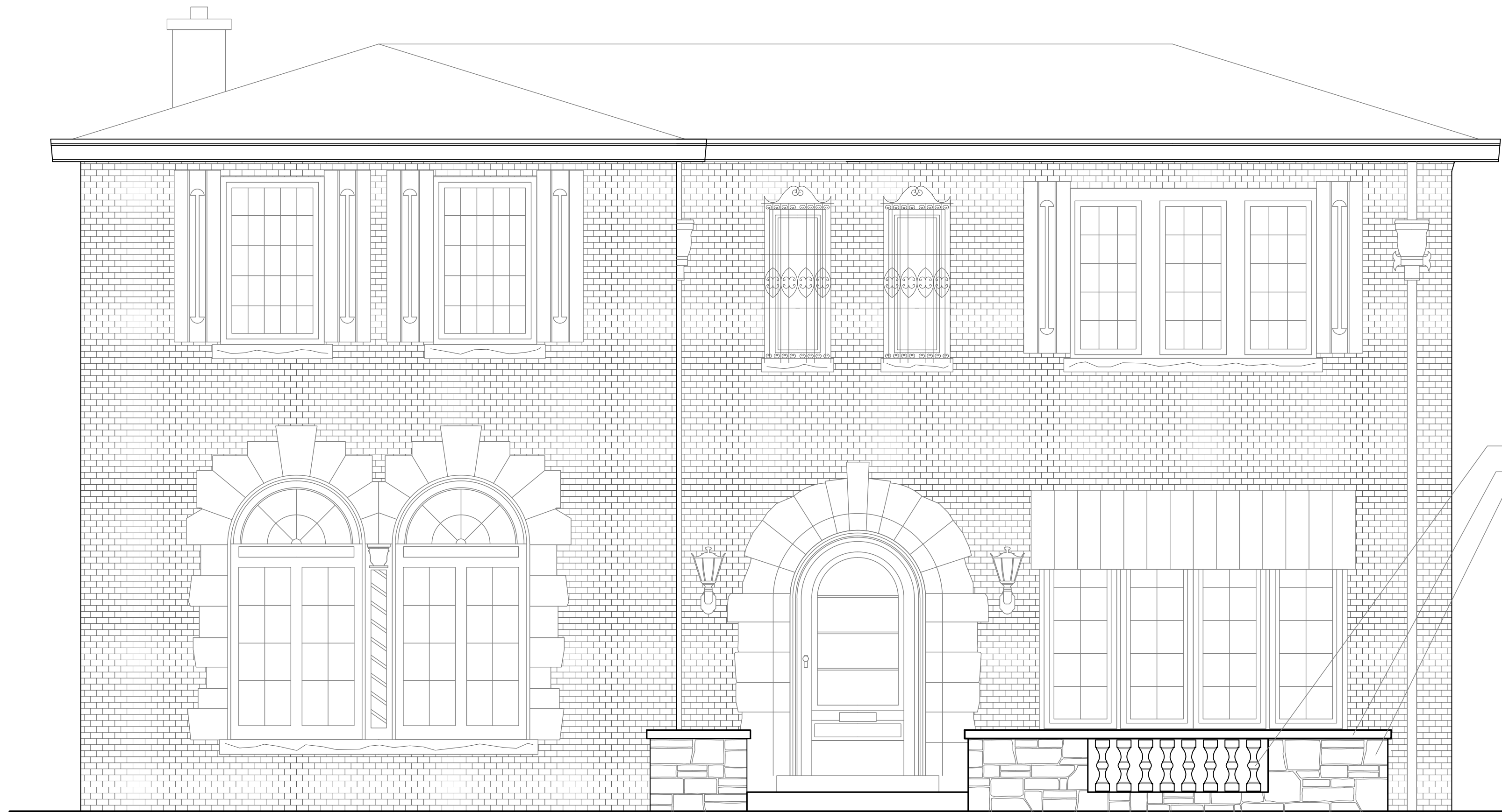
Front of Home Showing Larger Porch

3" Natural Stone Coping Re-Use Stone Spindles if Possible Masonry Knee Wall w/ Complimentary Stone Facade