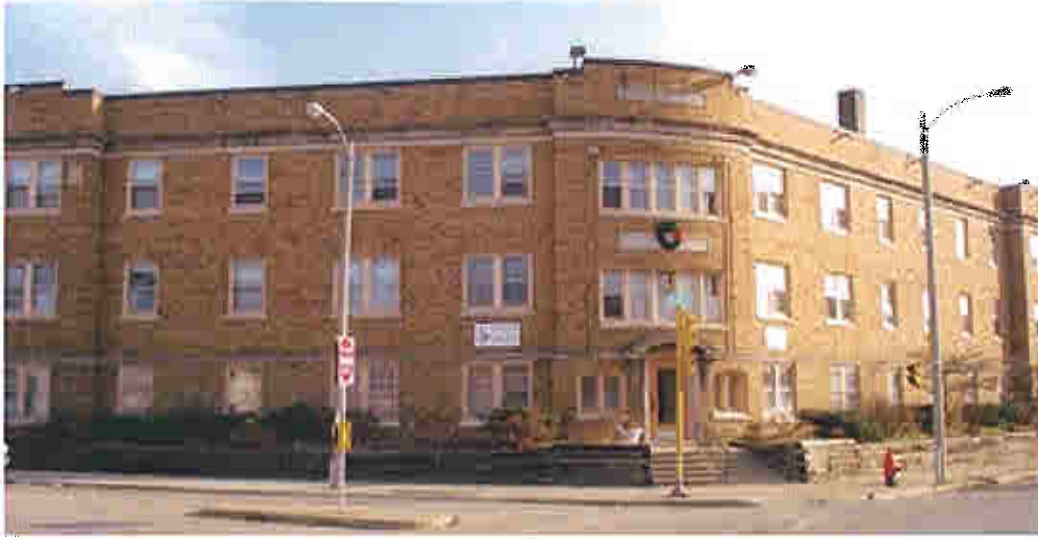
UMCS' current facility (3940 West Lisbon Avenue) is just west of the Development Site.