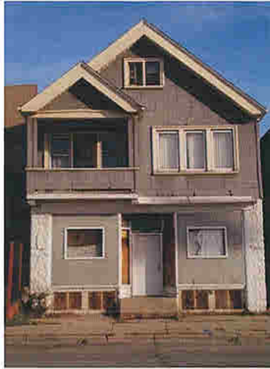
This parcel (3916 West Lisbon Avenue) is part of the Development Site.