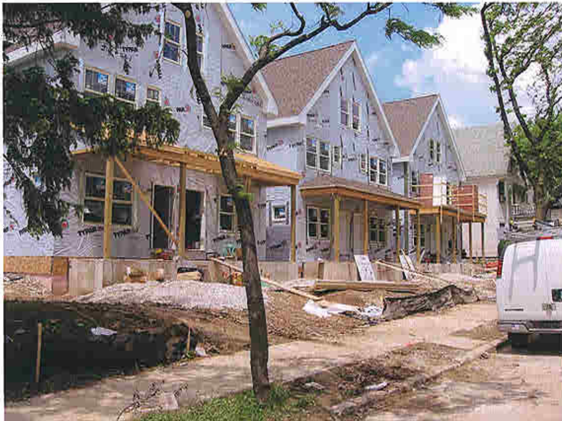
This is a picture of UMSC Townhomes (1929-1943 North 39 th Street), a 2007 WHEDA LIHTC development by UMCS. It is located north of the Development Site.