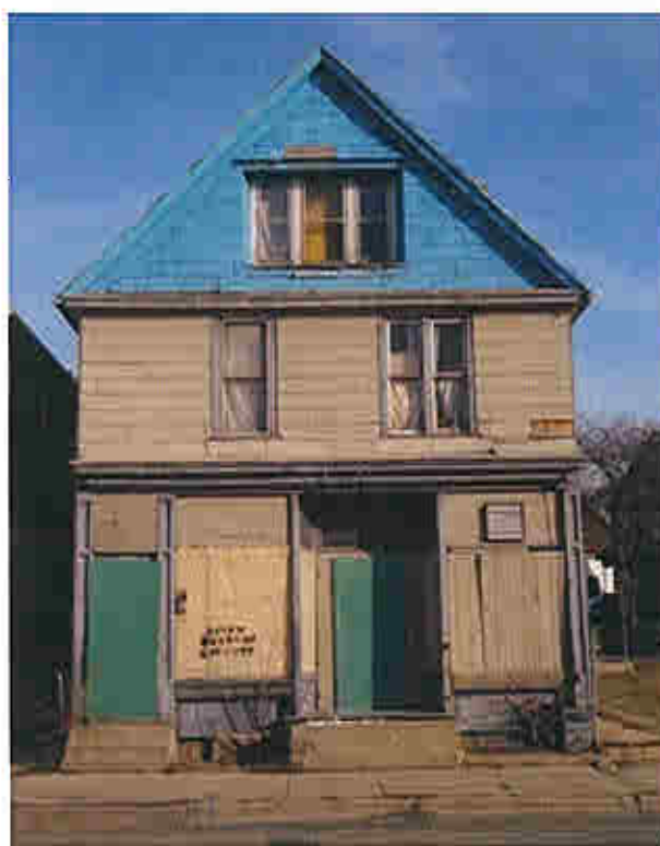
This parcel (3910 West Lisbon Avenue) is part of the Development Site.