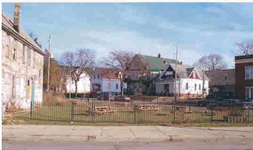
This vacant lot (3900 West Lisbon Avenue) is the easternmost parcel of the Development Site.