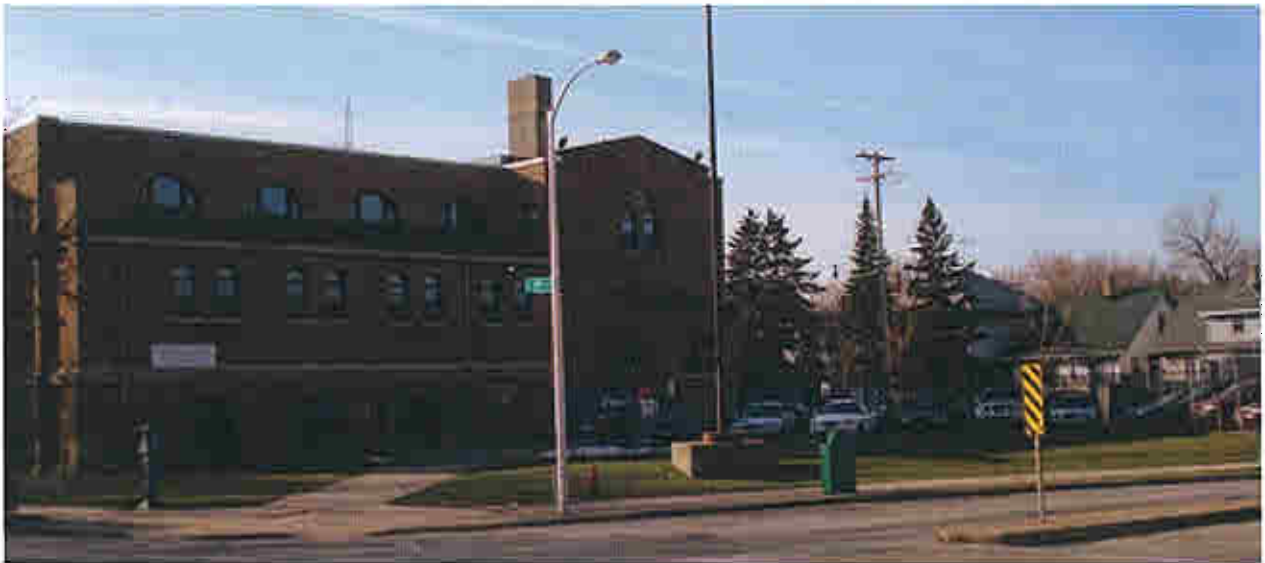
This Property (3903 West Lisbon Avenue) is south of the Development Site.