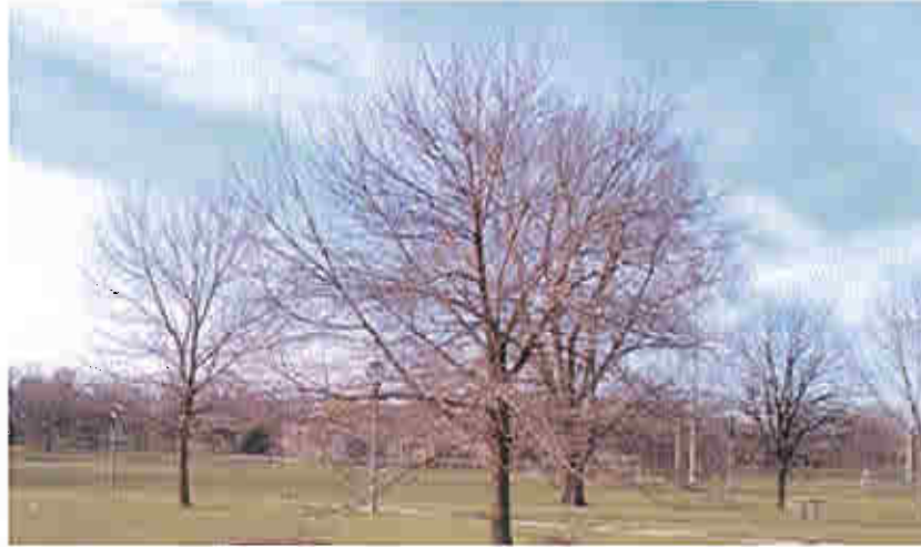
Washington Park, a 124 acre Milwaukee County Park designed by Frederick Law Olmsted is southeast of the Development Site.