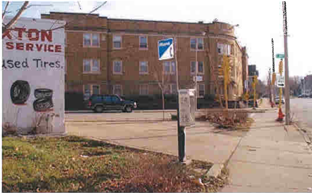
This Property (4002 West Lisbon Avenue) is just west of UMCS' current facility.