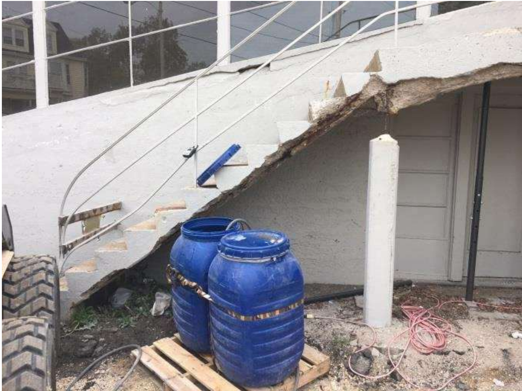
Existing Conditions Photo 1