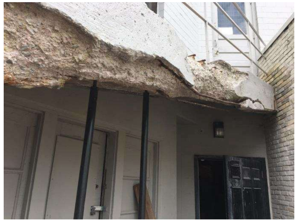
Details of major deterioration showing temporary shoring posts (black).