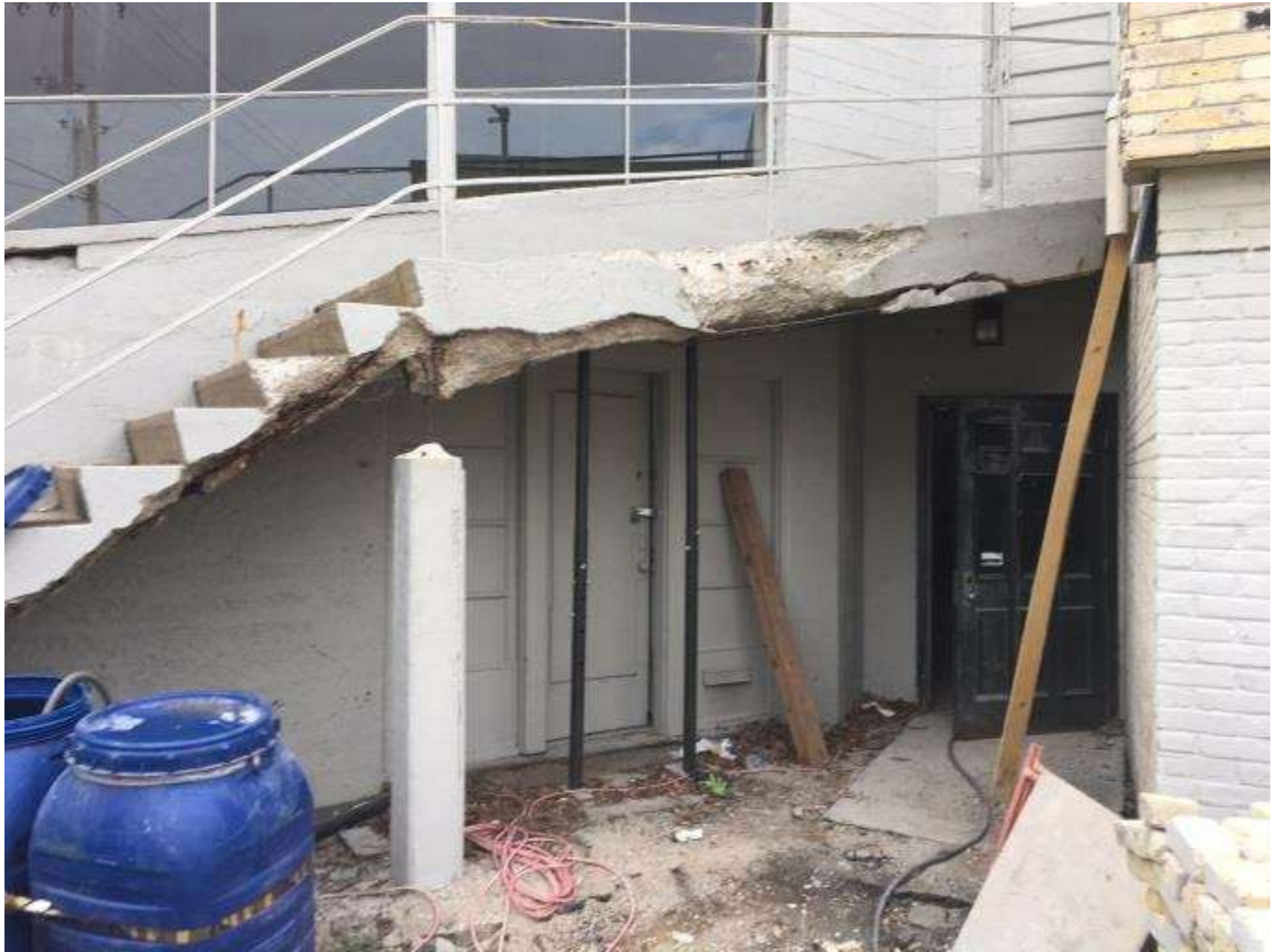
Existing Conditions Photo 2