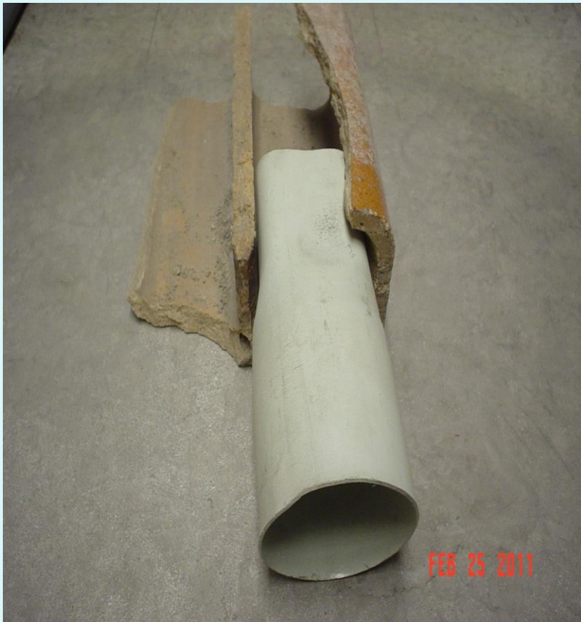
PVC Pipe in Clay Duct