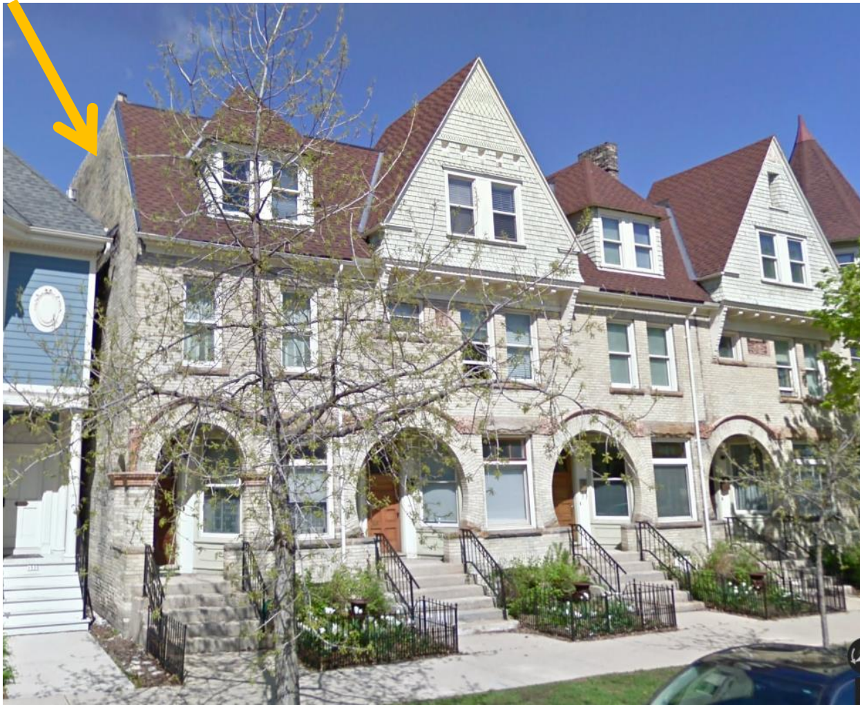
2009 photo of Cass Street elevation with arrow highlighting rebuild area.