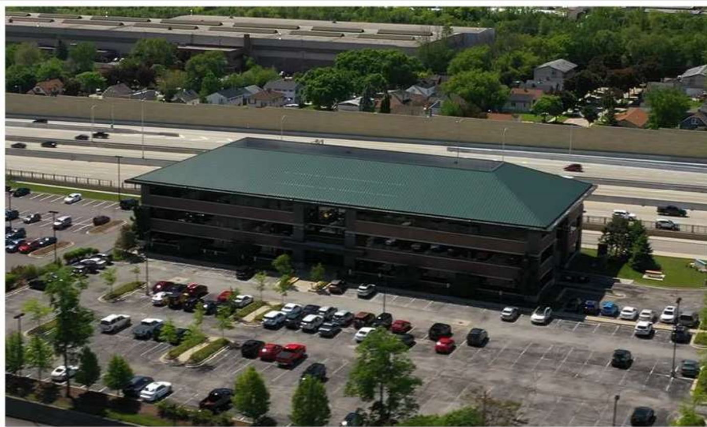
9000 W CHESTER