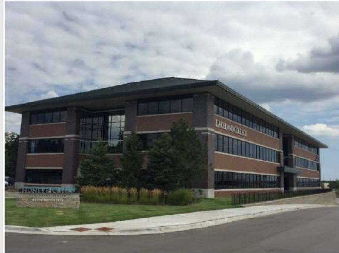
EXISTING COLLEGE TENANT