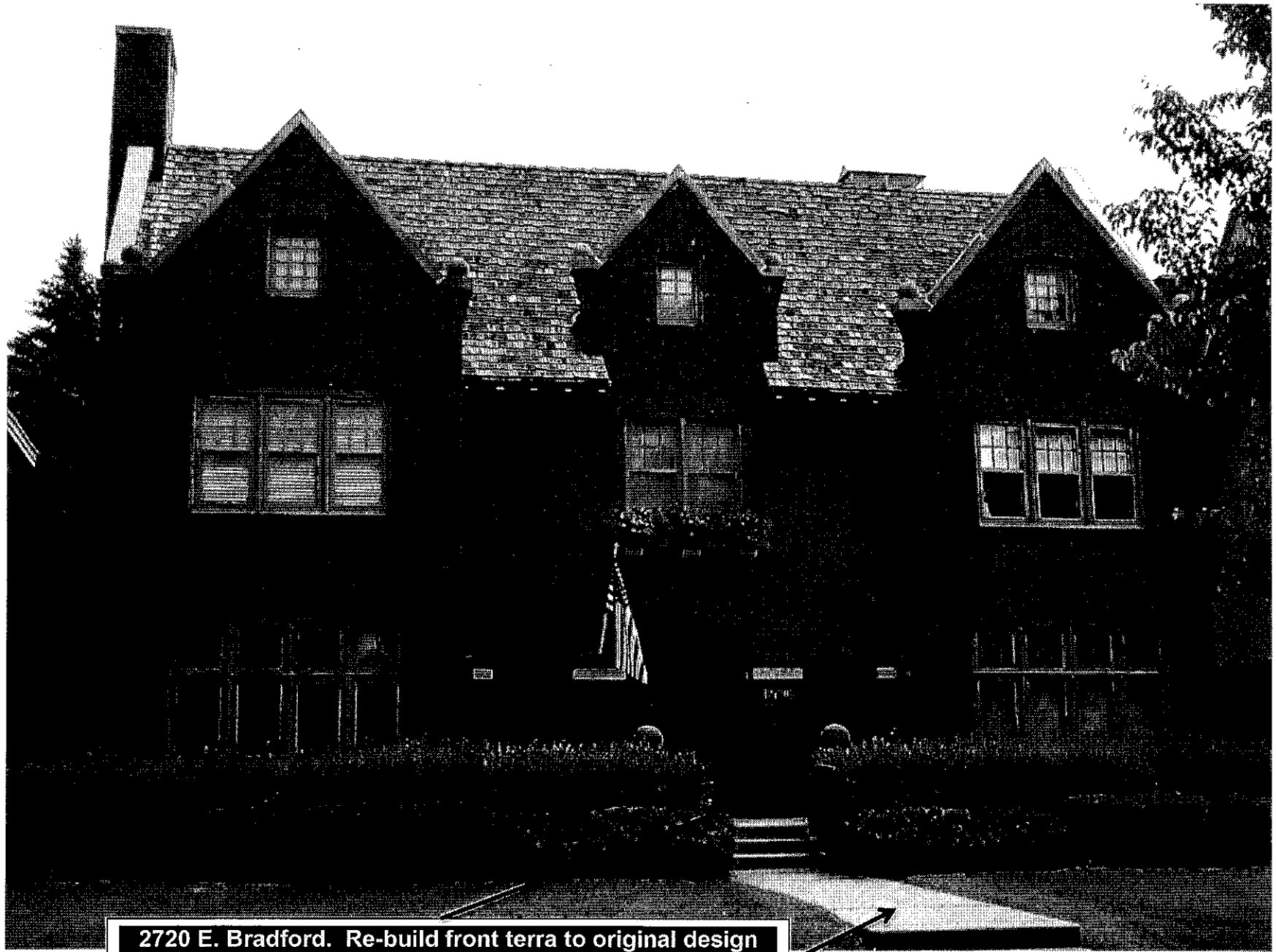
2720 E. Bradford. Re-build front terra to original design and size. Pour new concrete service walk.