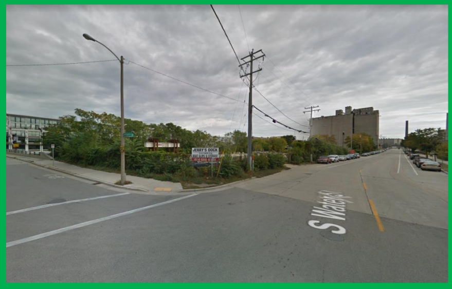
View from Water and Pittsburgh looking south-east