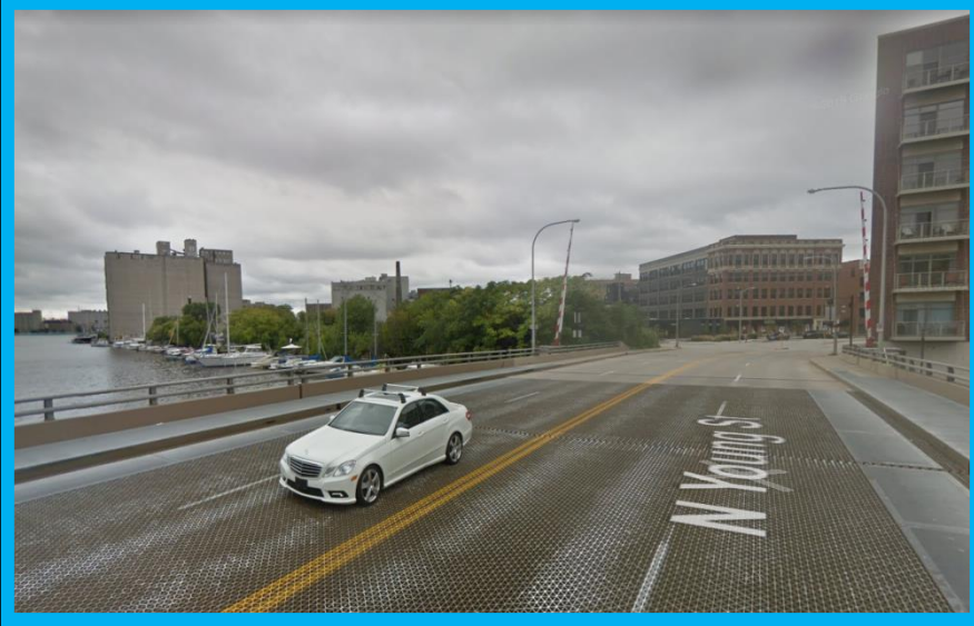
View East Pittsburgh Ave bridge looking south