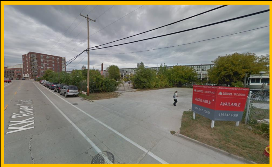
View from South Water Street looking north