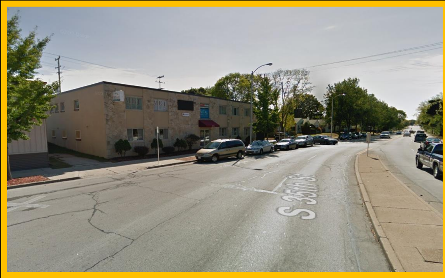
View from South 35 th Street looking south