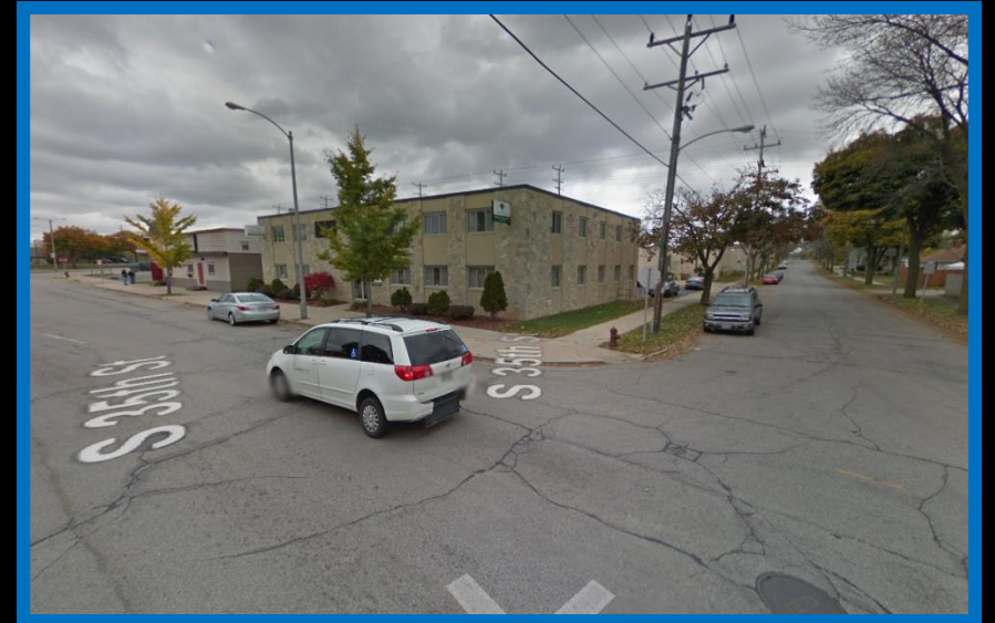
View from Montana and 35 th looking north-east