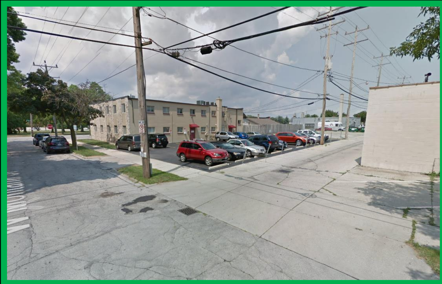
View from West Montana Street looking north-west