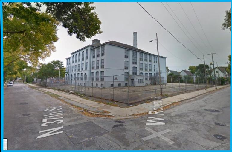
View southwest from West Roberts St and North 37th St