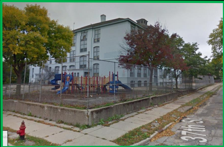
View northwest from West Walnut St and North 37th St