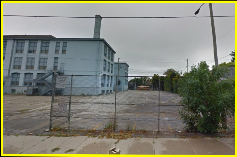
View south from West Roberts St