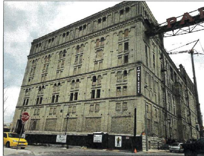
proposed day view