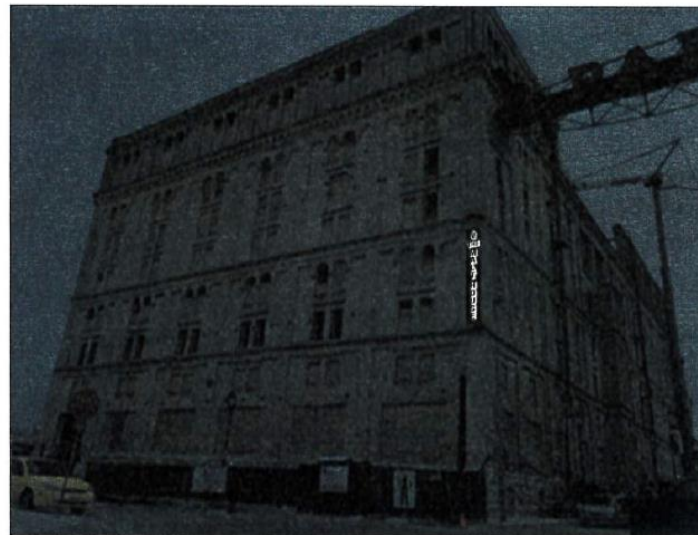
proposed night view