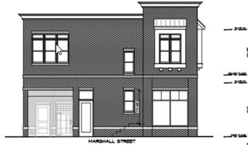
PROPOSED (EAST) SIDE ELEVATION 1/4" = 1'-0"