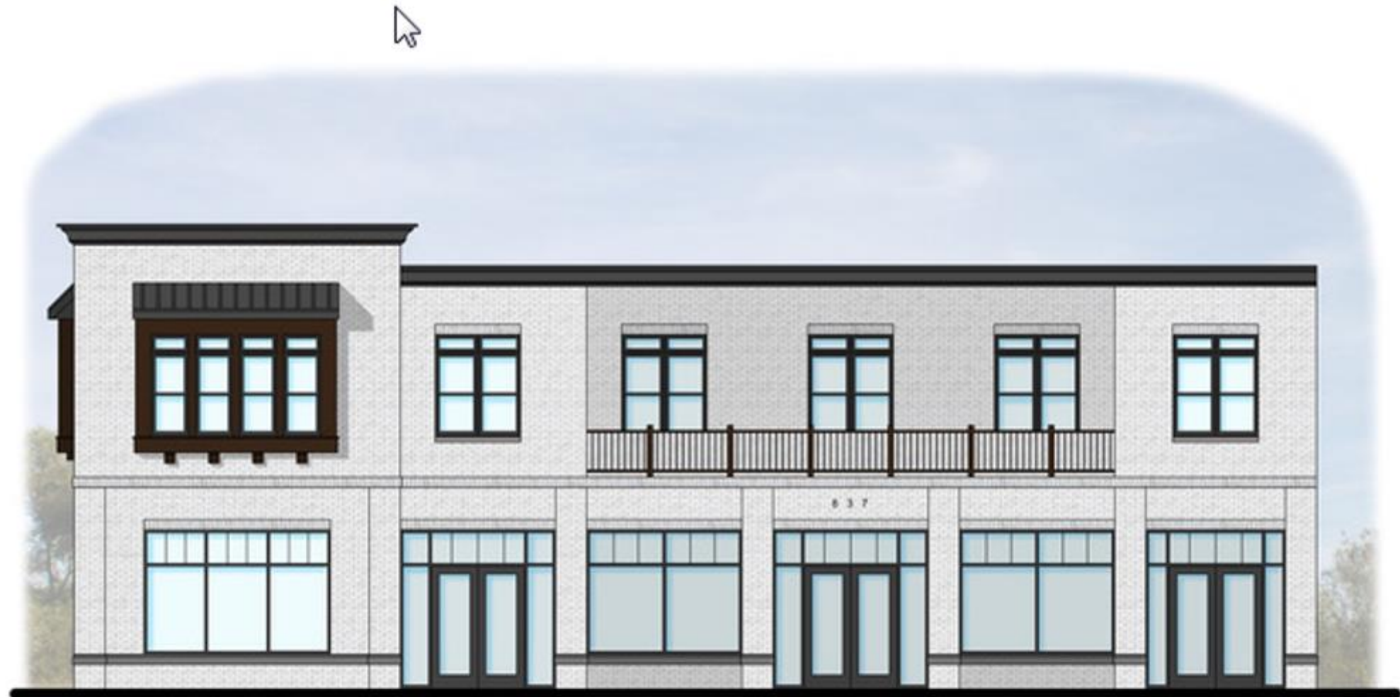
BRADY STREET VIEW