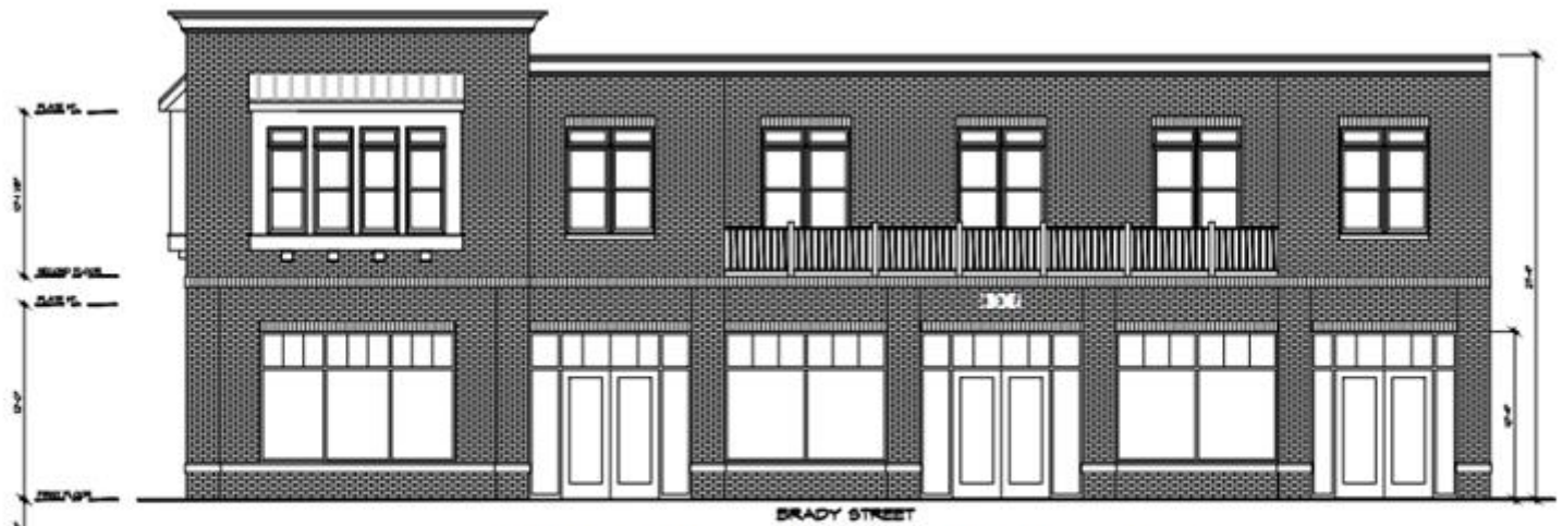
PROPOSED (NORTH) FRONT ELEVATION 1/4" = 1'-0"