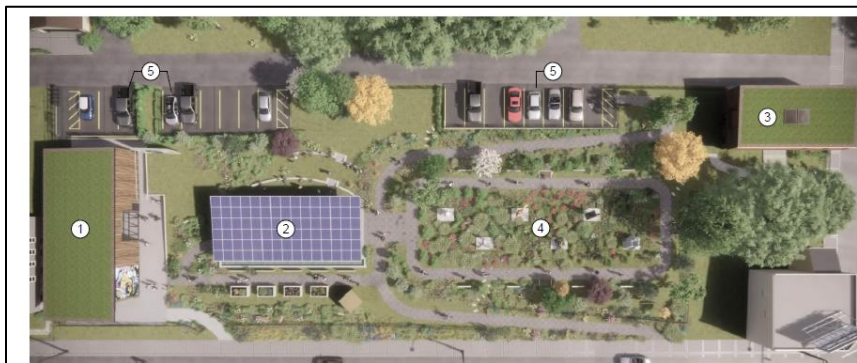
2 Rendered Aerial View