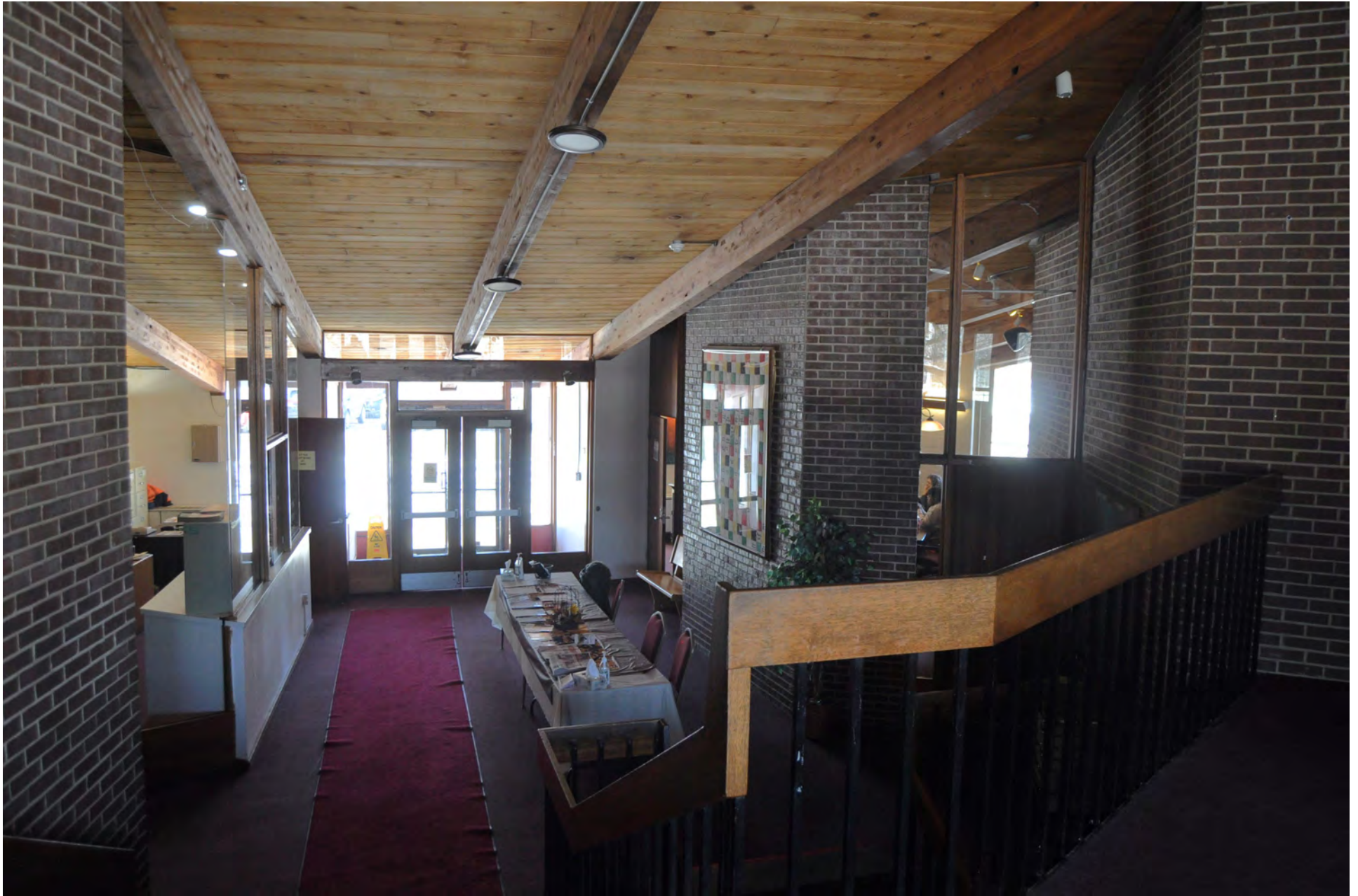
13 of 19: Narthex interior, looking west.