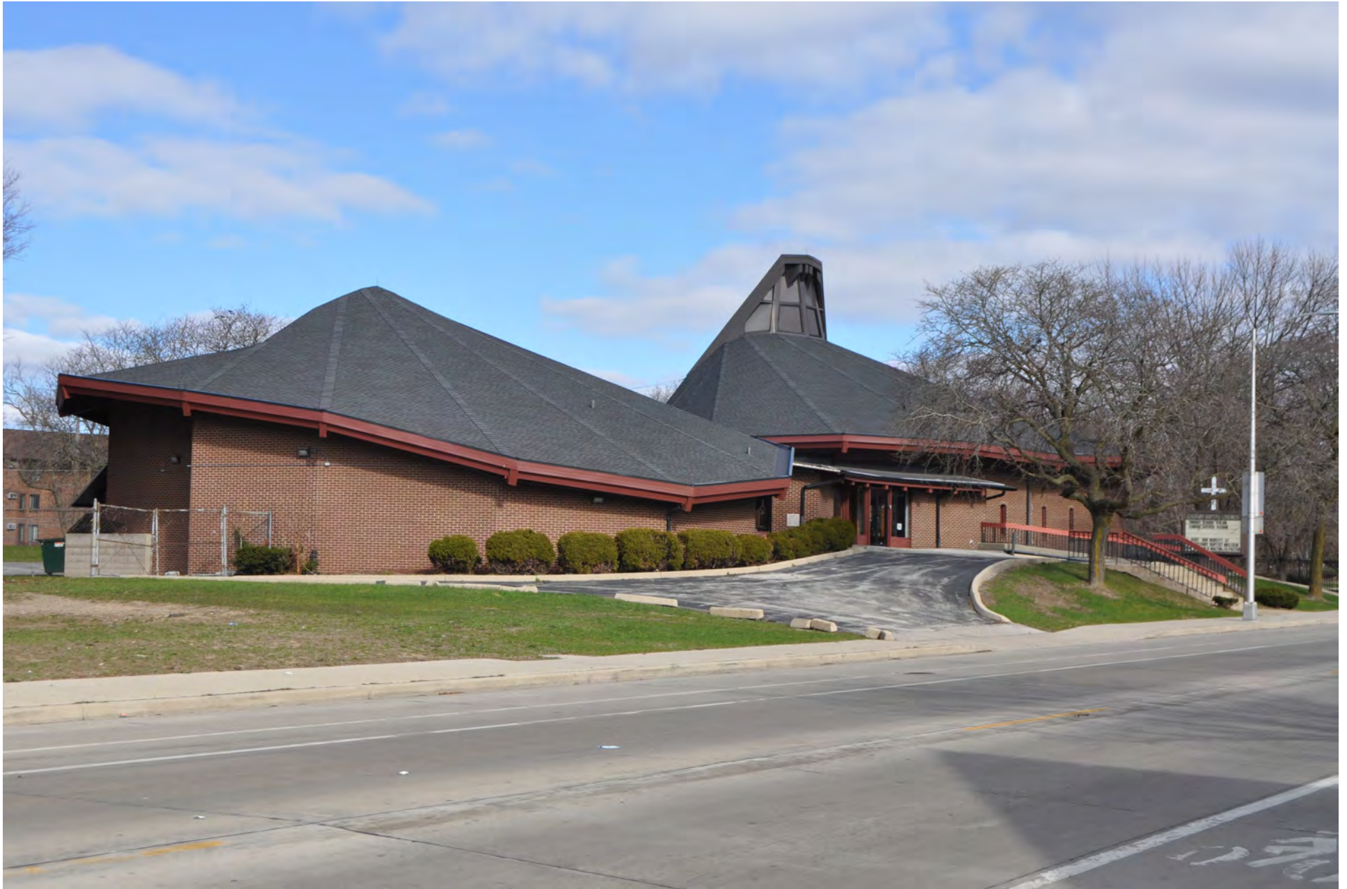
1 of 19: East (primary) elevation, looking northwest; fellowship hall at left.