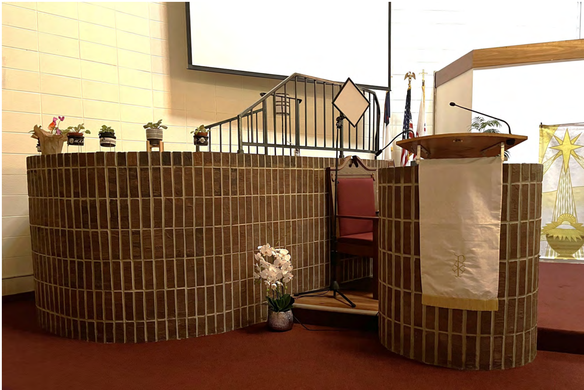
11 of 19: Sanctuary interior, detail of baptismal pool and lectern, looking west.