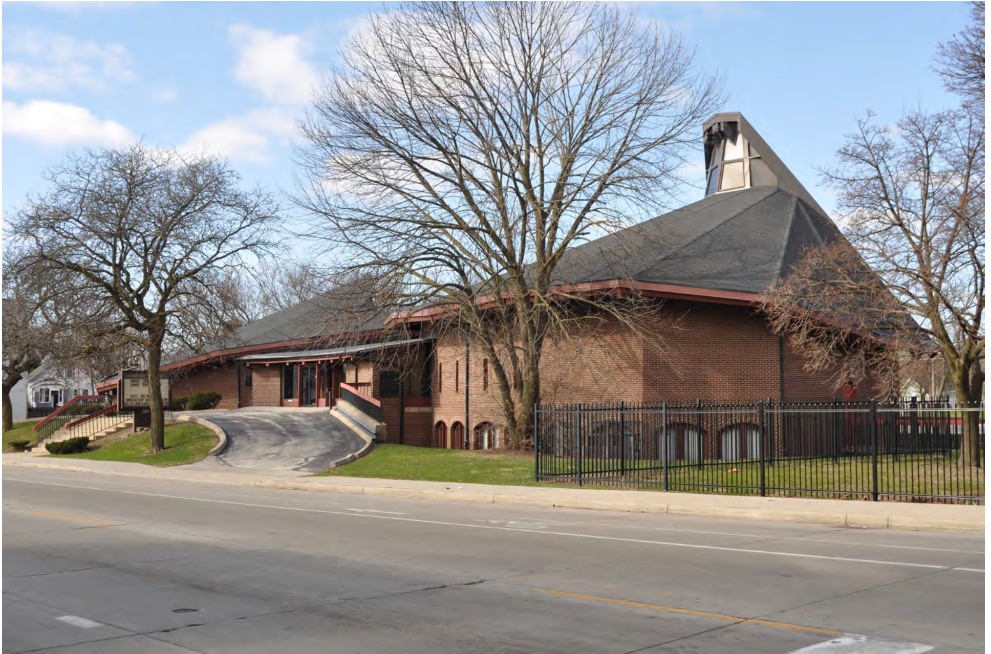
3 of 19: East (primary) elevation, looking south; sanctuary at right.