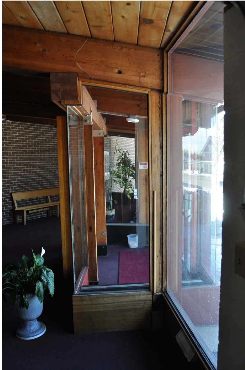
15 of 19: Narthex interior, detail of east vestibule, looking north.