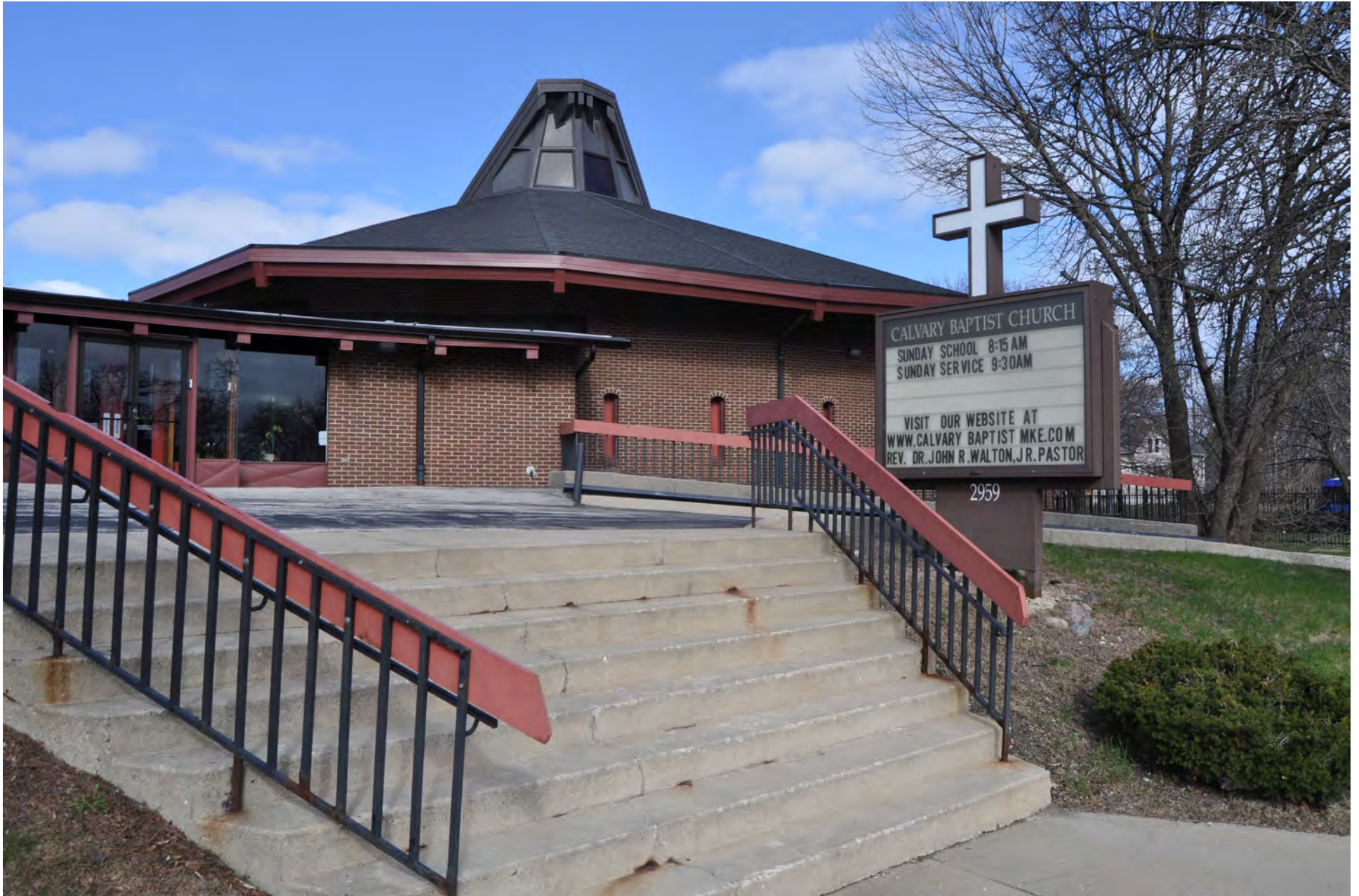
4 of 19: East elevation, detail of exterior stairs, looking northwest.