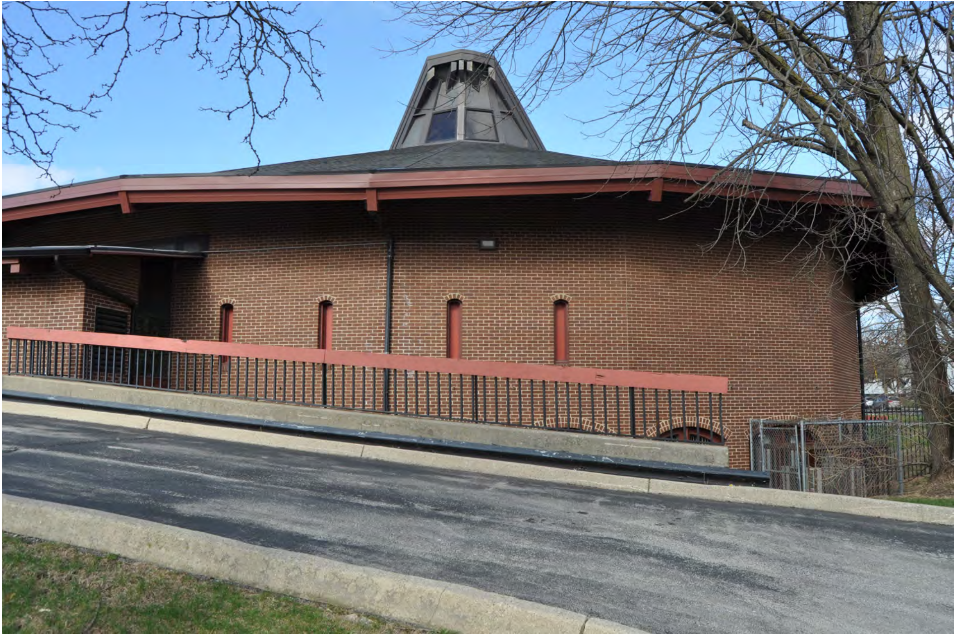
5 of 19: East elevation, detail of ramp and sanctuary windows, looking west.