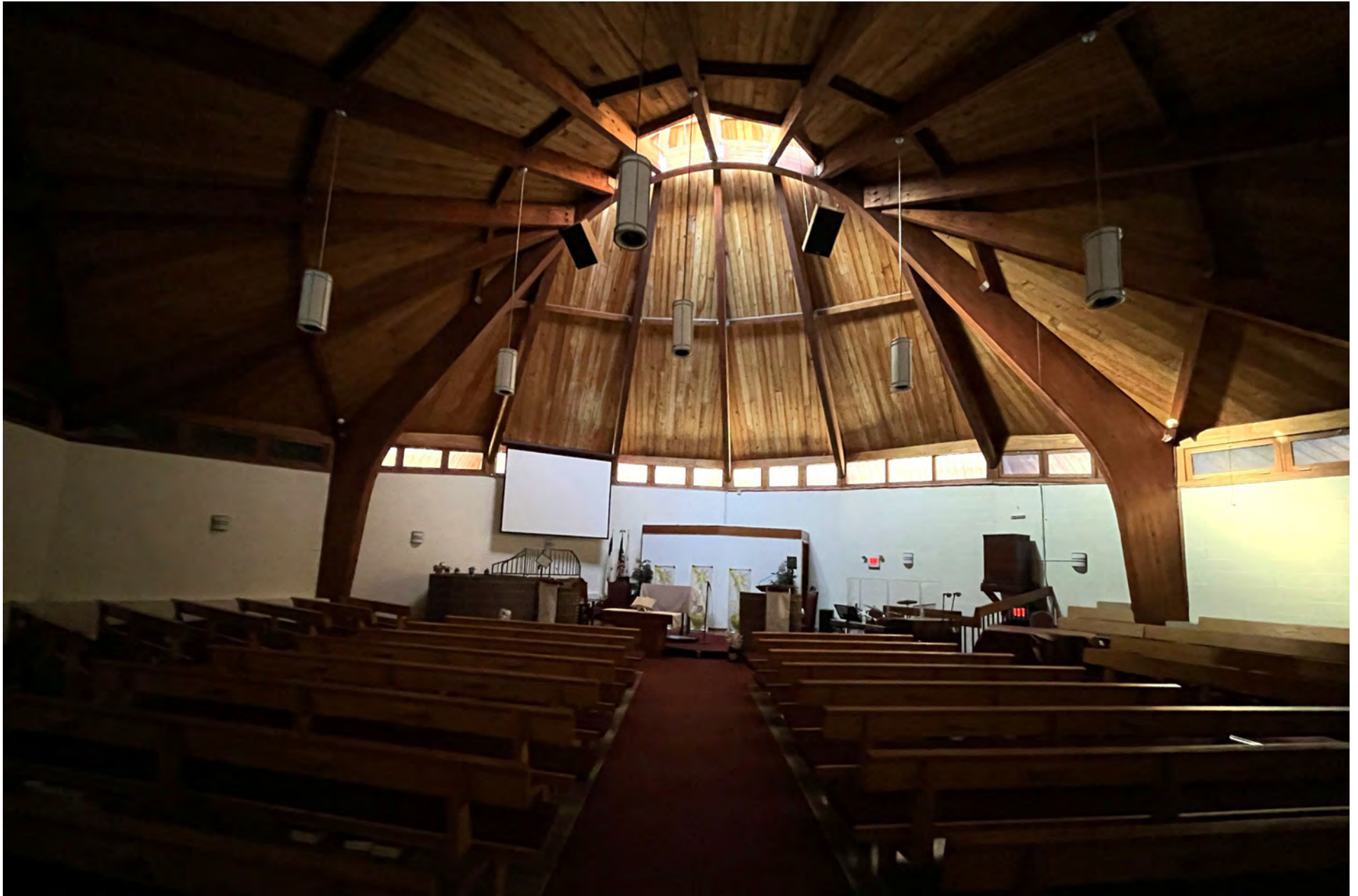
9 of 19: Sanctuary interior, looking northwest towards chancel.