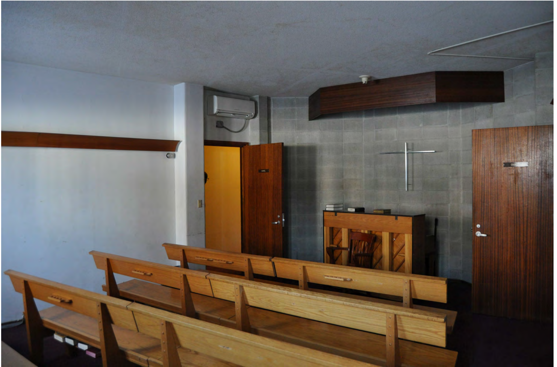
19 of 19: Chapel interior, looking southeast.