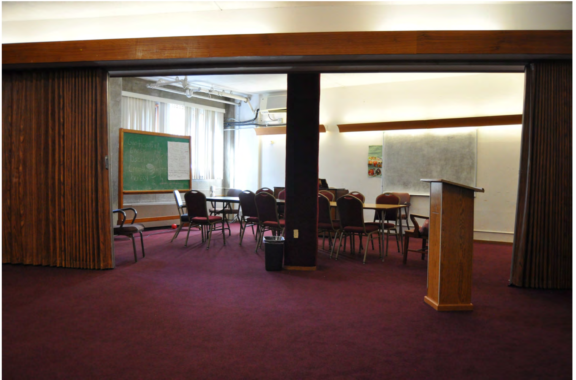
18 of 19: Classroom interior, looking northwest.