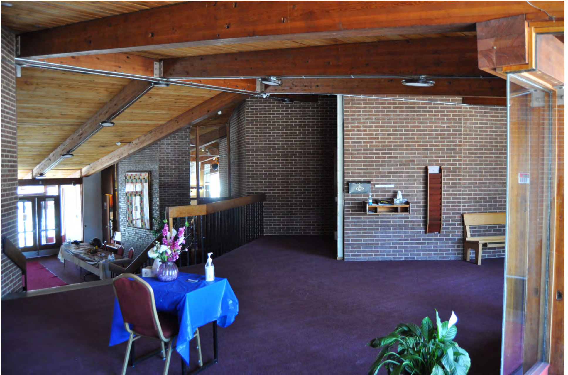
14 of 19: Narthex interior, looking northwest.