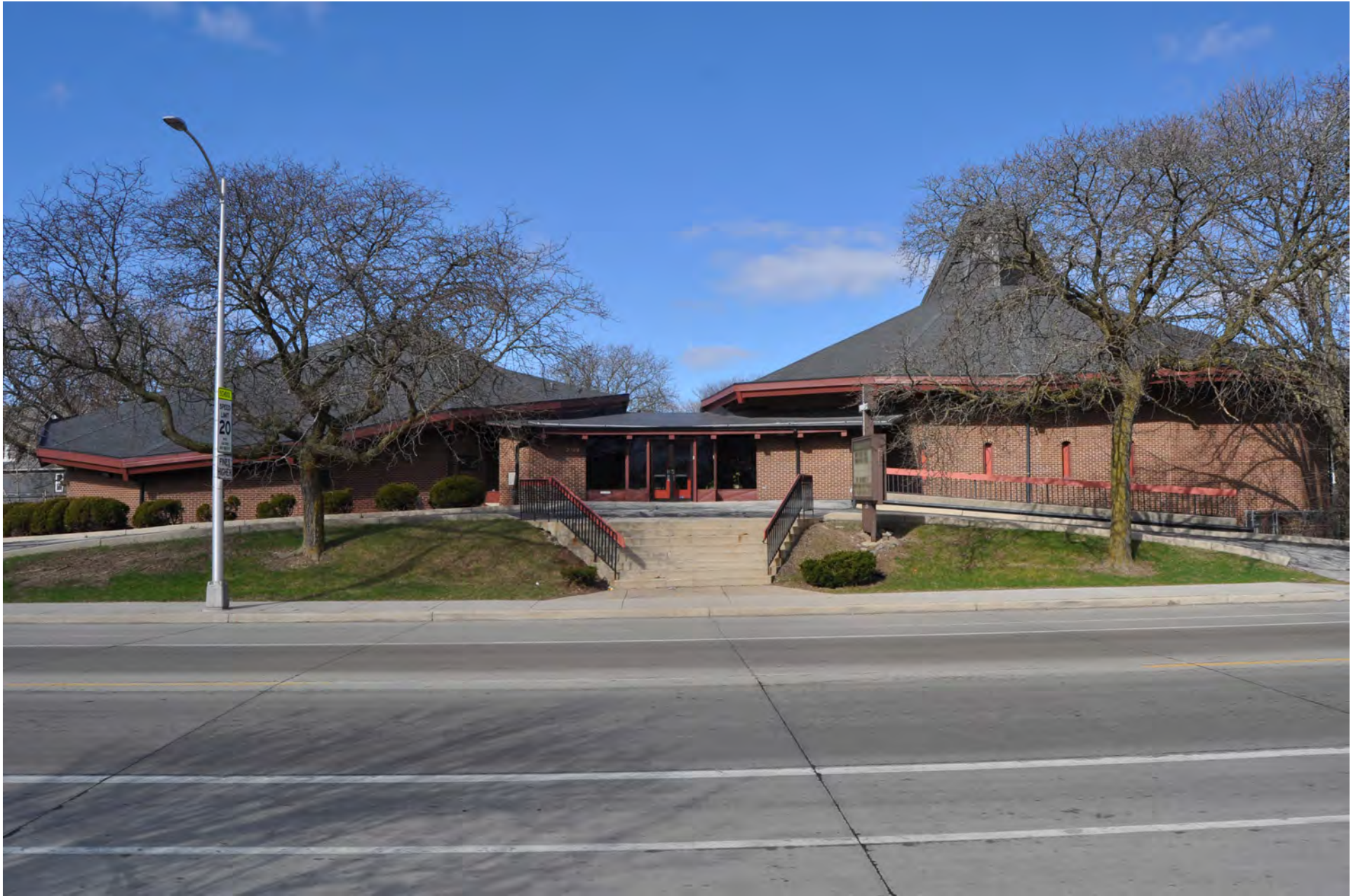
2 of 19: East (primary) elevation, looking west.