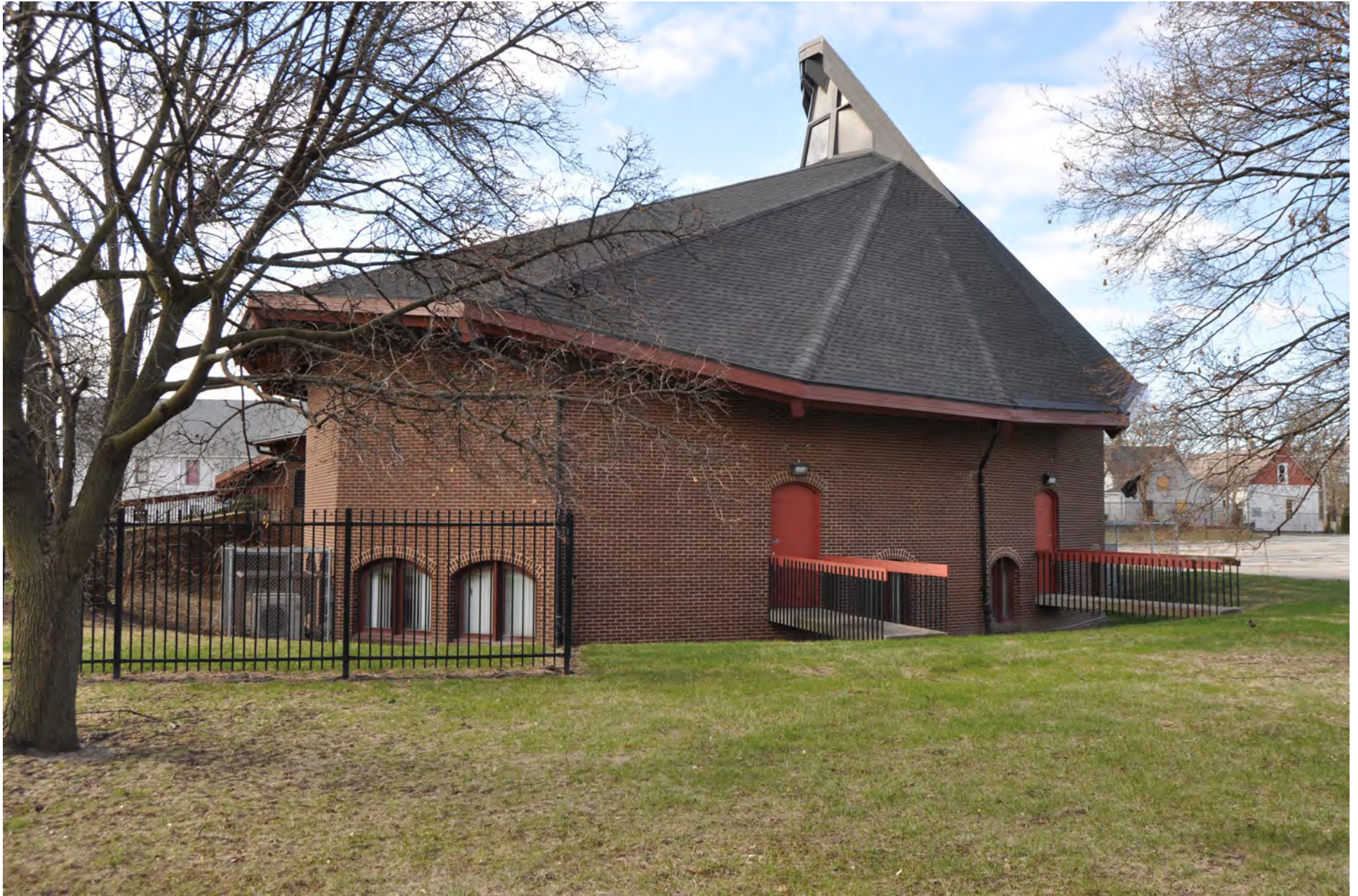
6 of 19: North elevation, looking south.