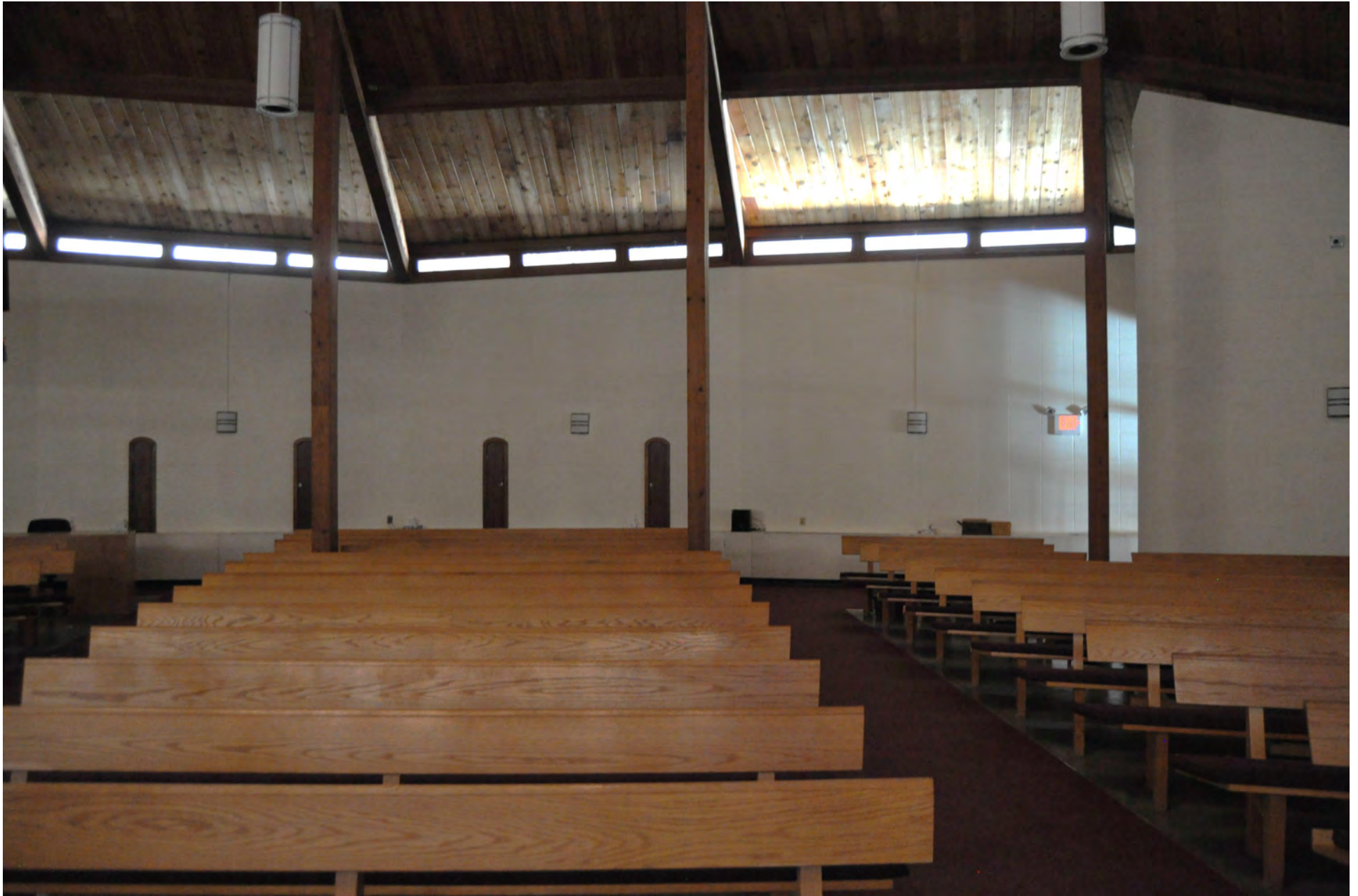
10 of 19: Sanctuary interior, looking southeast.