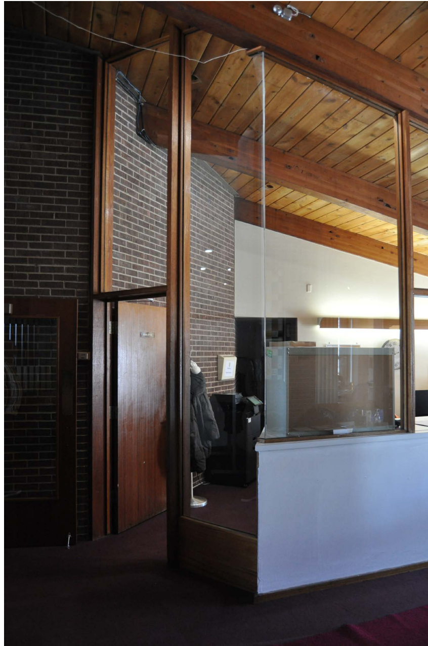
16 of 19: Narthex interior, detail of reception area, looking southwest.