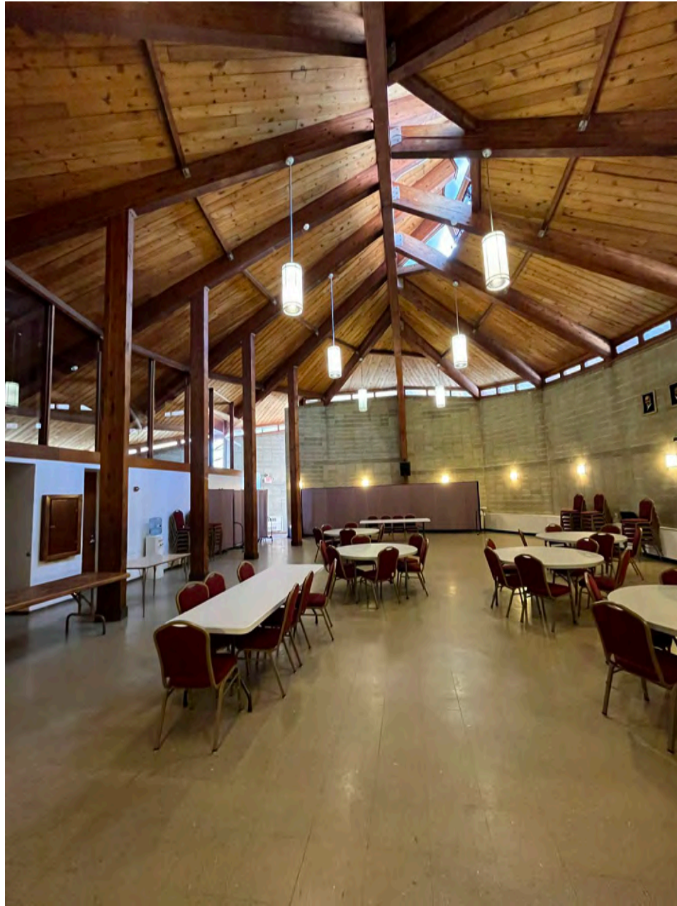
12 of 19: Fellowship hall interior, looking southeast.