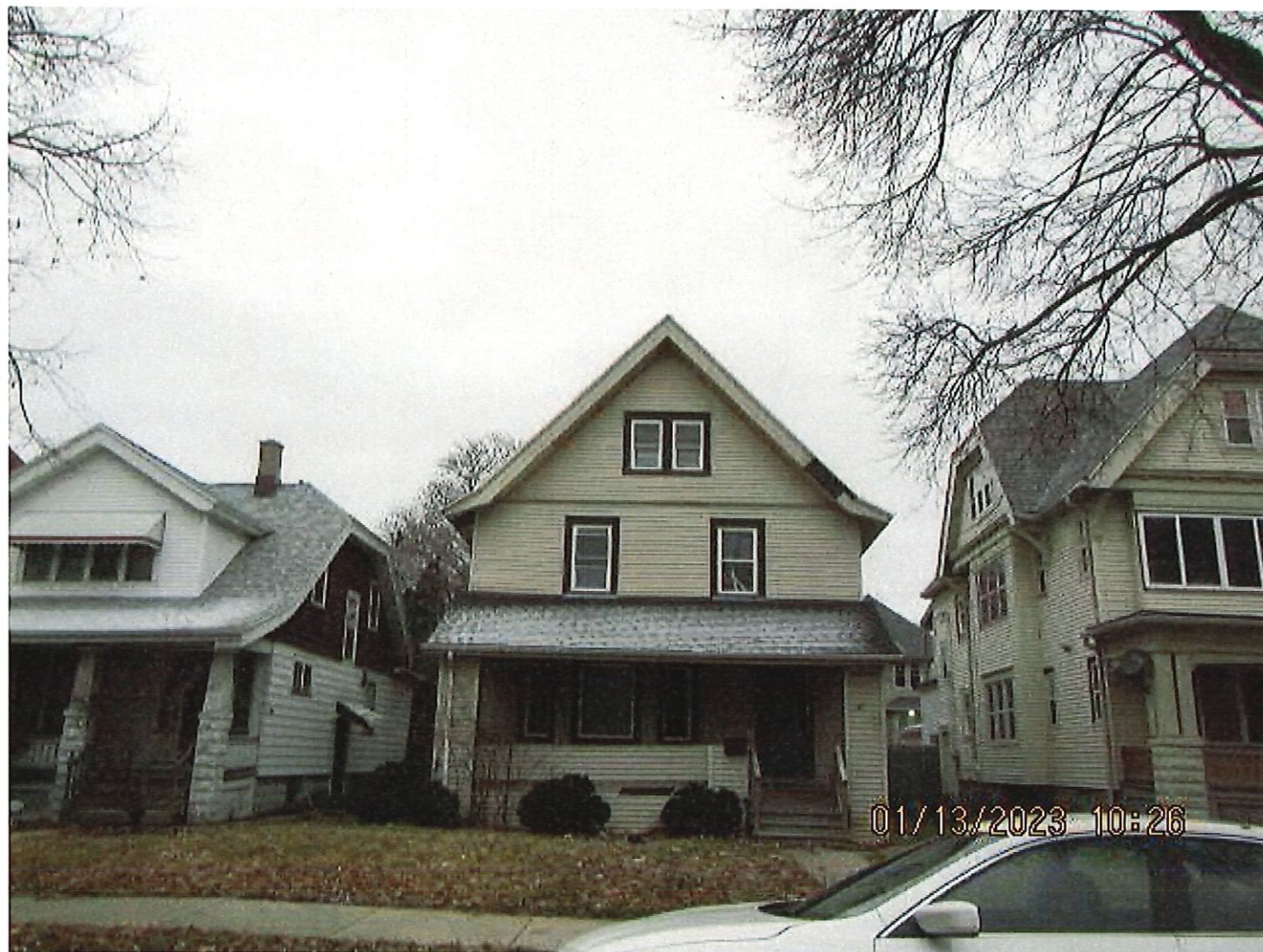
2741 North 40 th Street