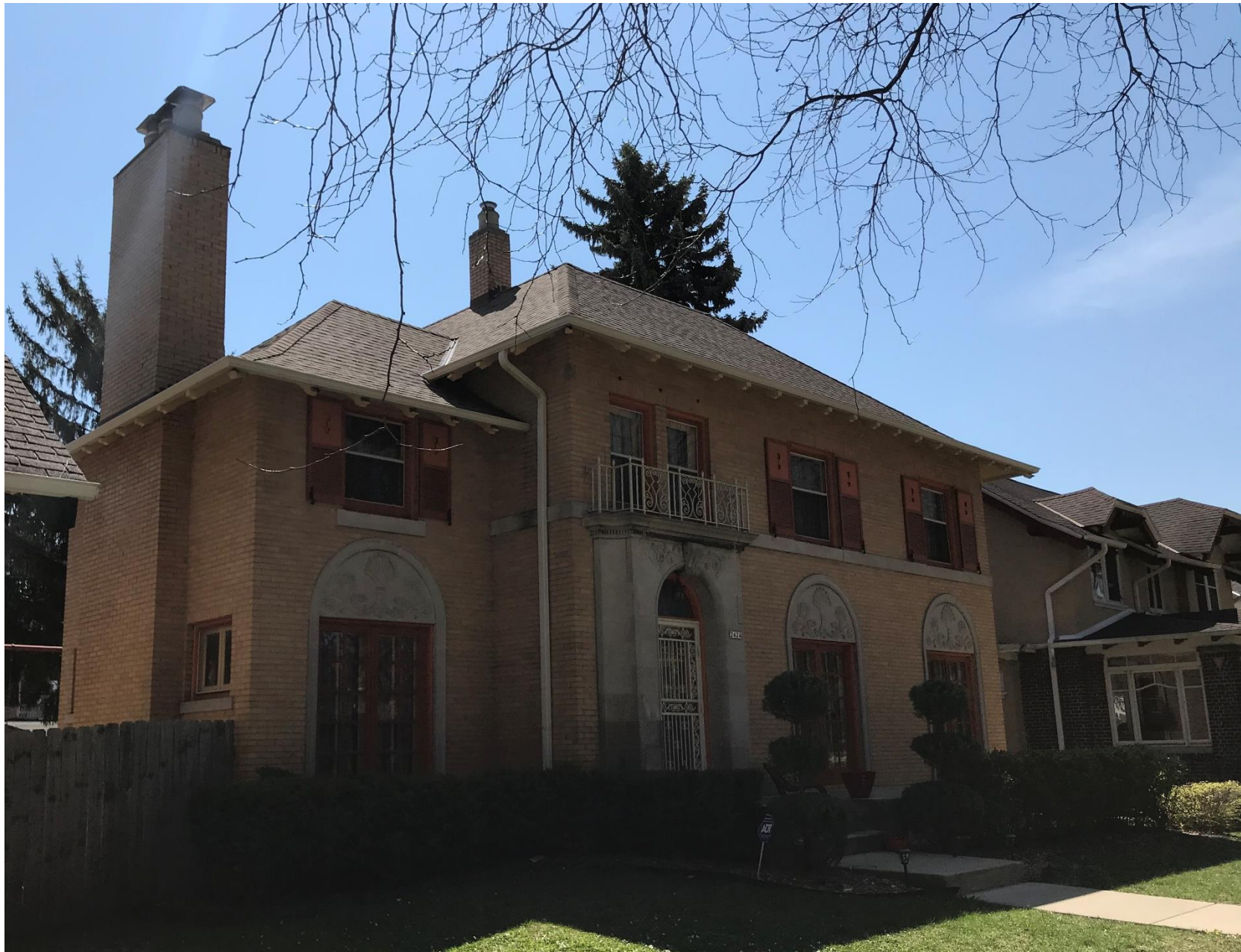
Completed roof on house.