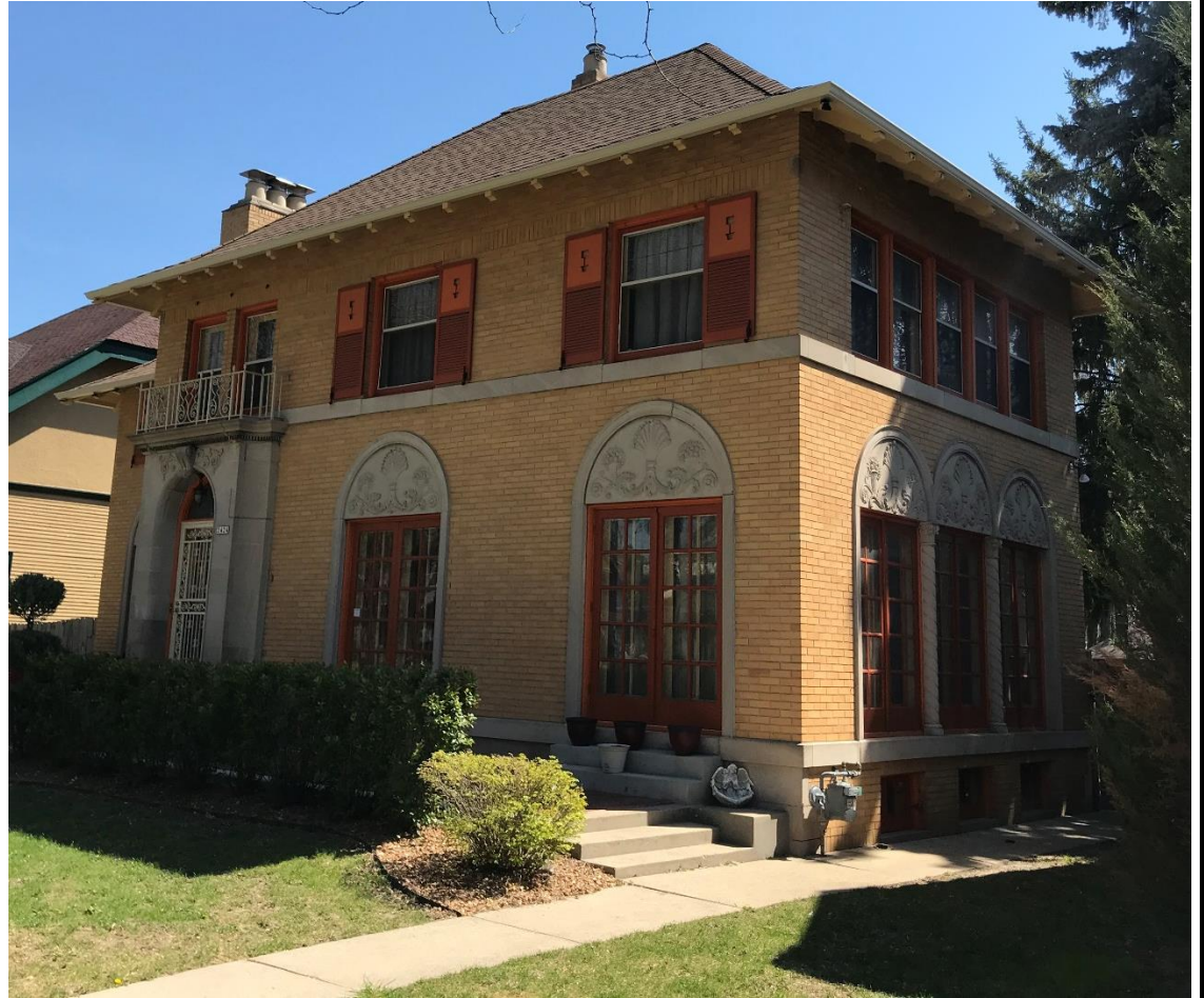
Photos of completed garage roof and completed house roof.