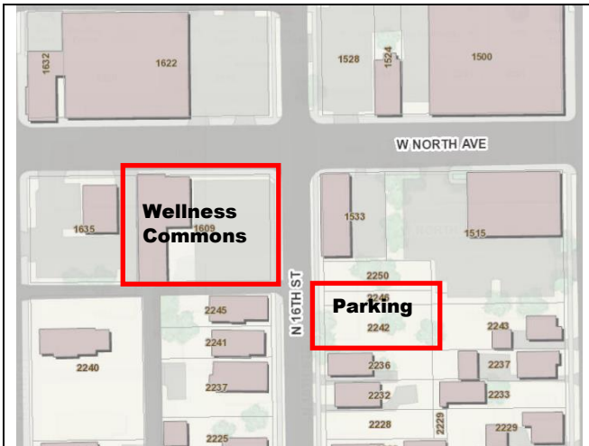
Wellness Commons and Parking

2242 and 2246 North 16th Street: Two City-owned vacant lots acquired through tax foreclosure in 1989 and 1997, respectively. The lots total 8,167 square feet and are located in the Triangle North neighborhood.