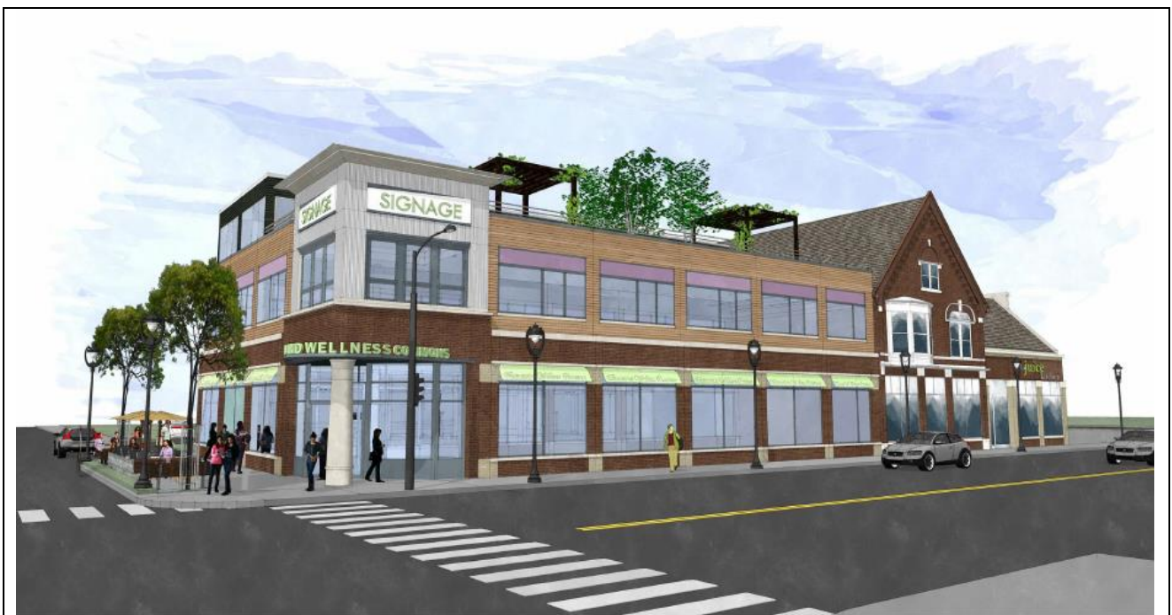
Walnut Way, Innovations and Wellness Commons (Phase I and II)