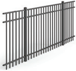
UAF 200 FLAT TOP 3-Rail aluminum fence with flat top rail

Our line of low-maintenance, high-quality ornamental aluminum picket fencing is a great alternative to traditional wrought-iron fence. Ultra Aluminum Fencing offers a complete line of handsome, durable, easy-care styles in Residential, Commercial, Pool Fencing, and Industrial grades.