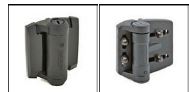
D&amp;D TRUClose Hinge