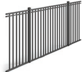
UAB 200 FLAT TOP FLUSH 4' H x 6' W, 3-Rail