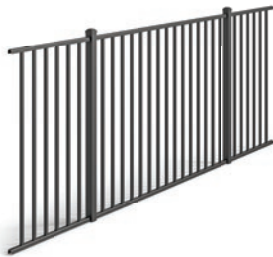
UAF 200 FLUSH 4' H x 6' W, 2-Rail