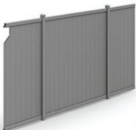
ULTRA ALUMINUM™ PRIVACY FENCE ALL ALUMINUM 6' wide x 4', 5' and 6' High Sections

It's the ideal privacy panel for a residential, commercial or industrial application, as patio or balcony screening, to contain or shield air conditioning equipment, dumpsters, pipes, and electrical systems. Ultra Aluminum™ Privacy fencing is designed to last for years and years without the worry of ongoing maintenance.*