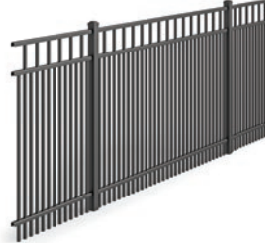
UAF 201 FLAT TOP With 1-5/8" spacing residential and 1-1/2" spacing commercial