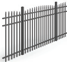
UAS 350 CONVEX SPEAR TOP 3-Rail fence with spear top pickets in convex formation above top rail