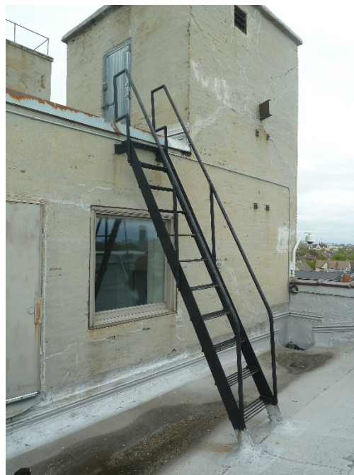
Photo 10 - 5.12.15: Stairway to 5 th floor roof on north side of main building