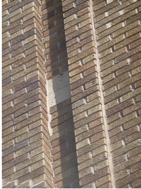
Photo 3 - 5.18.15: Masonry articulation on southeast corner of main building