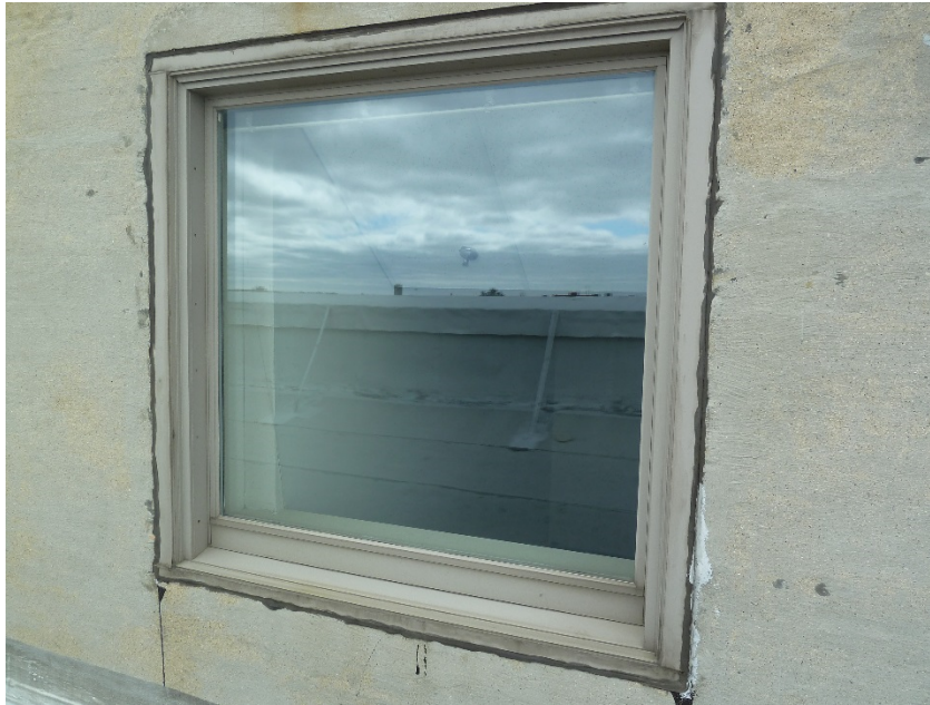
Photo 11 - 5.12.15: Window detail, new windows to be installed in non-historic openings