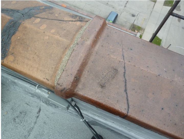
Photo 9 - 5.12.15: Ceramic coping on top of main building roof