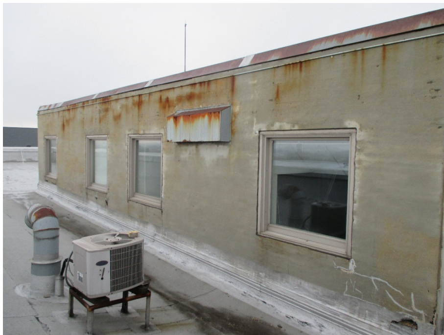
Photo 8 - 12.23.14: 5 th floor, east façade