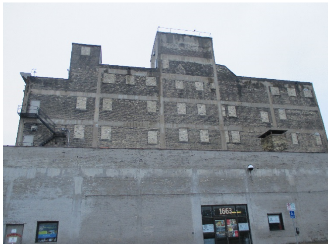
Photo 20 - 12.23.14: North facades, storage building and main building