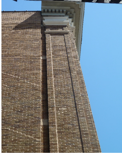
Photo 5 - 5.18.15: Existing limestone cornice on southwest corner