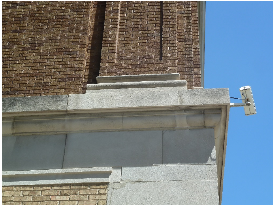
Photo 4 - 5.18.15: Existing limestone sill on southeast corner