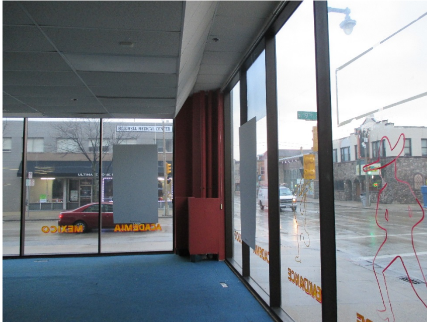
Photo 17 - 12.23.14: Interior view of storefront windows, looking southeast