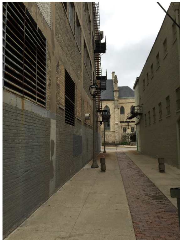
Photo 26 - 5.12.15: West façade, main building, and public walkway/ vacated alley