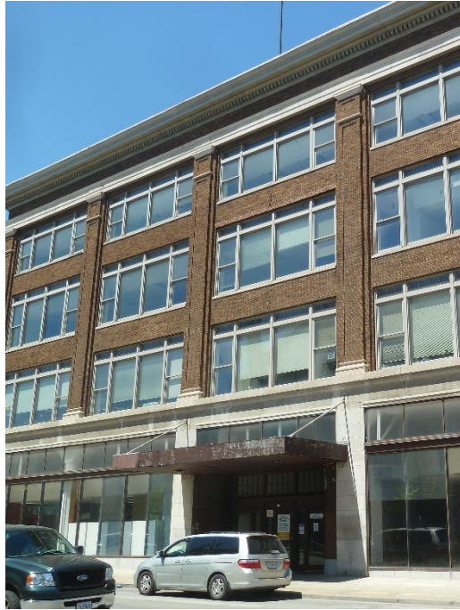
Photo 19 - 5.18.15: Main entrance on south elevation, canopy to remain during construction