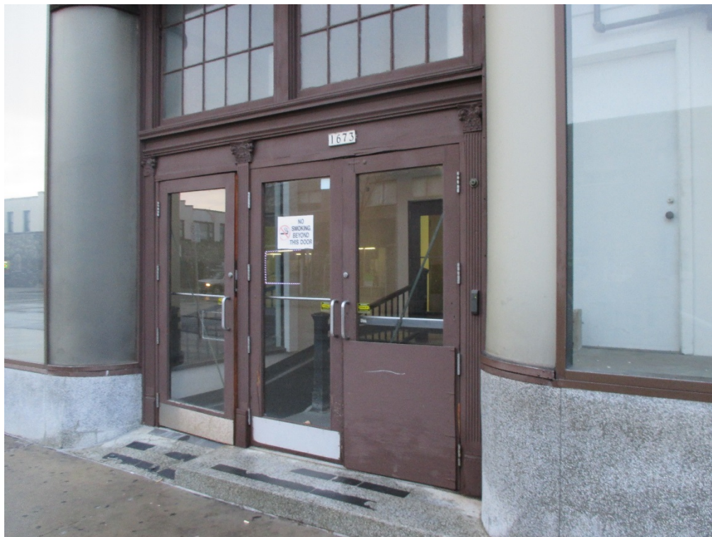
Photo 18 -12.23.14: Building entry on east elevation