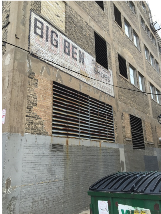
Photo 25 - 05.12.15: Big Ben Ghost Signage