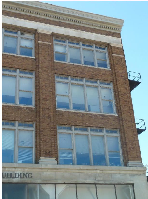
Photo 15 - 5.18.15: Window details on east façade of main building