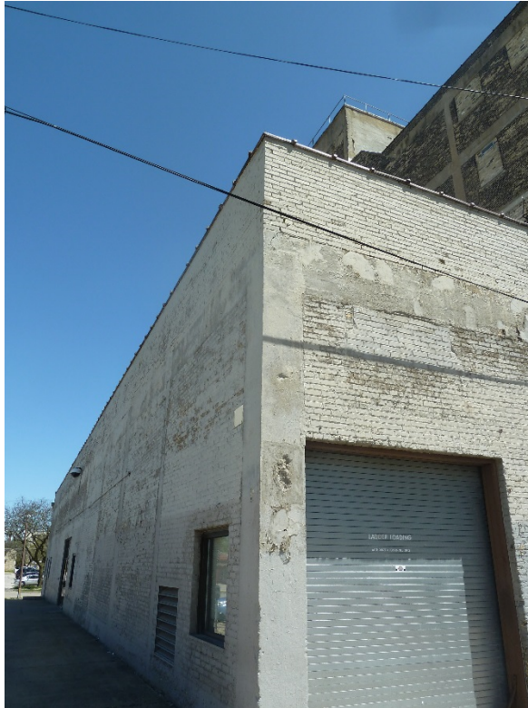
Photo 23 - 5.18.15: Overhead door on west elevation of storage building