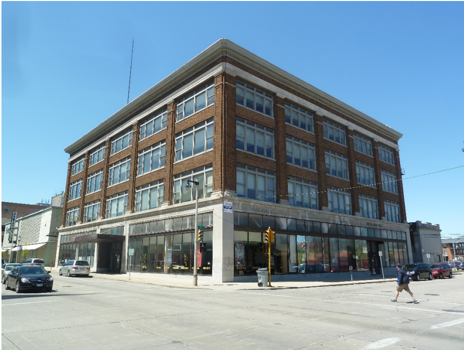
Photo 1 - 5.18.15: South and east facades of Hills Building from corner of 9 th and Mitchell