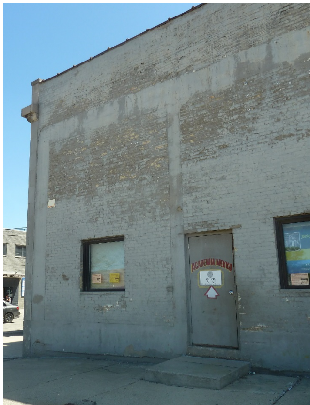
Photo 22 - 5.18.15: Side entrance on north elevation of storage building