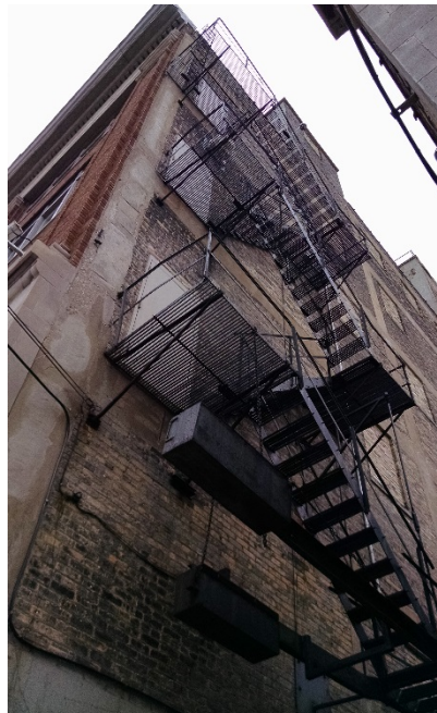
Photo 14 - 5.12.15: Fire escape stairs on northeast corner of main building