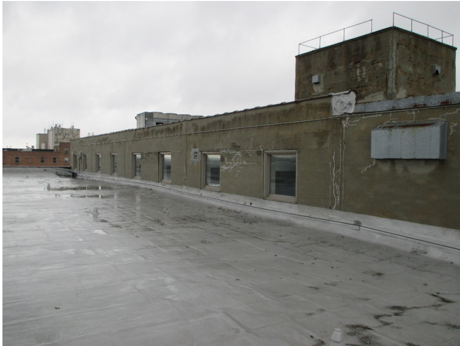
Photo 7 - 12.23.14: Main building roof looking northwest toward 5 th floor