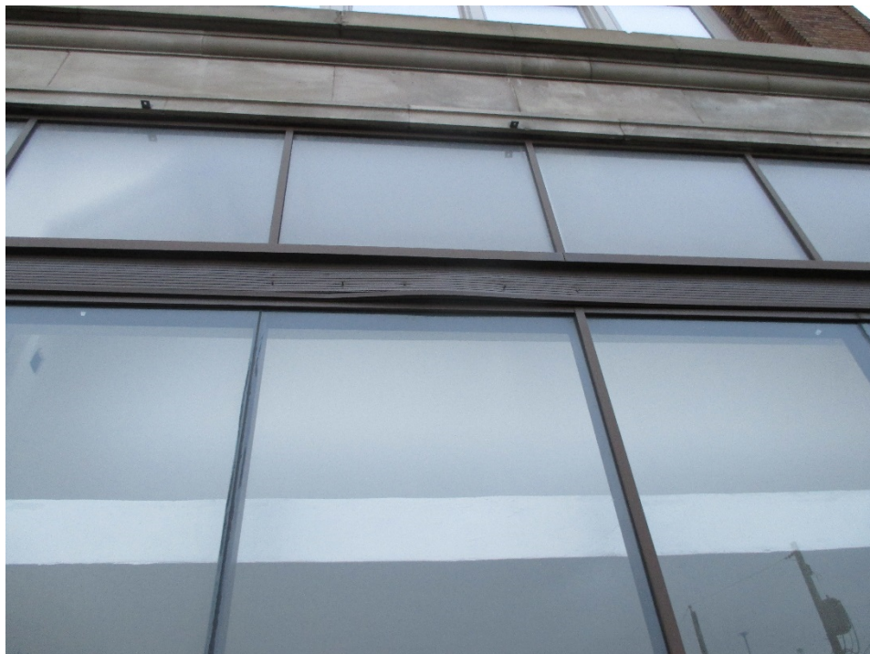
Photo 16 - 12.23.14: Storefront windows on east elevation of building