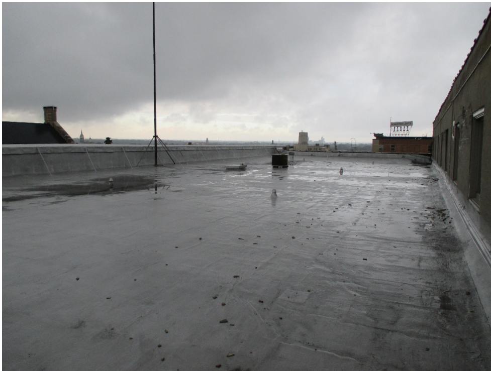
Photo 6 - 12.23.14: Main building roof looking southwest