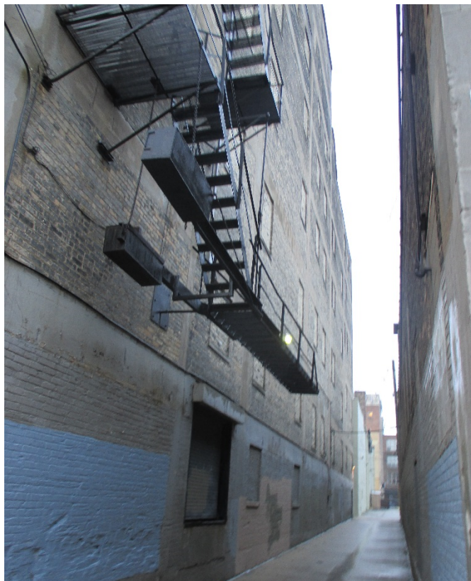
Photo 24 - 12.23.14: North façade of main building and vacated alley between main building and storage building