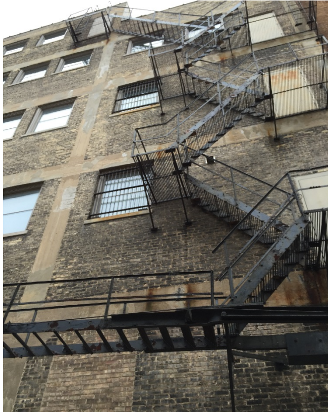
Photo 13 - 5.12.15: Fire escape stairs located at west elevation of main building