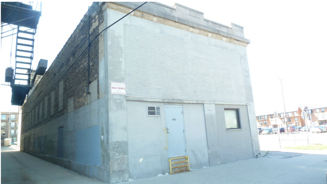
Photo 2 - 12.23.14: Storage Building, east façade, looking northwest