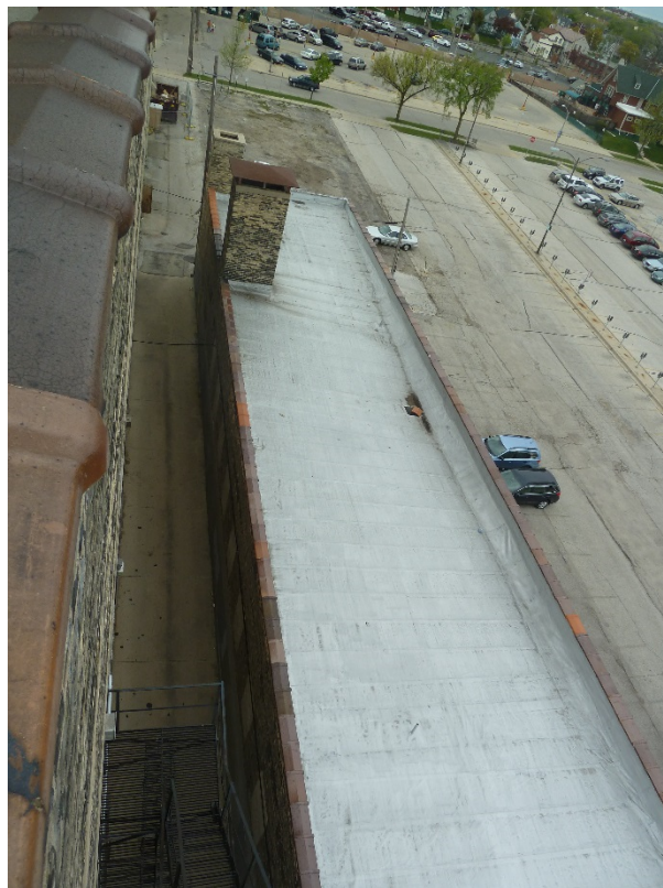
Photo 12 - 5.12.15: View of north building roof, looking northwest