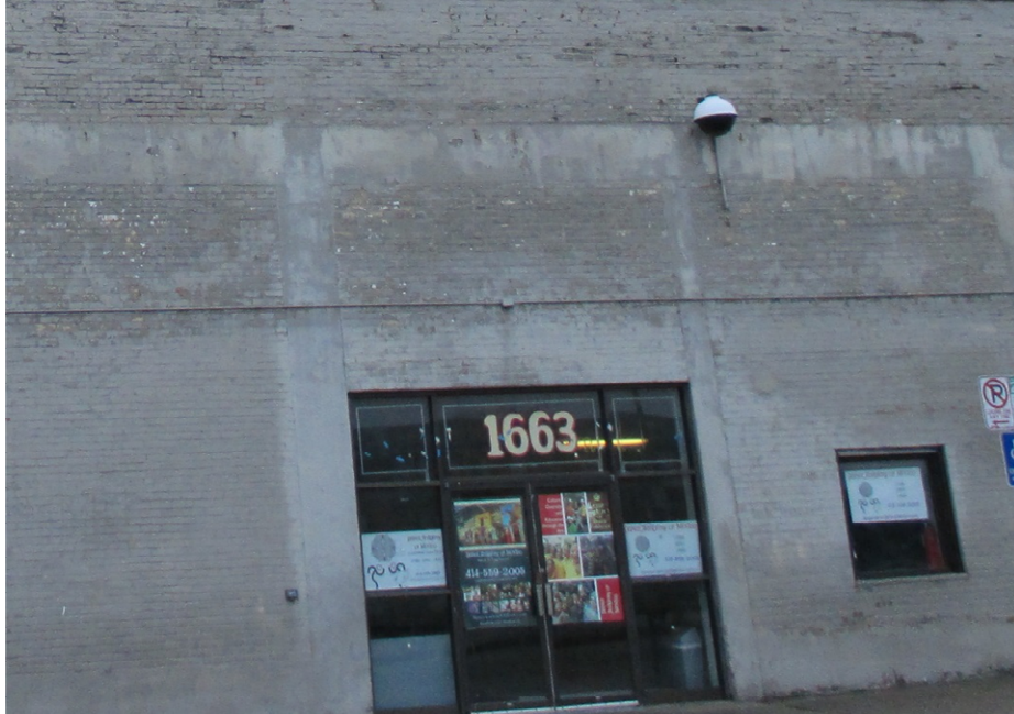
Photo 21 - 12.23.14: North elevation entry of storage building