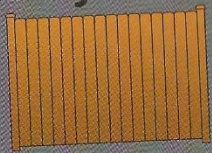
Dog Ear Privacy