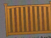
Batten w/ Arched Trim*