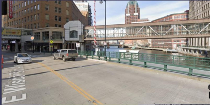
Wisconsin Avenue & Empire Building