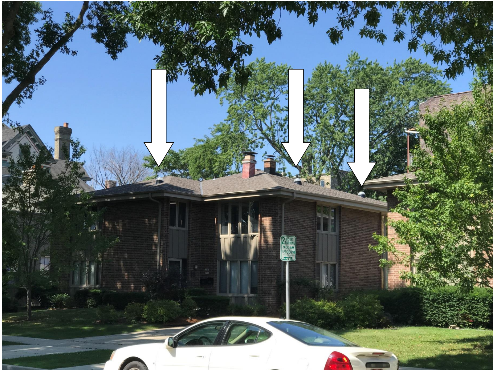
Front view showing three denied Solatubes.