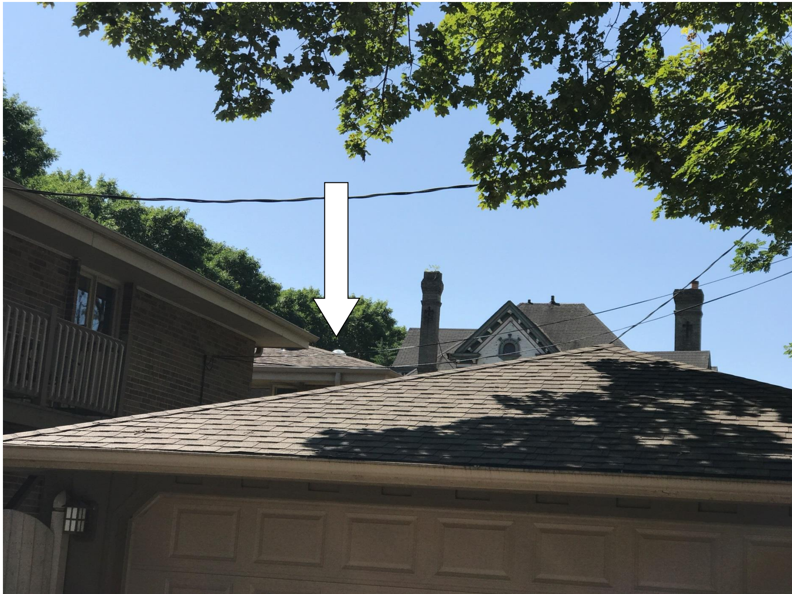
View from Belleview Place of the one approved Solatube