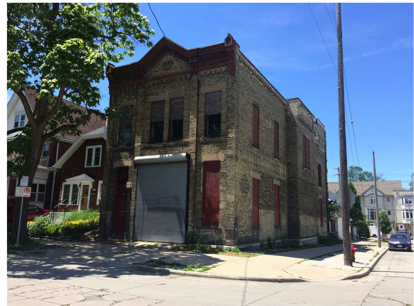
3 EXISTING FRONT VIEW SCALE: NONE