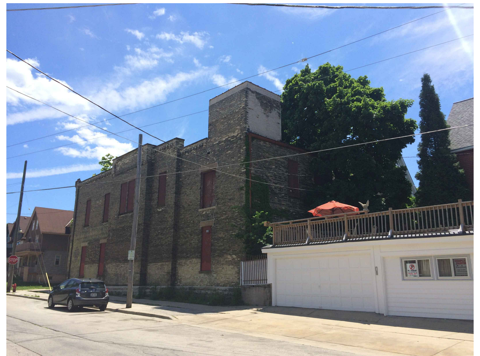
4 EXISTING REAR VIEW SCALE: NONE