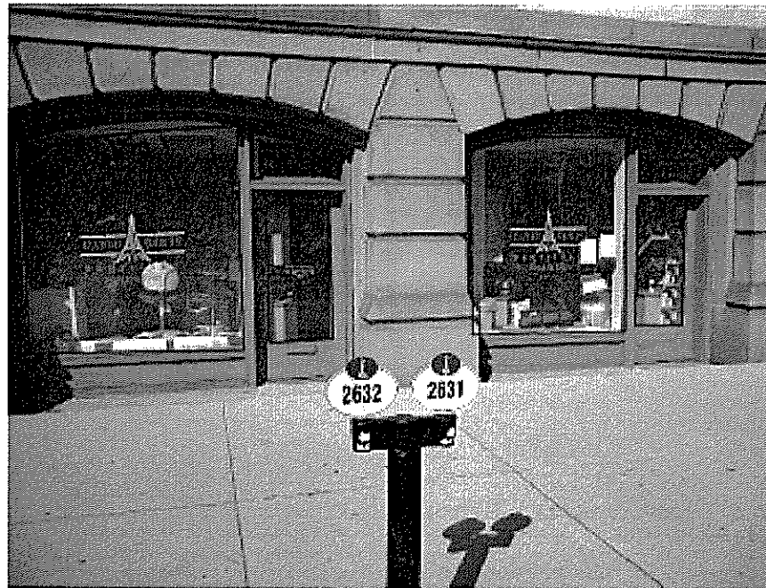
Window signage to be placed of North Broadway storefronts of 225 E. Michigan Street in the East Side commercial Historic District