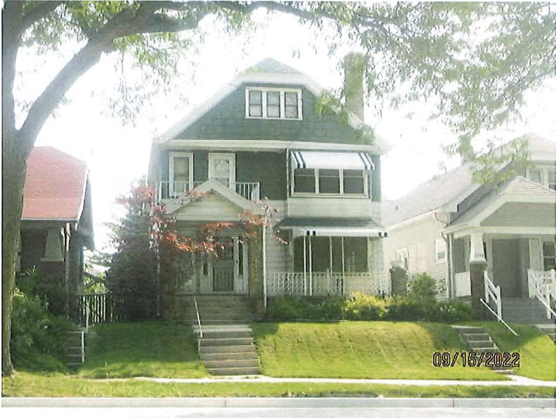
2344-46 N Humboldt Blvd