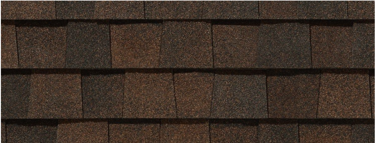
Proposed Landmark regular shingle for front and rear of building.