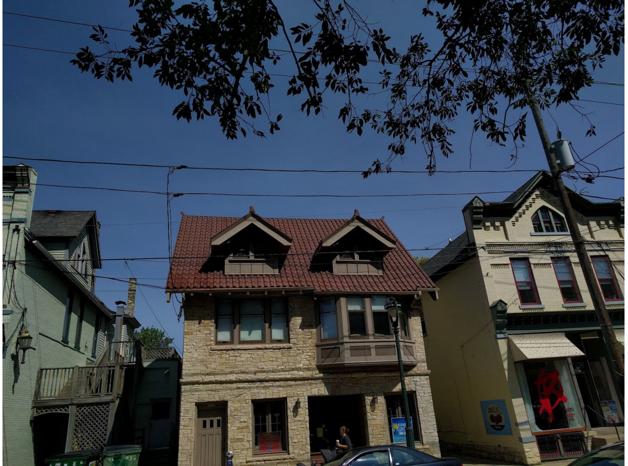
Front of building.