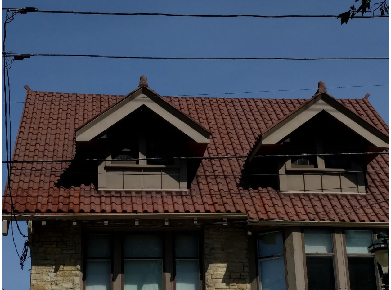
Front of building.