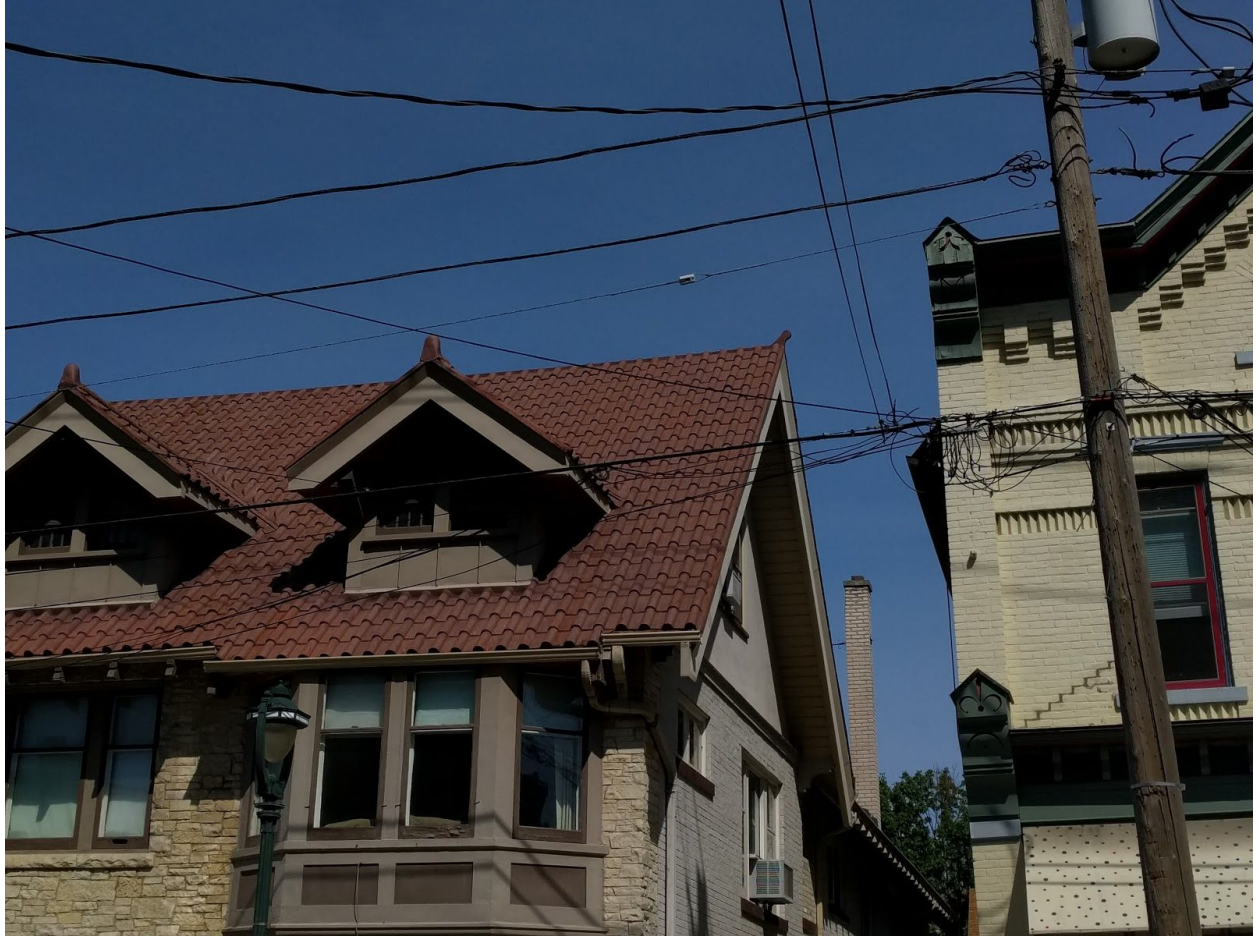
Front and east side of building.