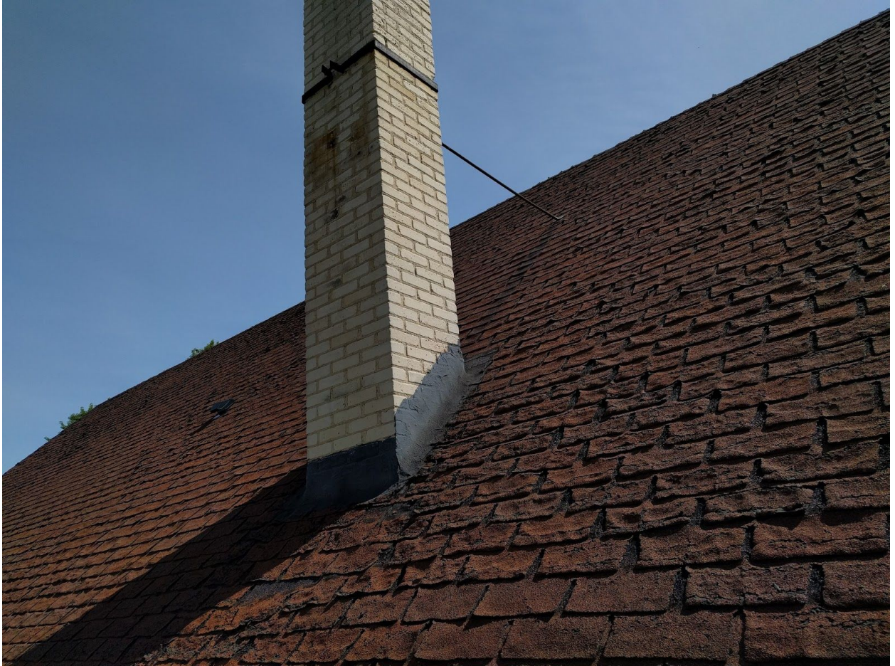
Chimney to be removed.