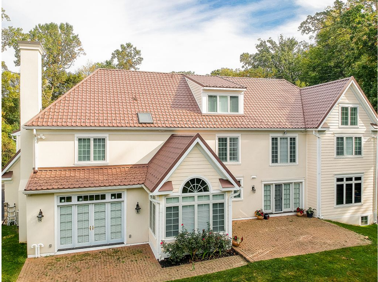
Proposed style for alternate option for front of building- Matterhorn Metal Roofing 'Tuscan Ville' tile. https://www.certainteed.com/residential-roofing/products/matterhorn-metal-roofing-tile/