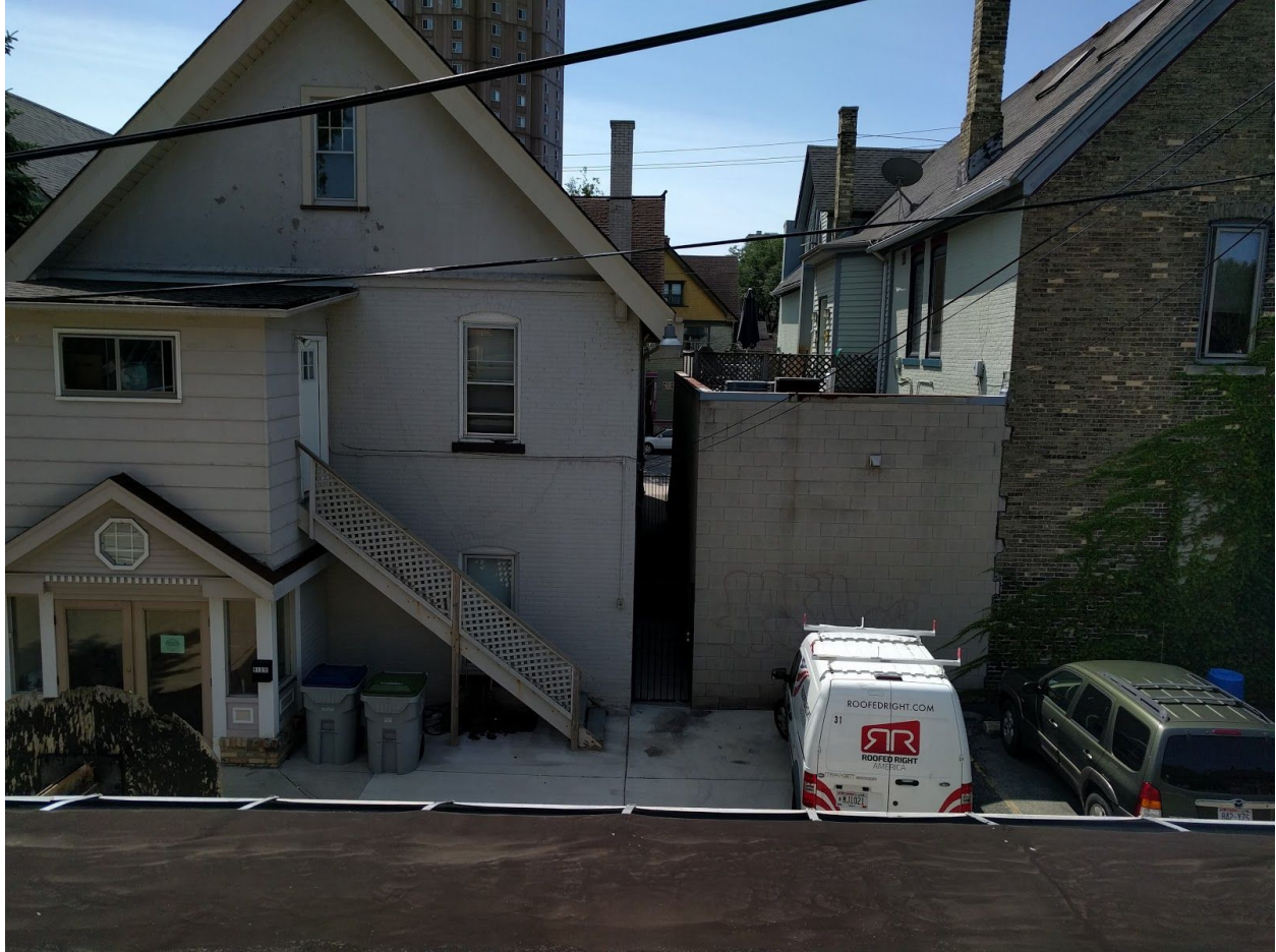
Rear of building.