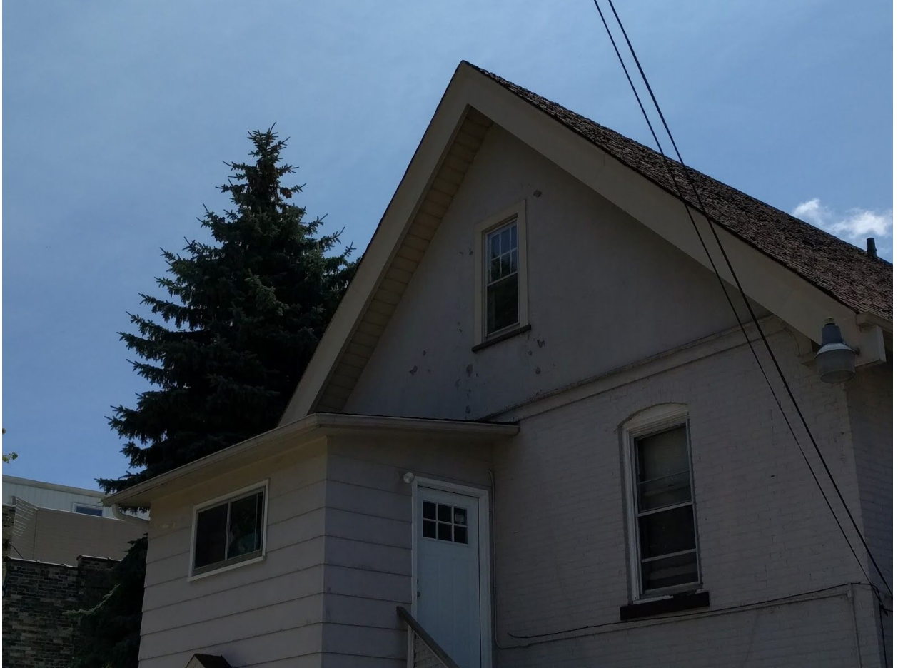
Rear of building.