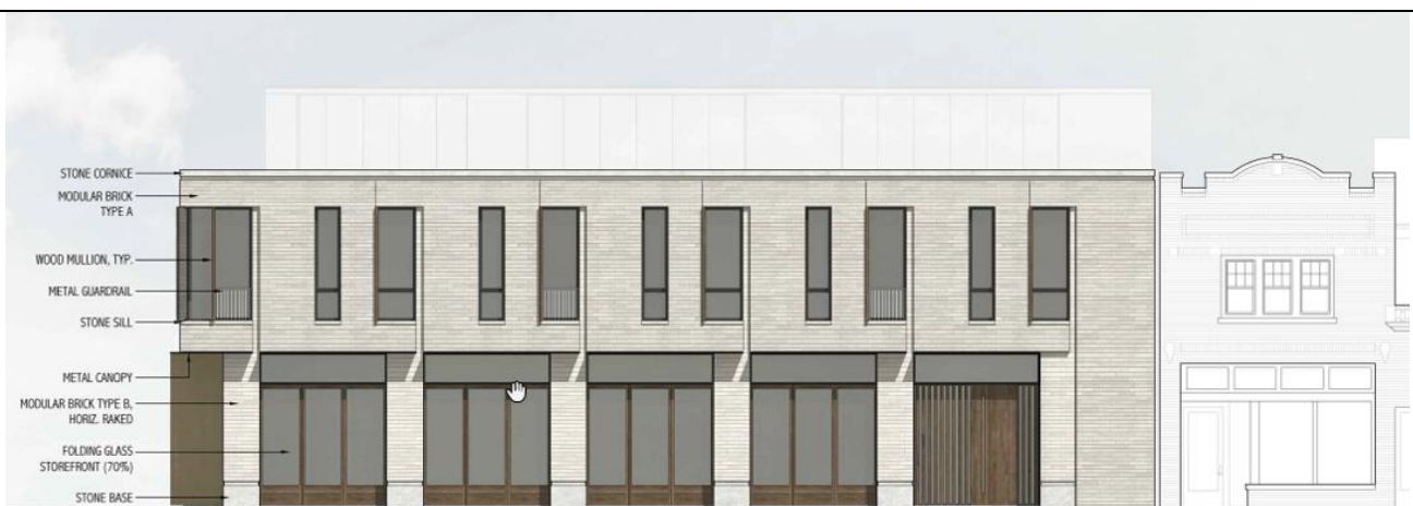
Front elevation on Brady Street