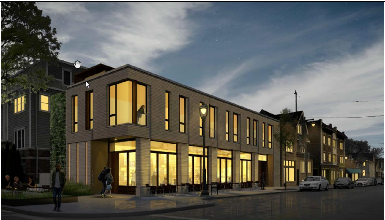
Concept illustration, view from Northeast