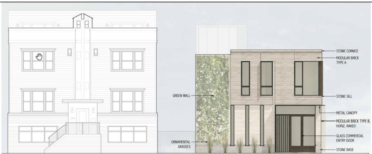
East elevation on Marshall Street