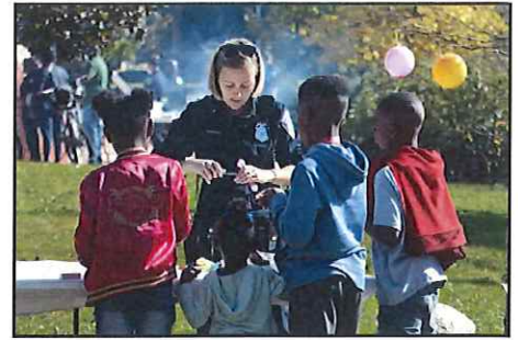
NID partners engage in ongoing neighborhood-based community policing projects

Established shared community marketing at: www.wppmke.com (includes community plans, photos, videos and NID Board profiles)