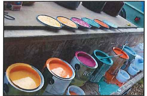
NID supports an annual Arts & Entertainment event with high quality free activities for the public