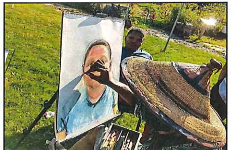
NID partners to engage thousands of local residents in participation each year