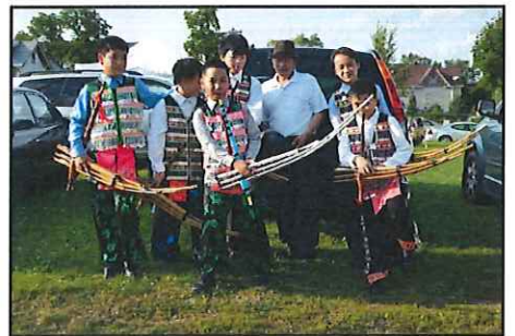
NID partners opportunities for youth leadership & performance through various community projects