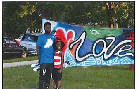
Local residents qualify for local service contracts in labor, trades & arts