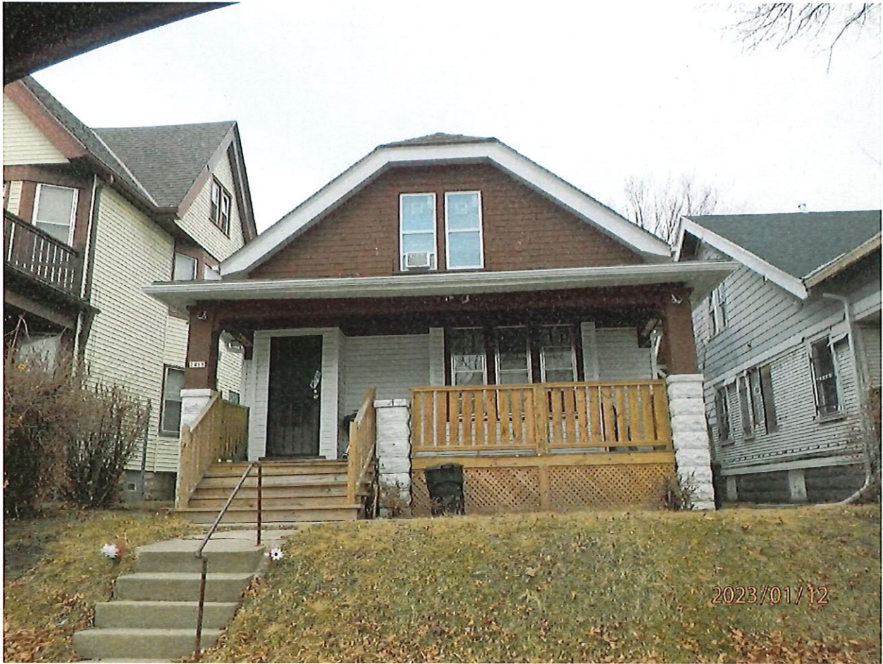
2468 W Auer Ave