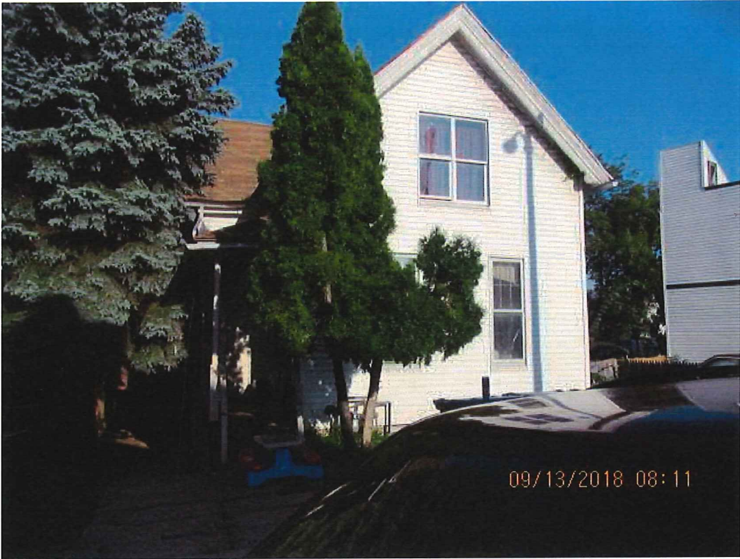
2233 S Muskego