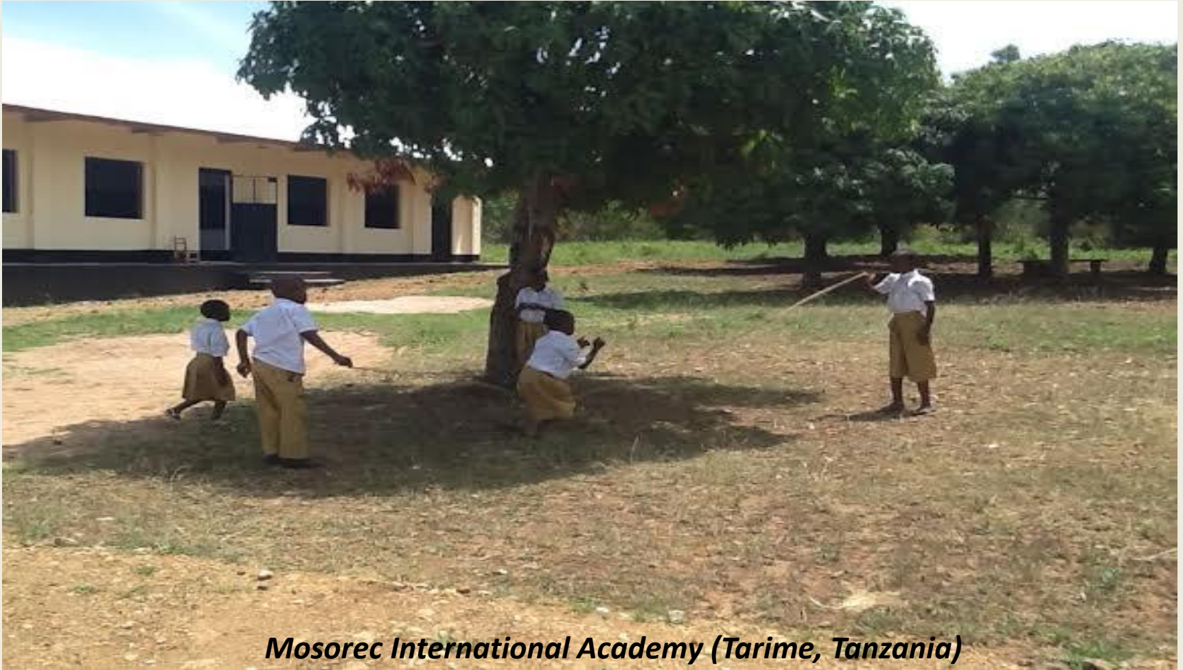
Mosorec International Academy (Tarime, Tanzania)