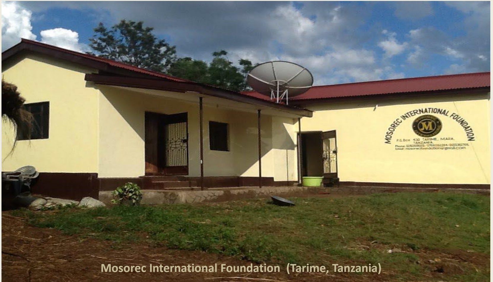
Mosorec International Foundation (Tarime, Tanzania)