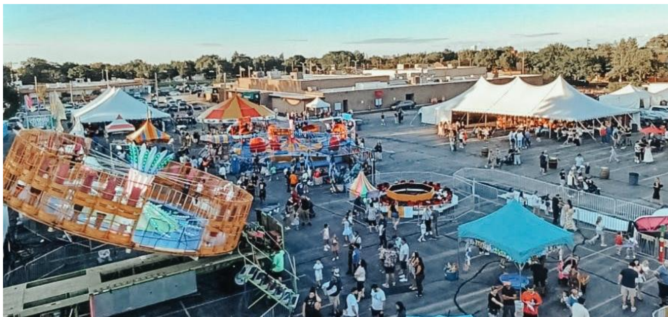
Areal View of the Annual Serbian Days Celebration in 2025

sessions, including the one on obtaining FEMA assistance - following the historic flooding in the Milwaukee Area - as well as one on guiding eligible participants on how to enroll in Social Security. Most of these events featured one or more of the following: traditional Serbian food, dance performances, music, Sunday school cultural presentations, and athletic activities that brought together generations of Milwaukee's Serbian-American community. More importantly, our organization took the opportunity at these events to showcase our sister cities relationship and garner additional support for this significant and meaningful effort. Furthermore, these events drew many Milwaukeeans and members of the general public who got to experience Serbian culture through food, dance, educational presentations, and comradery, all in the traditionally welcoming environment the Serbs are widely known for.