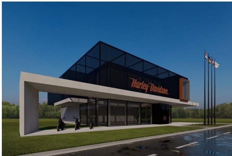
Artist Rendering of the Proposed Dealership in Kragujevac, Serbia