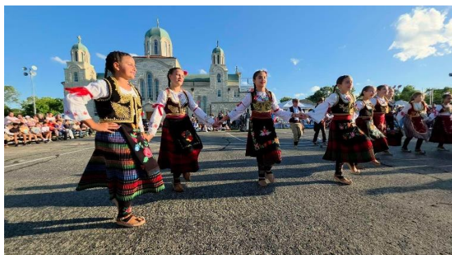
Youth Dancers Performing Traditional Serbian Dance

The committee supported major community gatherings such as the three-day Serbian Days festival in August, the Jos-Kos Basketball Tournament in early spring, the St. Sava Church Slava celebration in January, the International Evening held at the St. Sava Cultural Center in February, and Career Fair in December at Serb Hall. Our community also held several public service informational