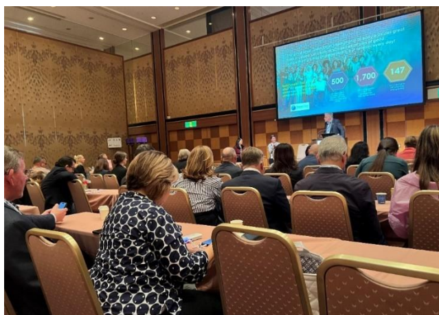
Workshop at the Sister Cities International Summit in Izumisano, Japan

The summit's educational sessions and workshops were another major benefit. These sessions focused on best practices in city diplomacy, youth engagement, sustainability, economic development, and cultural programming. They offered a wealth of knowledge on how other sister city committees around the world overcome challenges, sustain engagement, and innovate their programming.