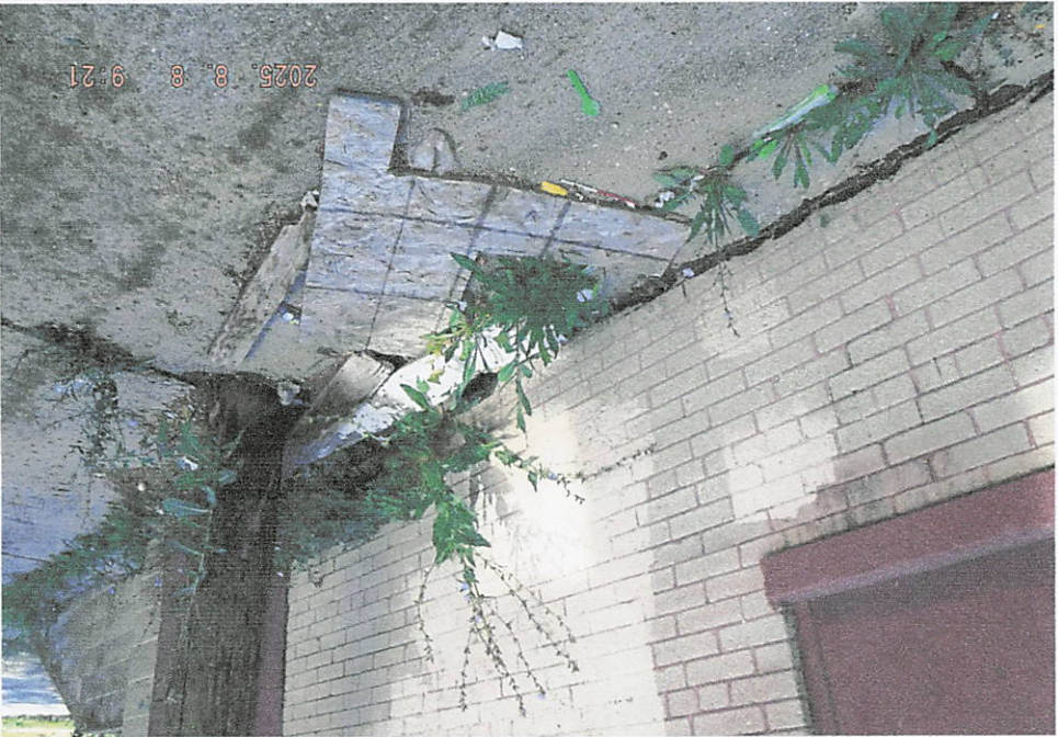
418 E Chambers St