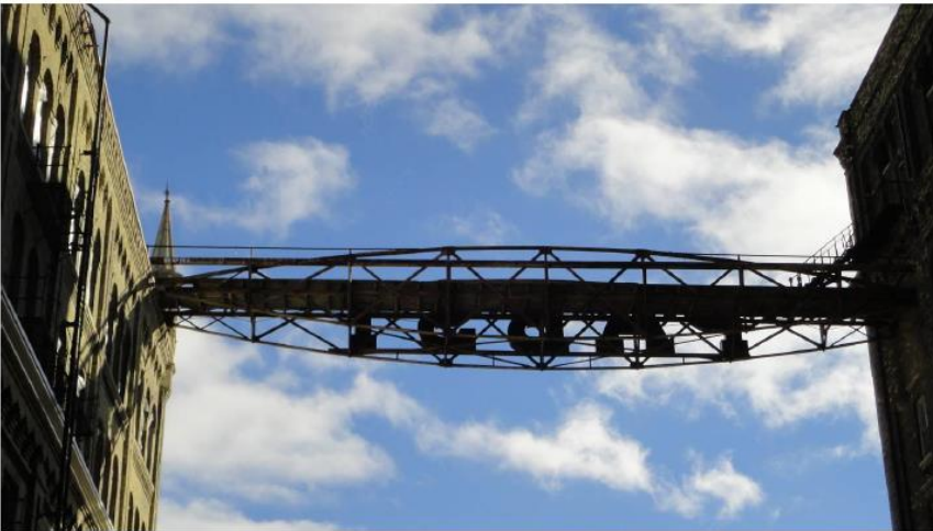
P2 Pabst sign bridge (looking east)