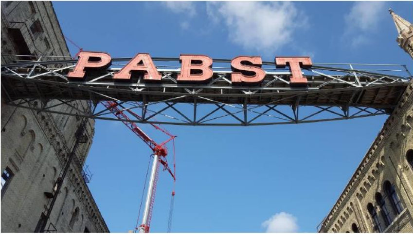
P1 Pabst sign bridge (looking west)