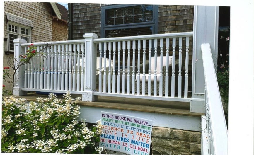
Photo below shows rear balcony to have railing added and door replaced.

Photos indicate windows where new storm windows will be replaced on the top floor and the railing to be replicated for the back balcony.