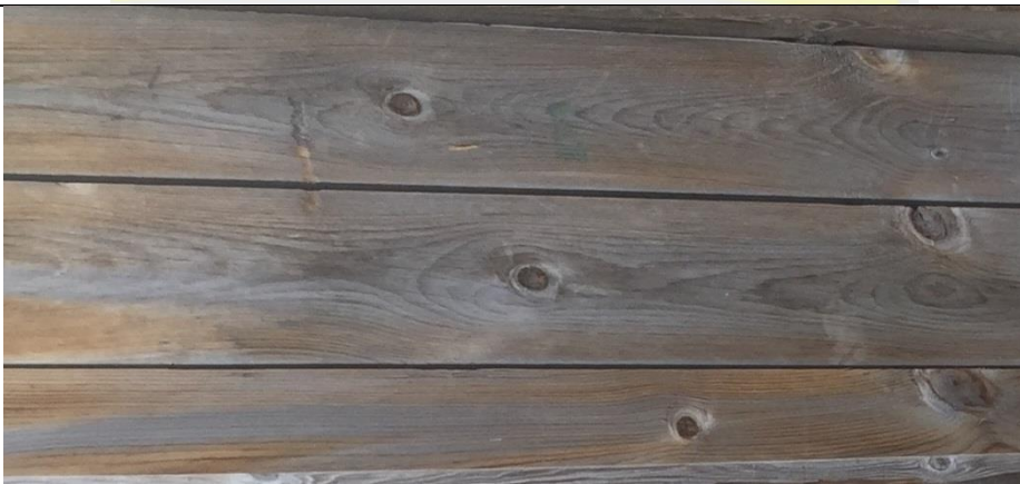
New facing material