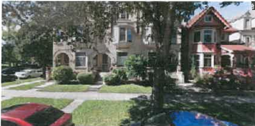
1501 N Marshall St Milwaukee, WI 53202

20 ft