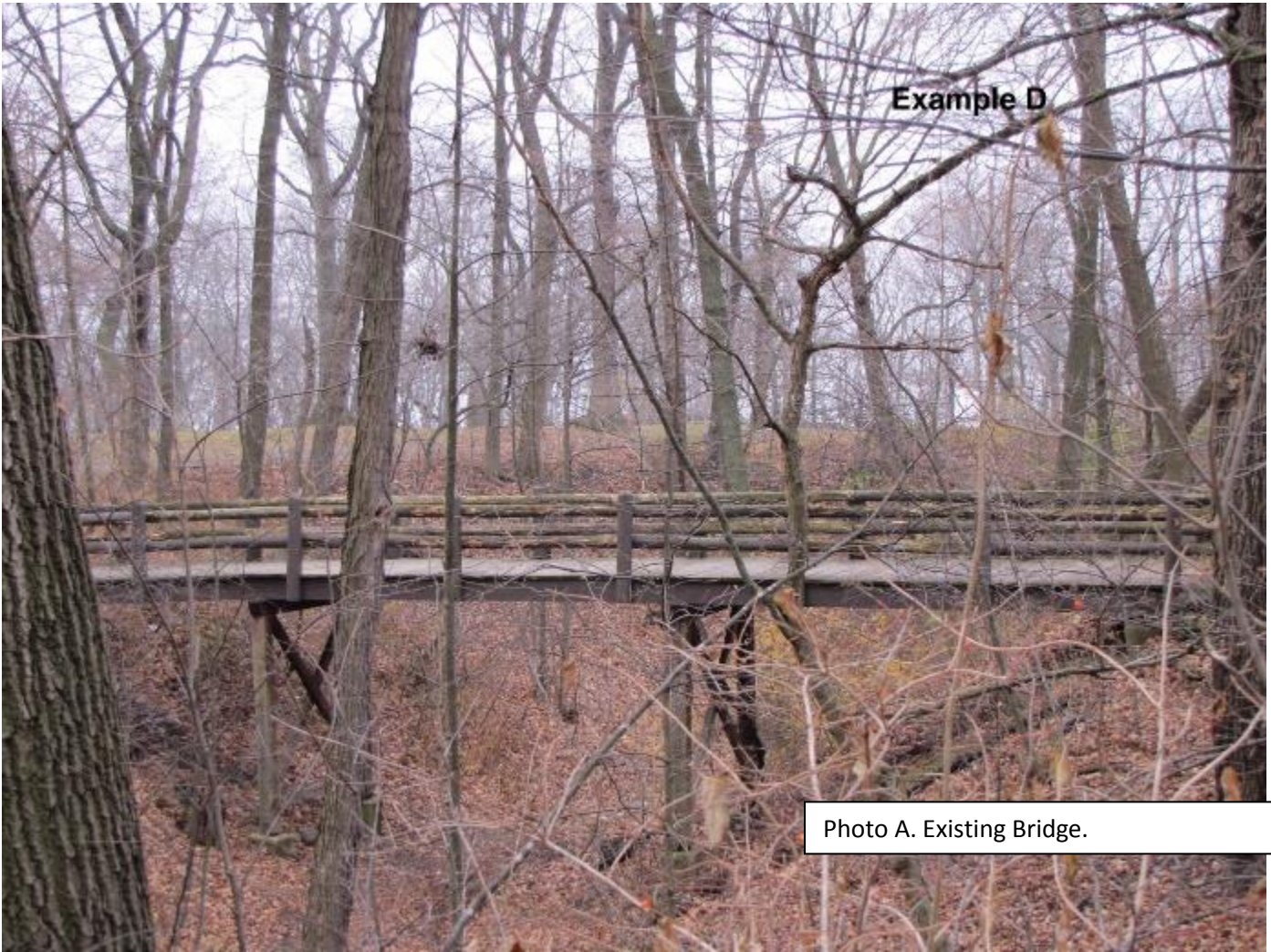
Photo A. Existing Bridge.