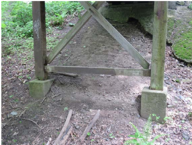
Photo E. Wood Columns/Concrete Piers.