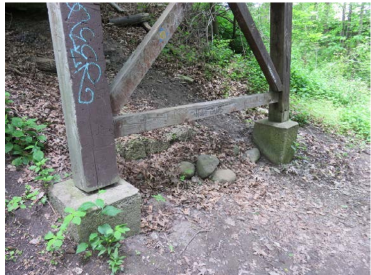
Photo F. Wood Columns/Concrete Piers.