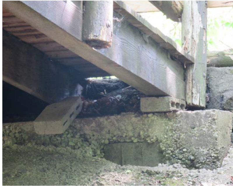
Photo D. South Concrete Foundation.