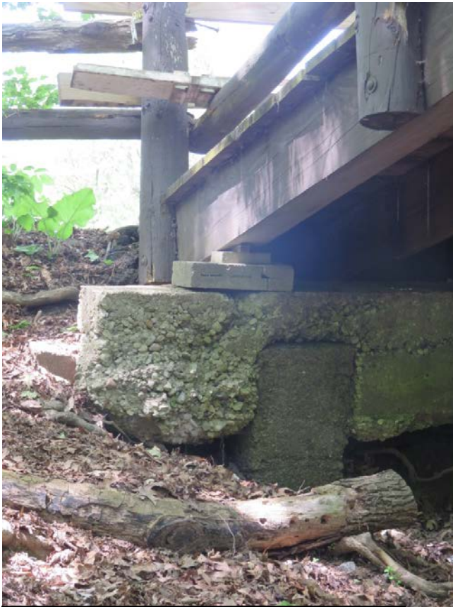
Concrete Foundation.