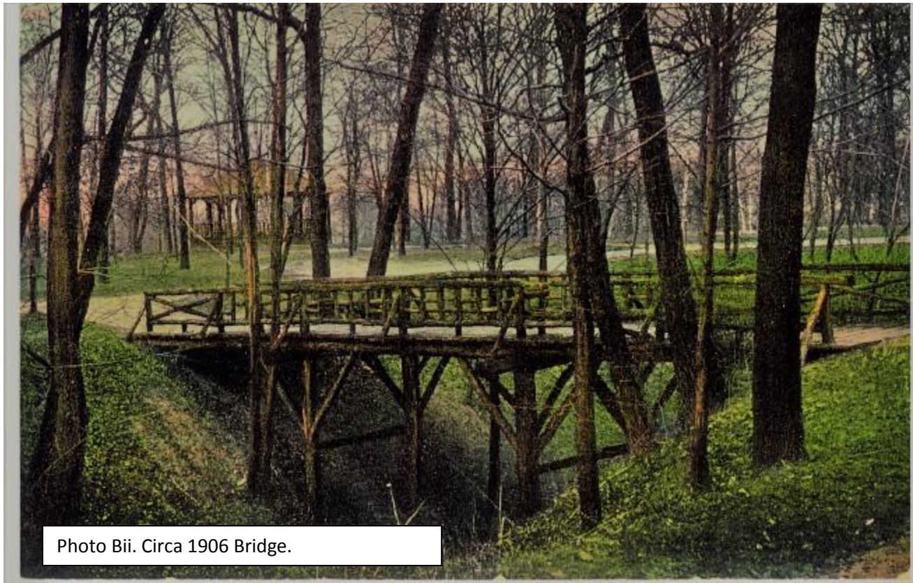
Photo Bii. Circa 1906 Bridge.