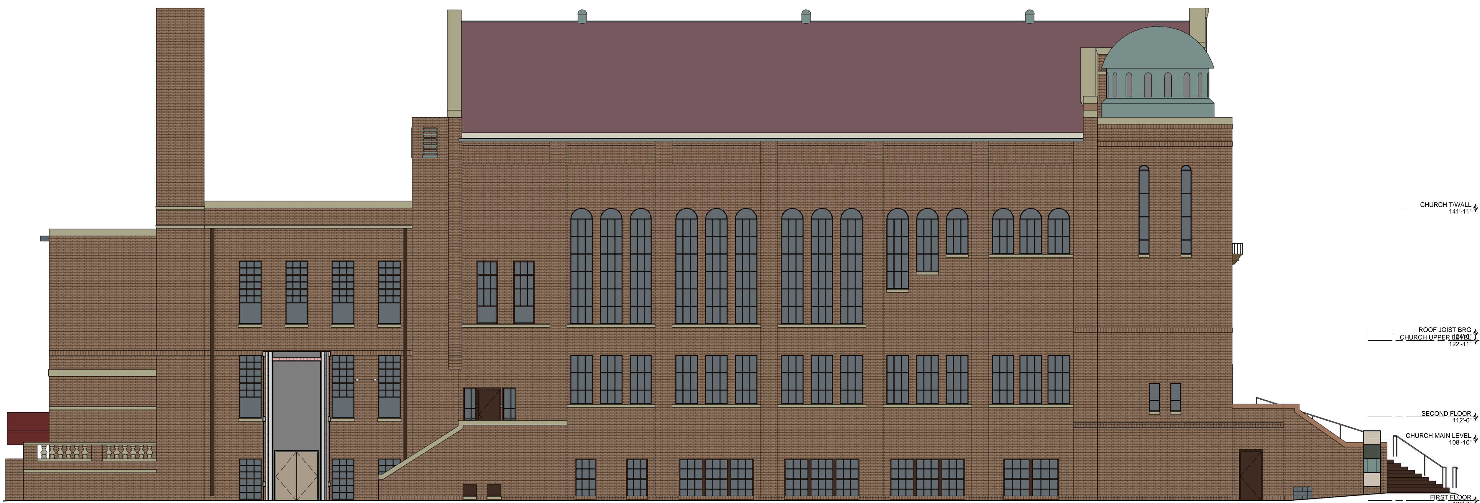
NORTH CONNECTOR ELEVATION SCALE: 1/8" = 1'-0"