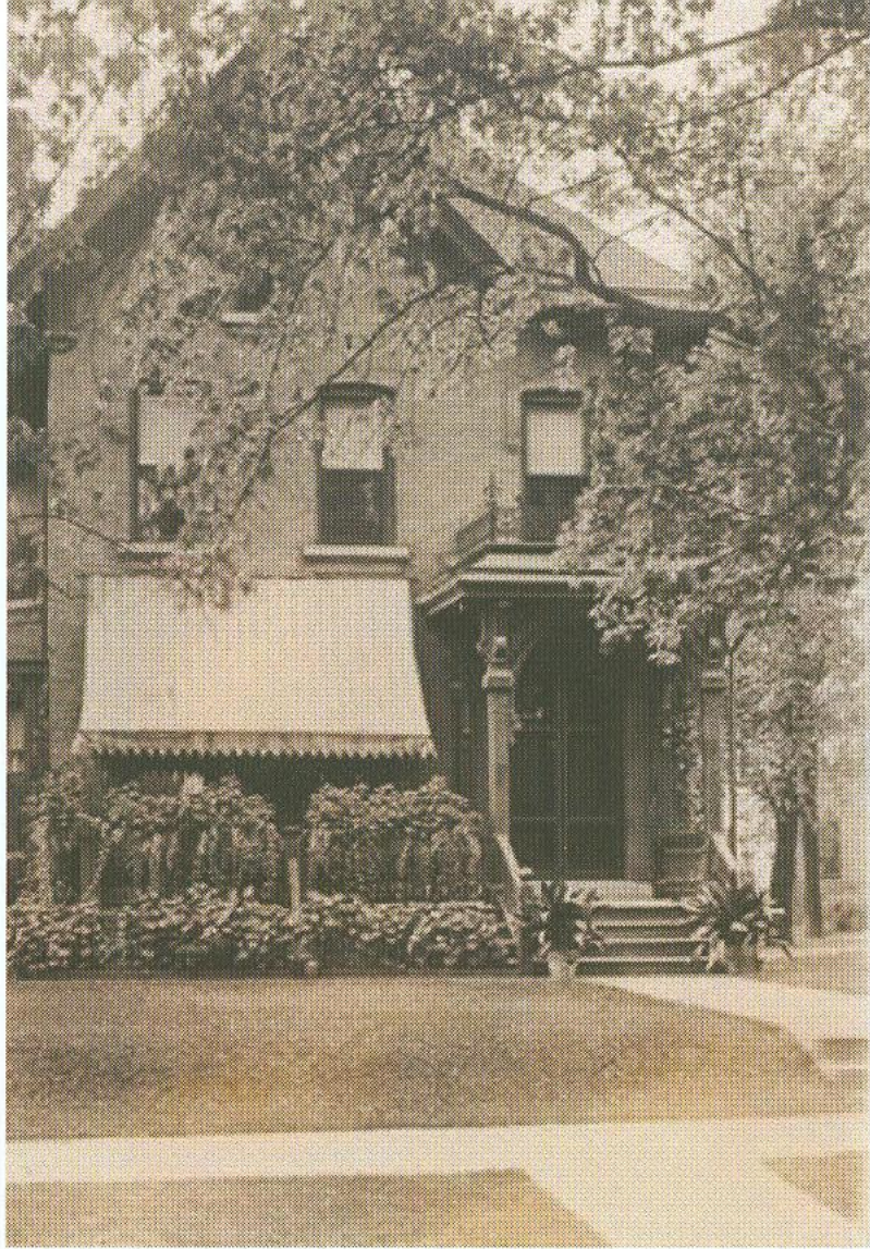
1903 NORTH CAMBRIDGE C. 1900