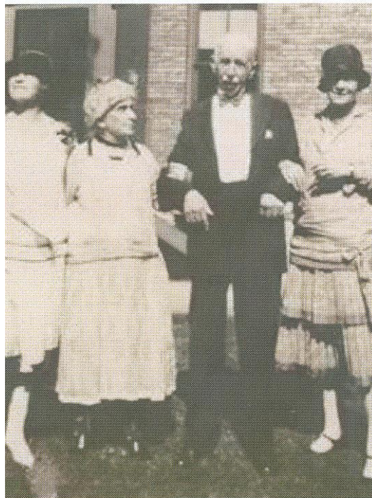
GROOM FAMILY ON CAMBRIDGE AVENUE