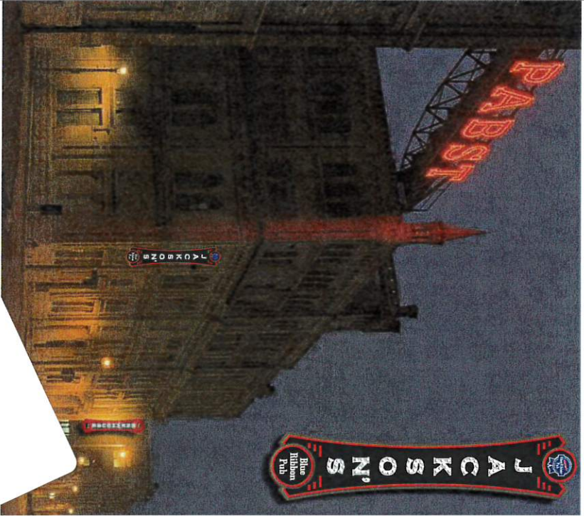
Reference drawing from 2013