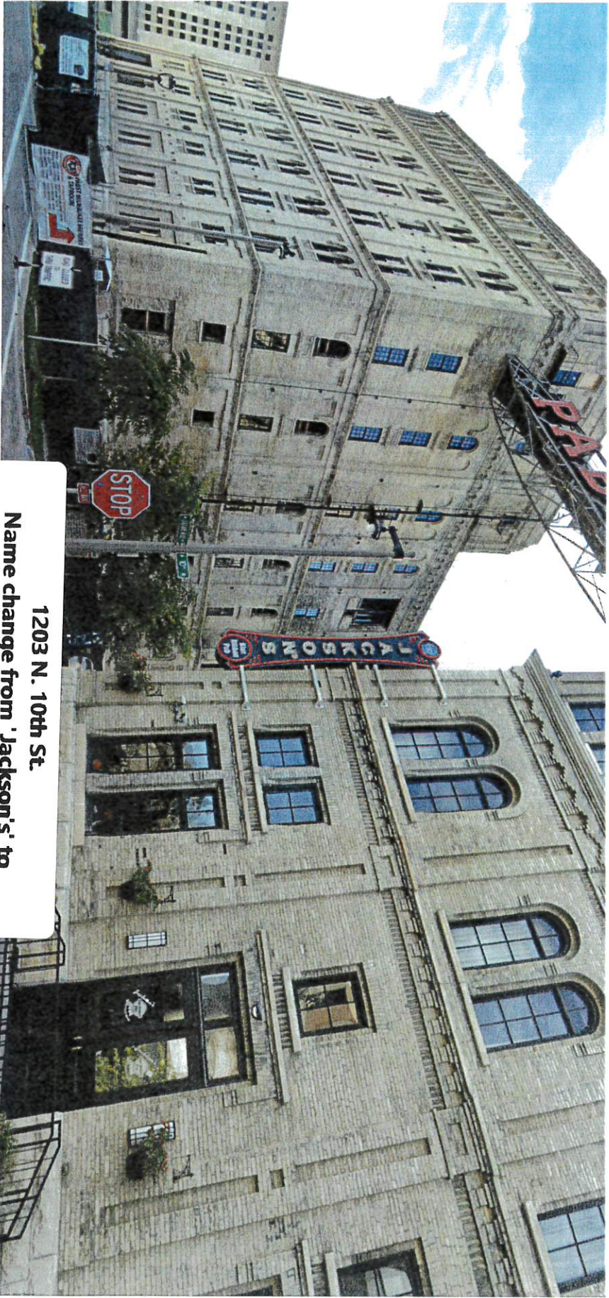
1203 N. 10th St. Name change from 'Jackson's' to 'On Tap' 8-21