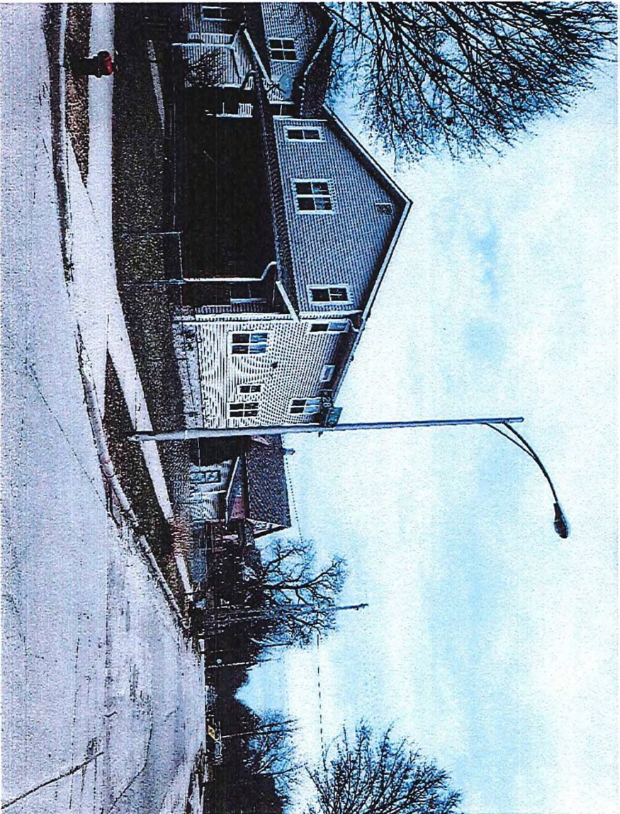
Both photos above are of the pothole hit on Friday, April 8 th , 2022.