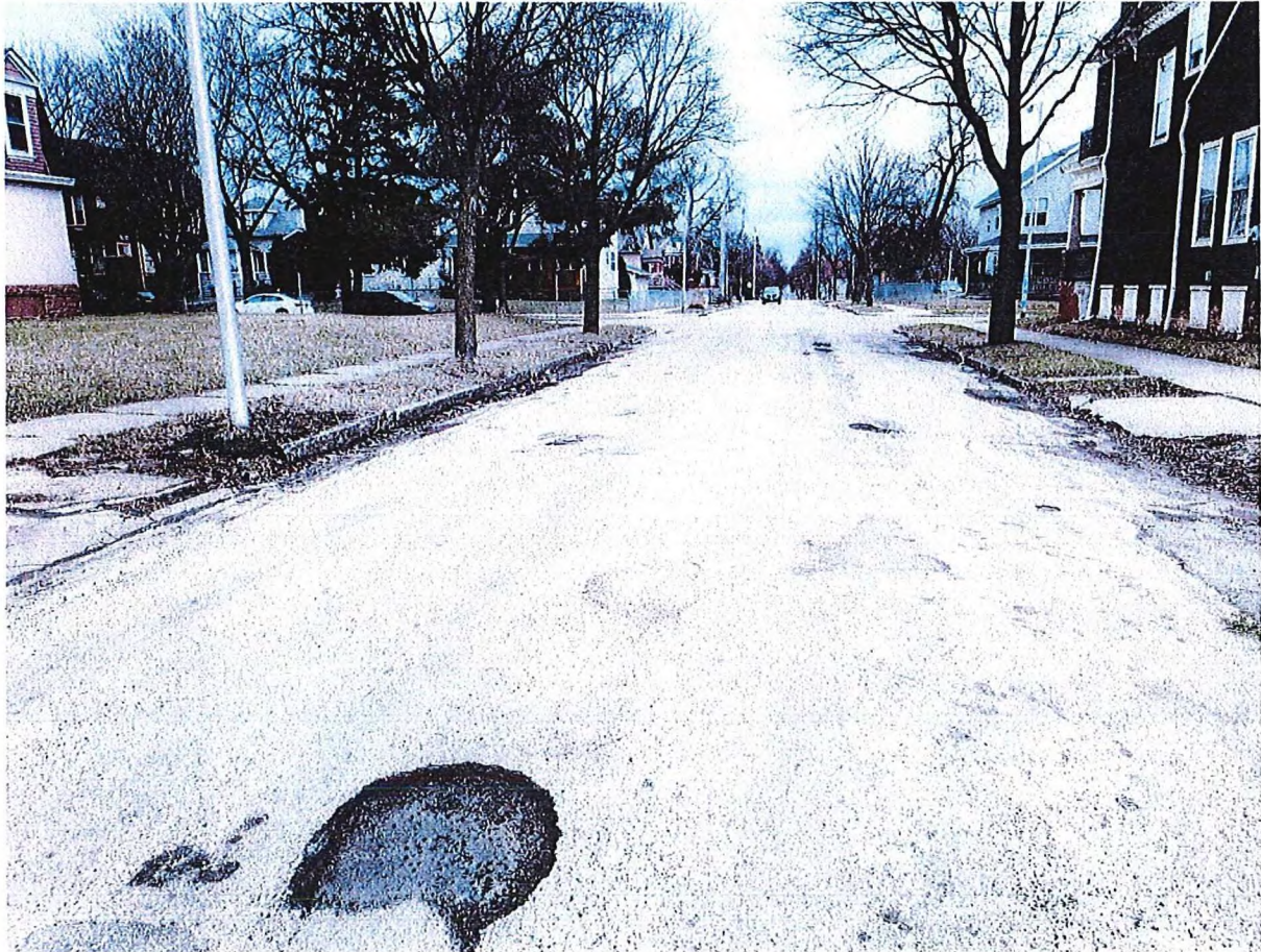
Both photos above are of the pothole I hit on Friday, April 8 th , 2022.