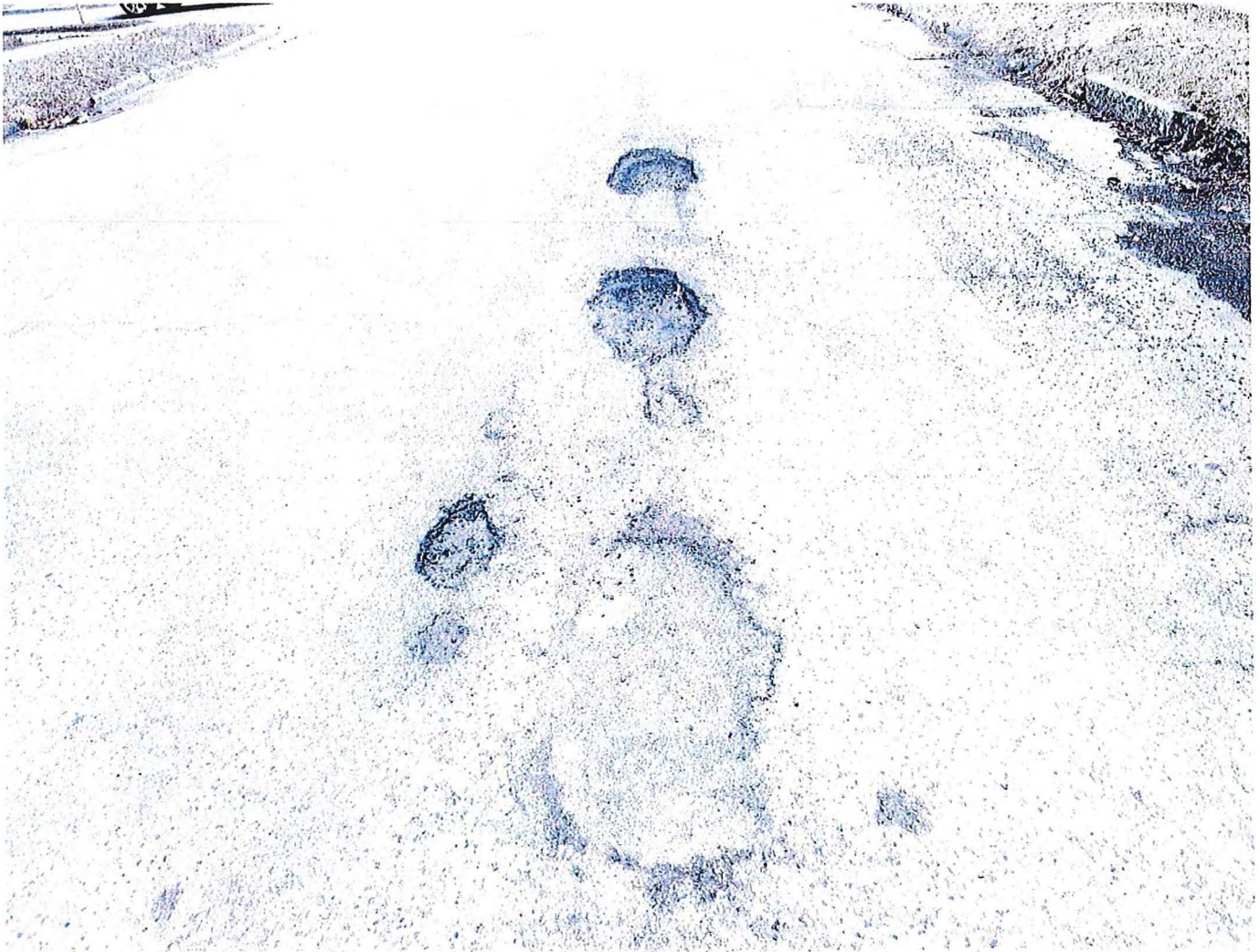
This is a picture of three or four other pot holes on same street.