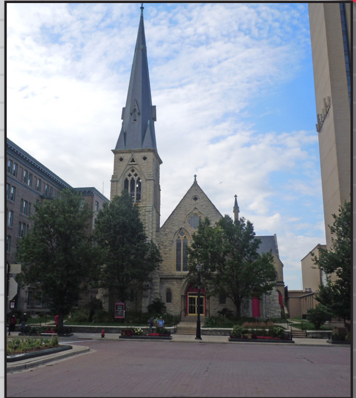
View looking South from Wisconsin Ave.