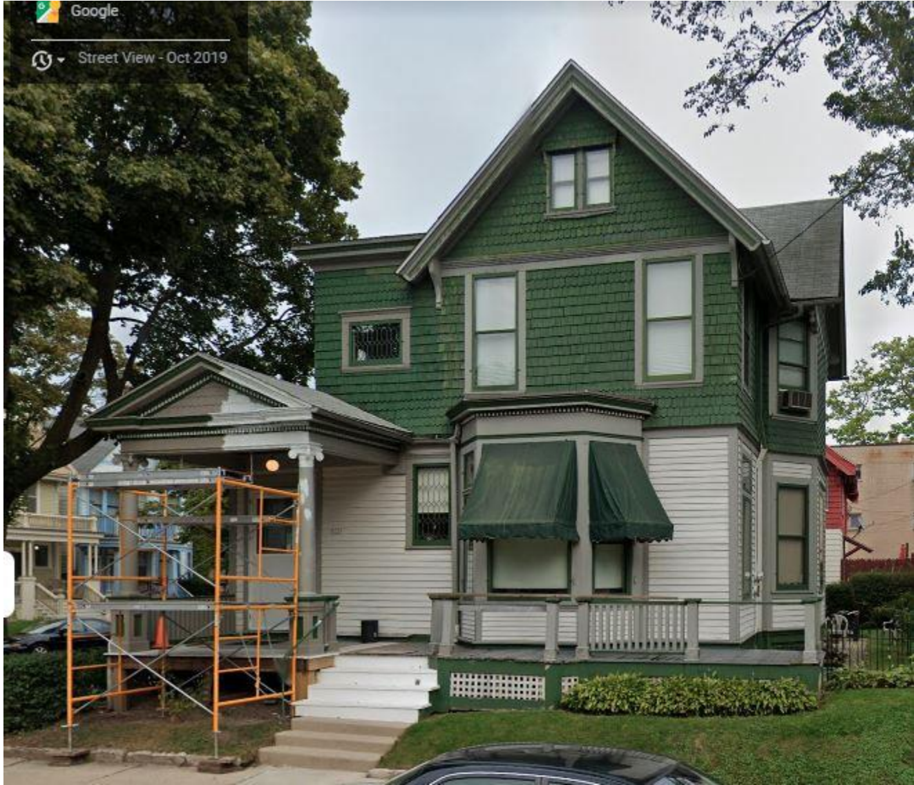
856 N. 29 th Current Photo