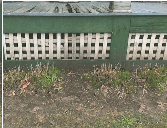
Condition of skirting and decking