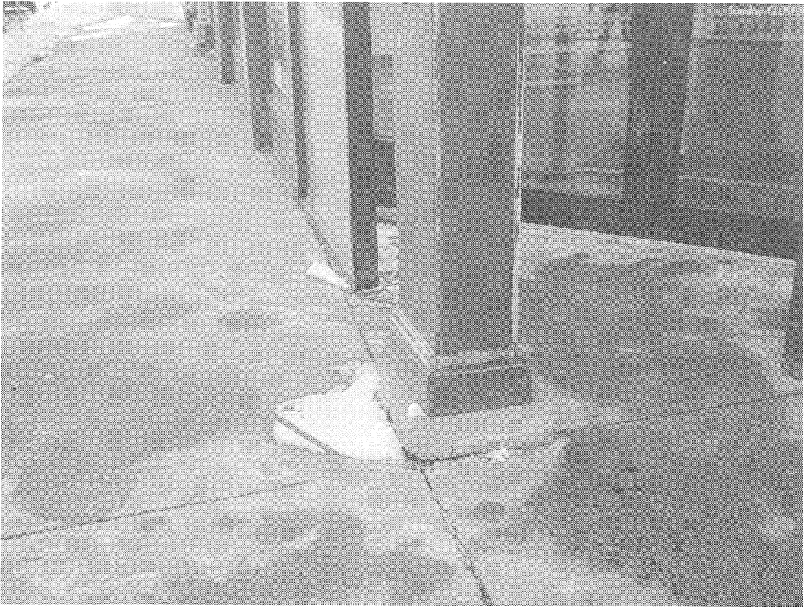
Image 37 - Date: 01-16-2014 – East Elevation (Wood Column)