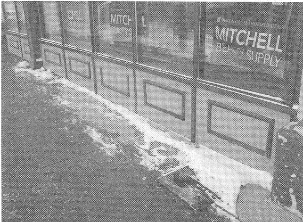
Image 30 - Date: 01-16-2014 - North Elevation (Damaged and Missing Trim Under Existing Storefront)