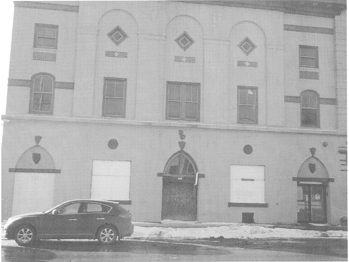
Image 41 - Date: 01-16-2014 – East Elevation (Windows & Doors Boarded Up)