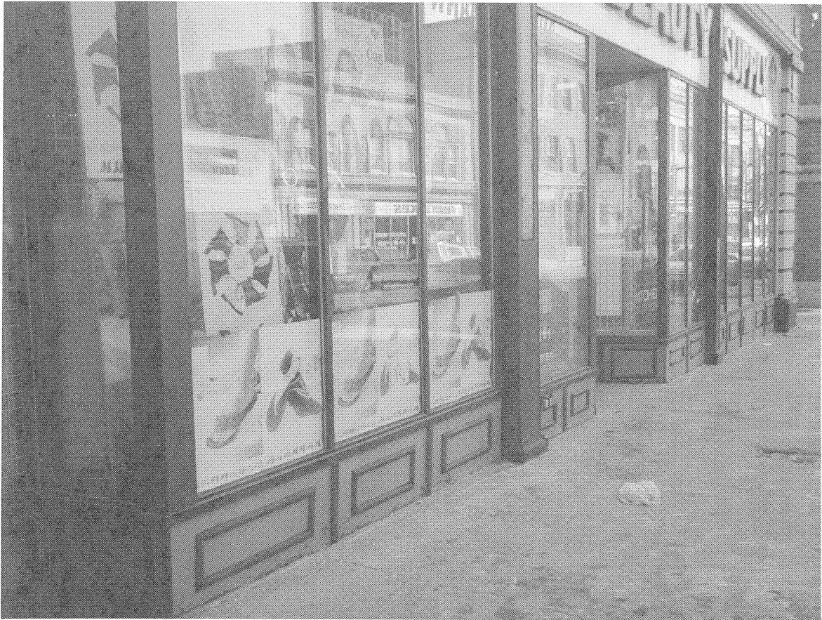
Image 33 - Date: 01-16-2014 – North Elevation (Storefront Base)