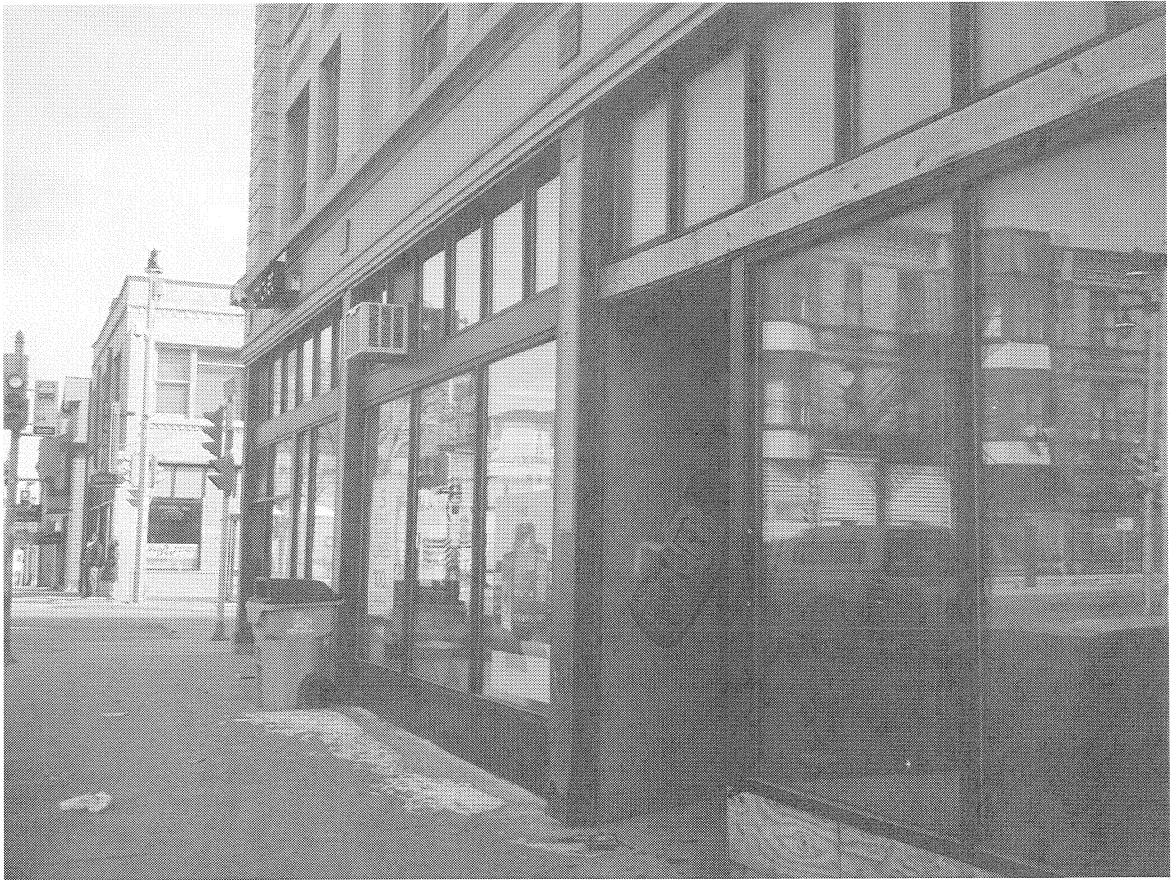
Image 35 - Date: 01-16-2014 – North Elevation (Storefront Missing Aluminum Trim)