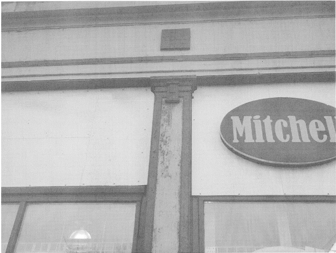
Image 31 - Date: 01-16-2014 – North Elevation (Existing Metal Pilaster with Capital)