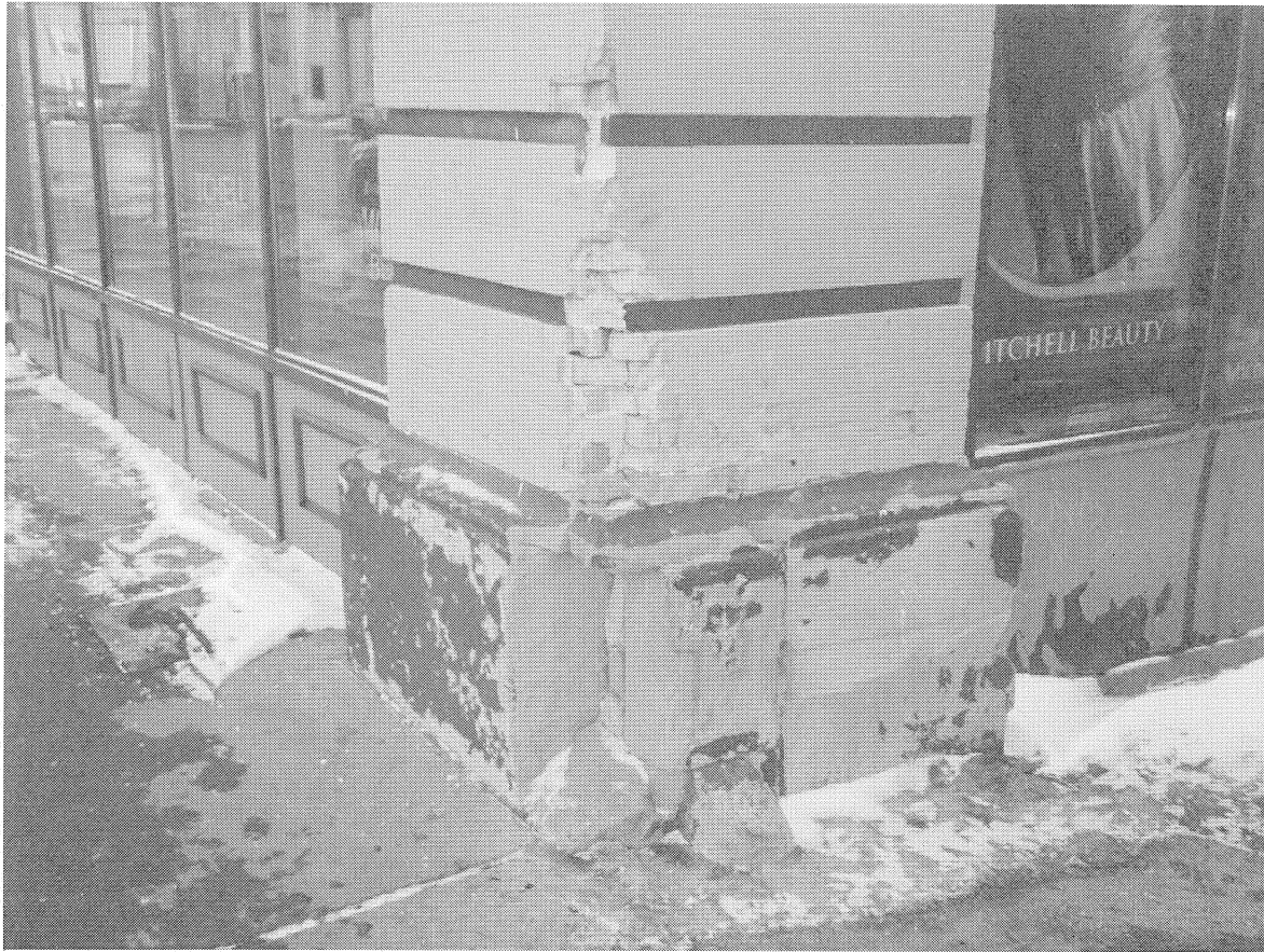
Image 29 - Date: 01-16-2014 - Damaged Northwest Corner and Missing Trim Under Existing Storefront