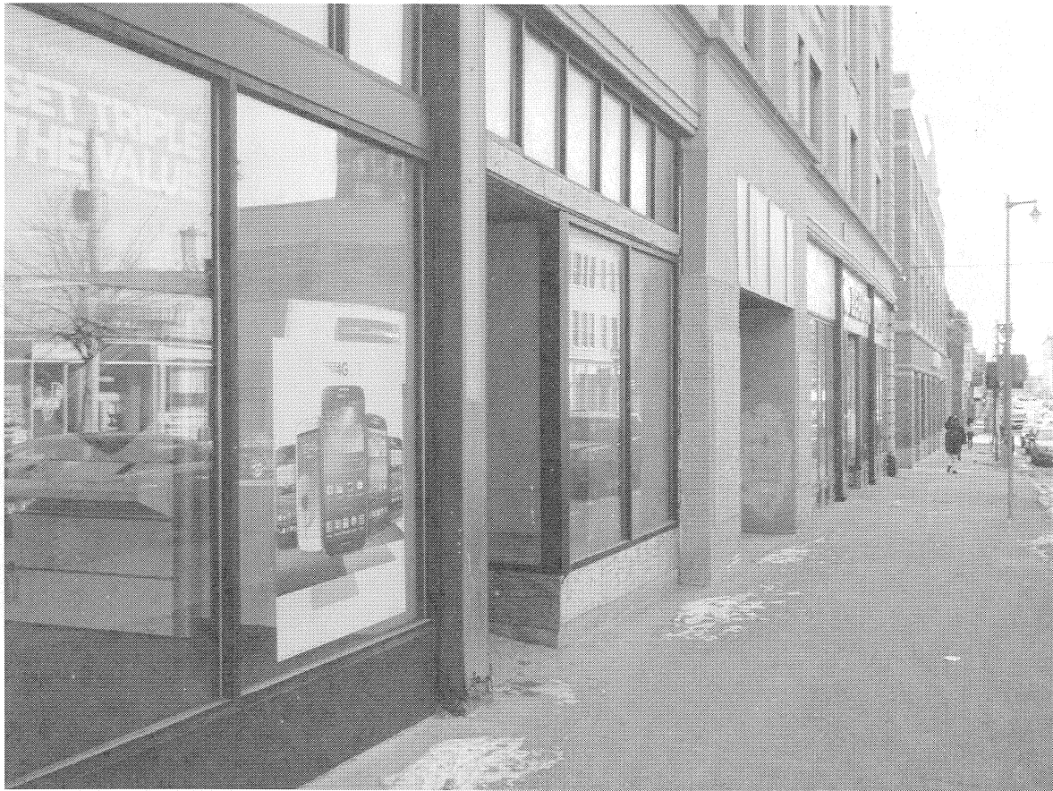
Image 34 - Date: 01-16-2014 – North Elevation (Storefront Missing Aluminum Trim)