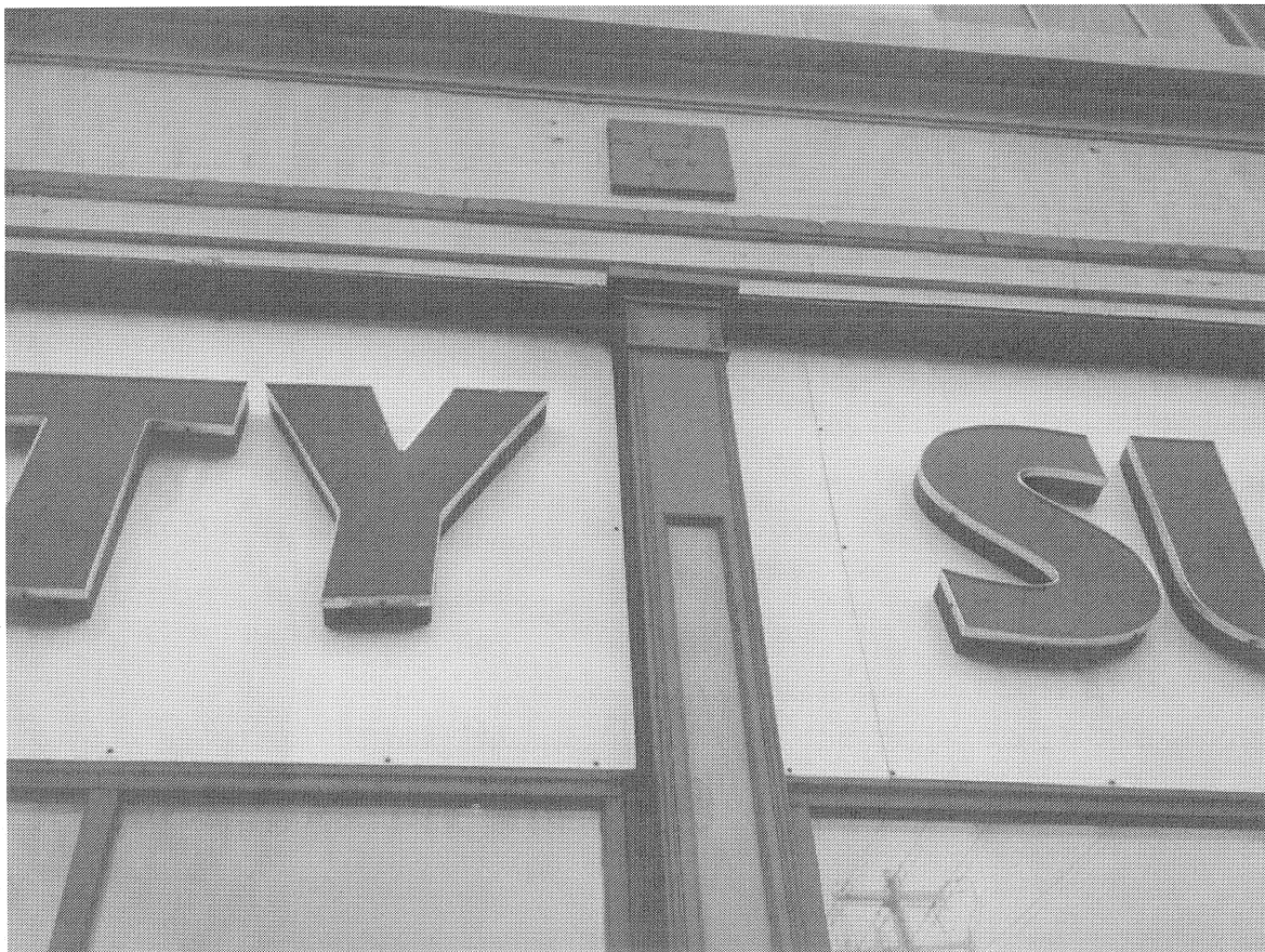
Image 32 - Date: 01-16-2014 – North Elevation (Wood Pilaster without Capital)