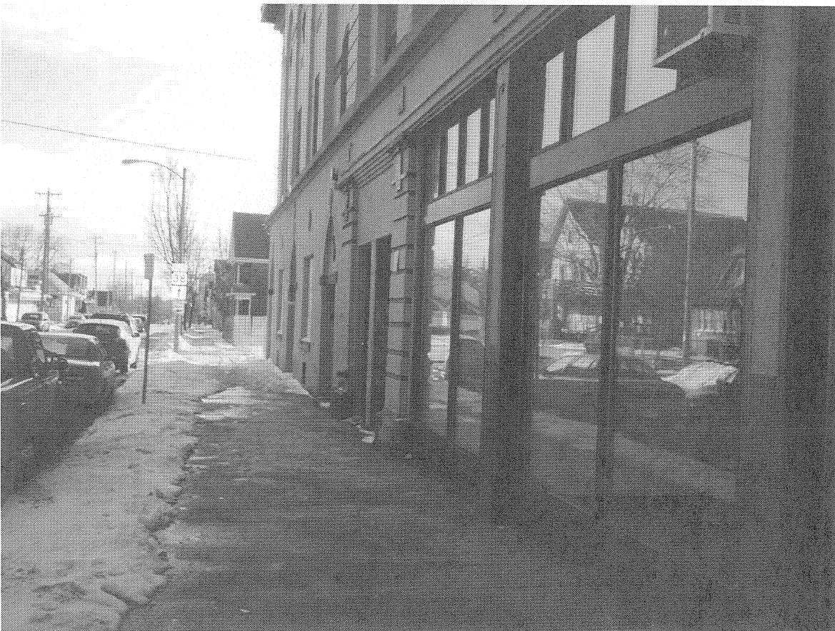
Image 38 - Date: 01-16-2014 – East Elevation (Looking South)