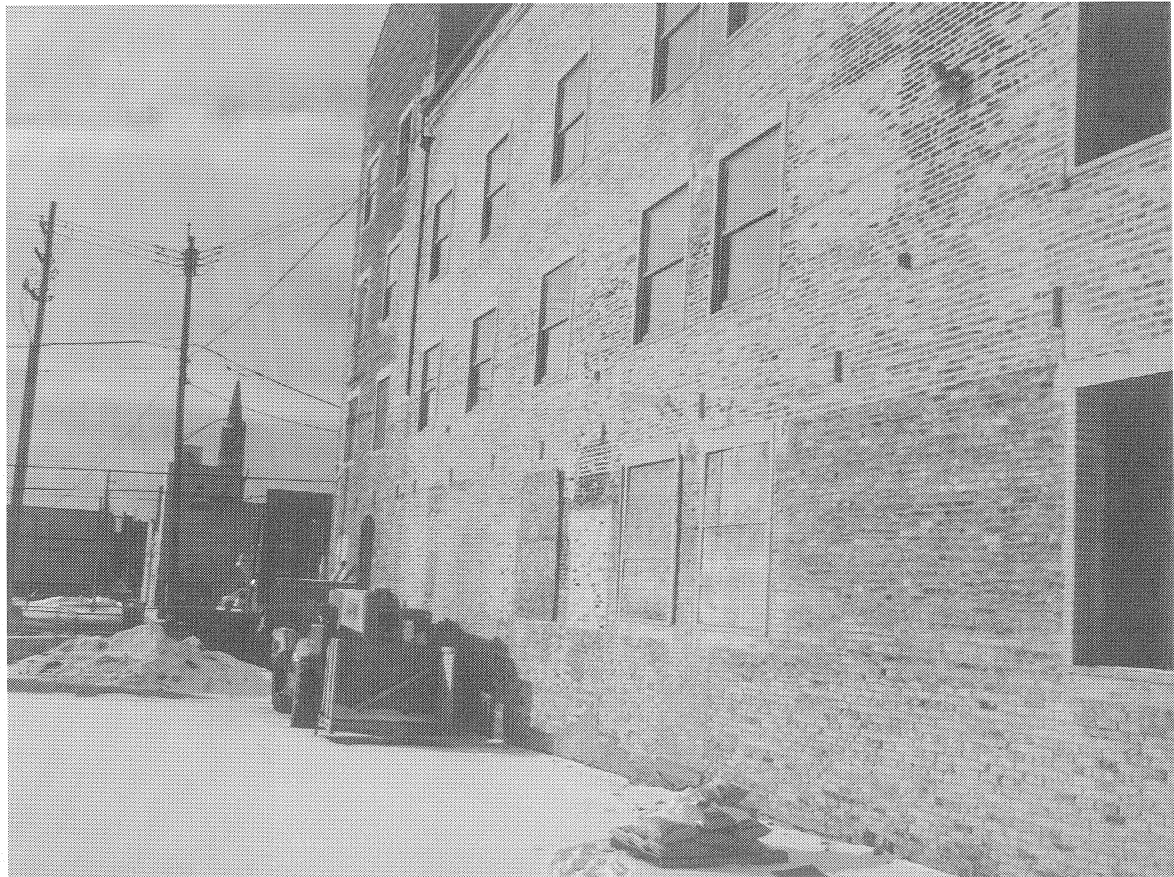
Image 42 - Date: 01-16-2014 – South Elevation (Windows Boarded Up)