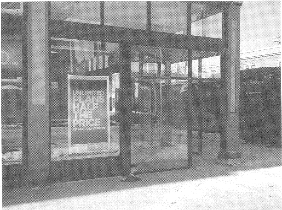
Image 36 - Date: 01-16-2014 – East Elevation (Storefront & Wood Column)