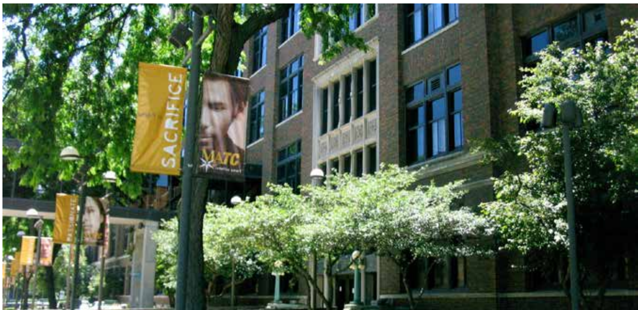
The Milwaukee Area Technical College is an integral part of Milwaukee’s higher education system.

With a dozen colleges in the city, Milwaukee has a large student population that represents a significant talent pool for local employers. However, merely attending college here is not sufficient to ensure that these students will stay in Milwaukee after graduation. A concerted effort to engage college students in the larger life of Milwaukee has the potential to increase the retention of college graduates here.