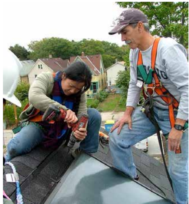
A growing "green jobs" sector can provide quality employment without requiring a college degree.

However, less than one in six job openings was available to individuals with only a high school diploma. Approximately 31% of city residents have only a high school diploma, and 18% did not complete high school at all. 10 Without basic high school credentials and some post-secondary training, the employment outlook for these individuals is poor. Thirty years ago, a high school degree would have been a "terminal" degree for factory and clerical workers in Milwaukee. Now it is just one stop on the path to job readiness.