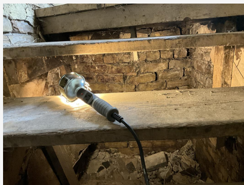
2 - 1