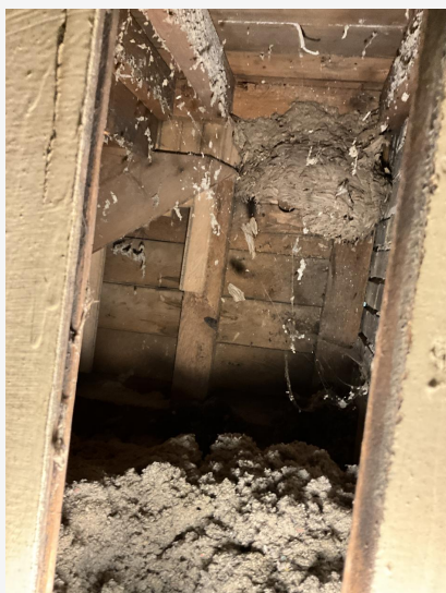
3 - 1