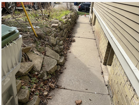
1 - 1