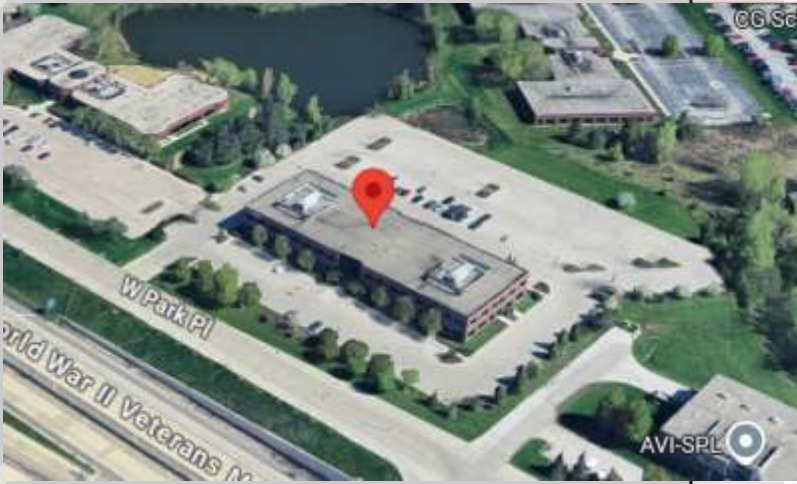
Front Elevation (West):