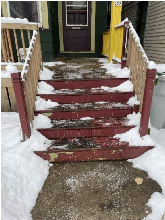
Photo 2 - Front Steps and Porch of the Lower Unit Showing a Sinking Foundation and Deterioration