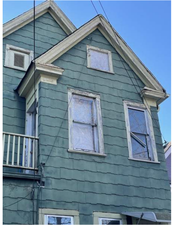
Photo 9 - The Two Windows on the East Elevation that will be Replaced with New All-Wood Windows