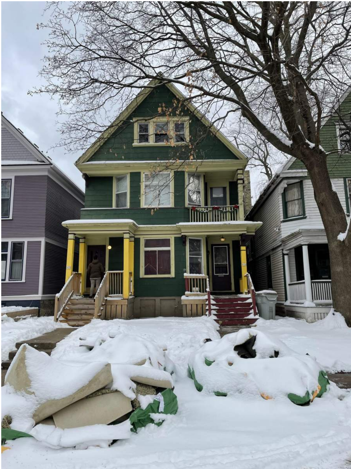
Photo 1 - West Elevation of the House Facing N. 29th Street