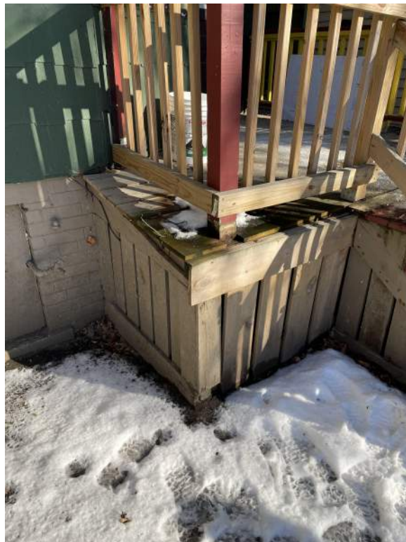
Photo 4 - Front Porch of the Lower Unit Showing a Sinking Foundation and Deterioration