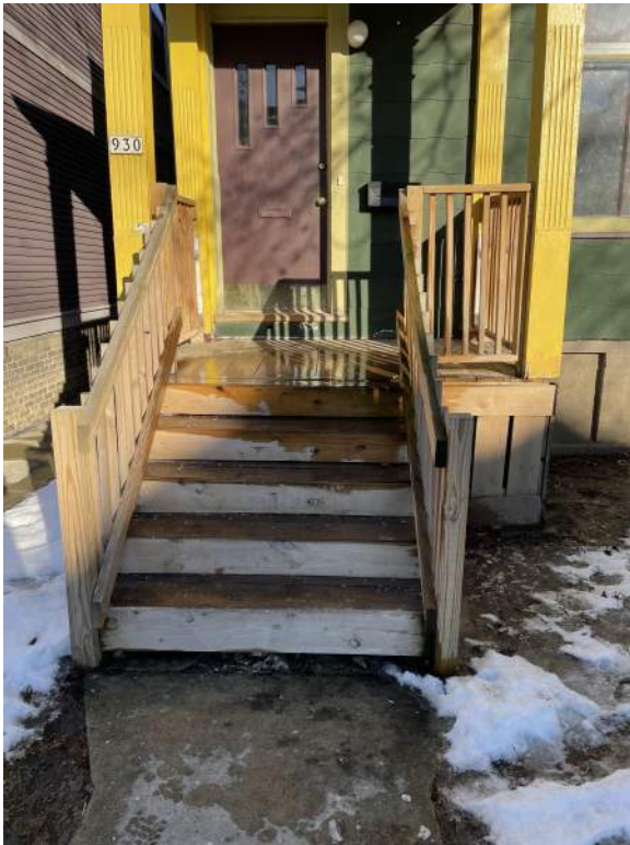
Photo 5 - Front Steps and Porch of the Upper Unit Showing a Sinking Foundation and Deterioration