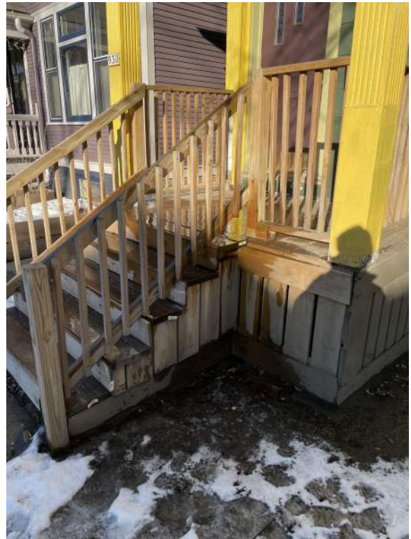
Photo 6 - Front Porch and Handrails of the Upper Unit Showing a Sinking Foundation and Deterioration