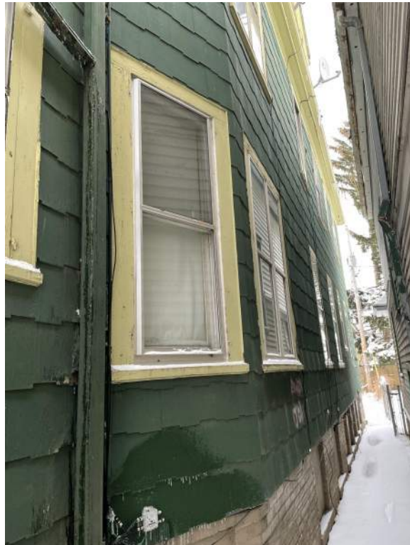
Photo 10 - View of the South Elevation Showing the First Floor Windows