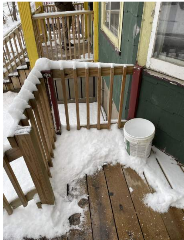
Photo 3 - Front Porch and Handrails of the Lower Unit Showing a Sinking Foundation and Deterioration