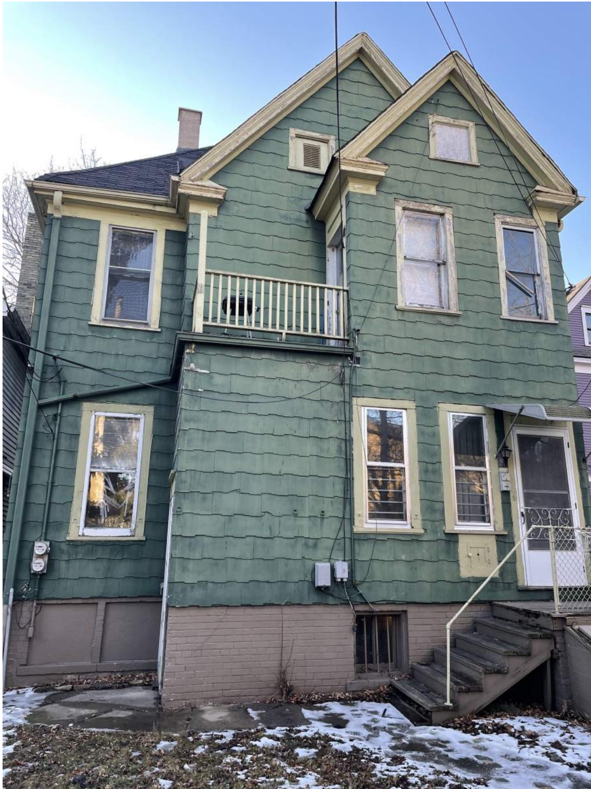
Photo 7 - East Elevation of the House Facing the Backyard