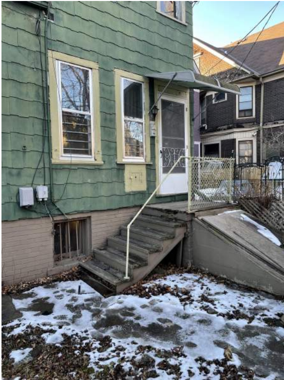
Photo 8 - Back Exterior Stairs Showing Deterioration