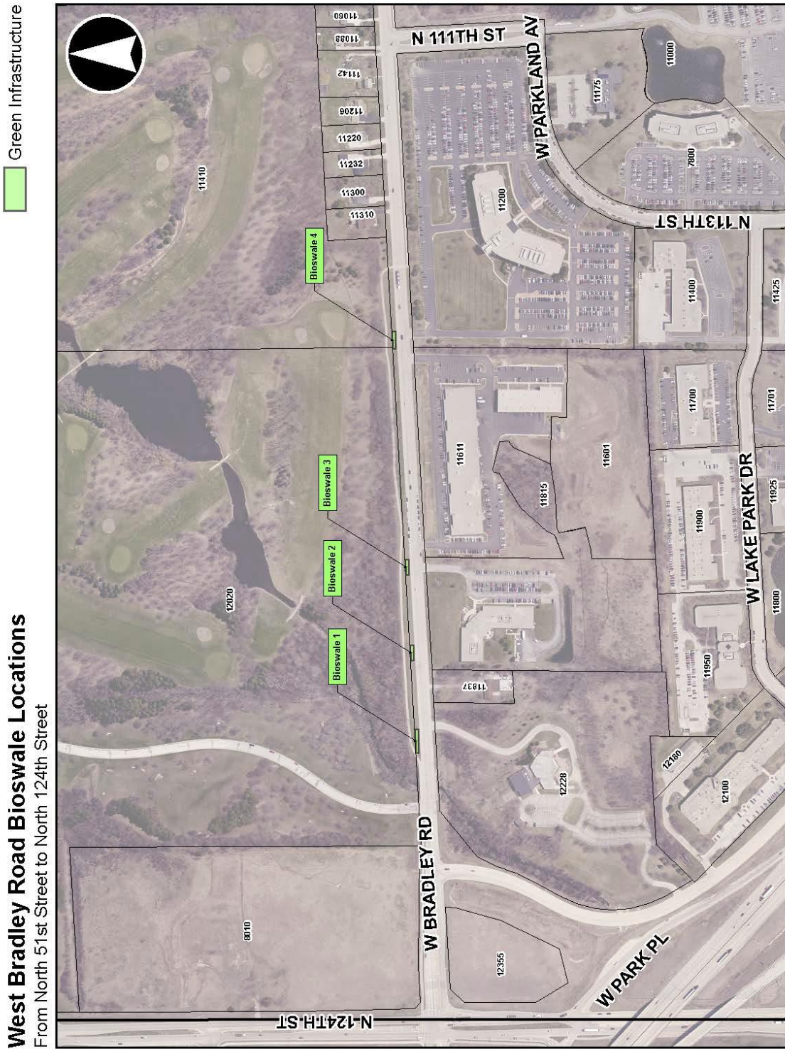
Exhibit A Bradley Road Bioswales